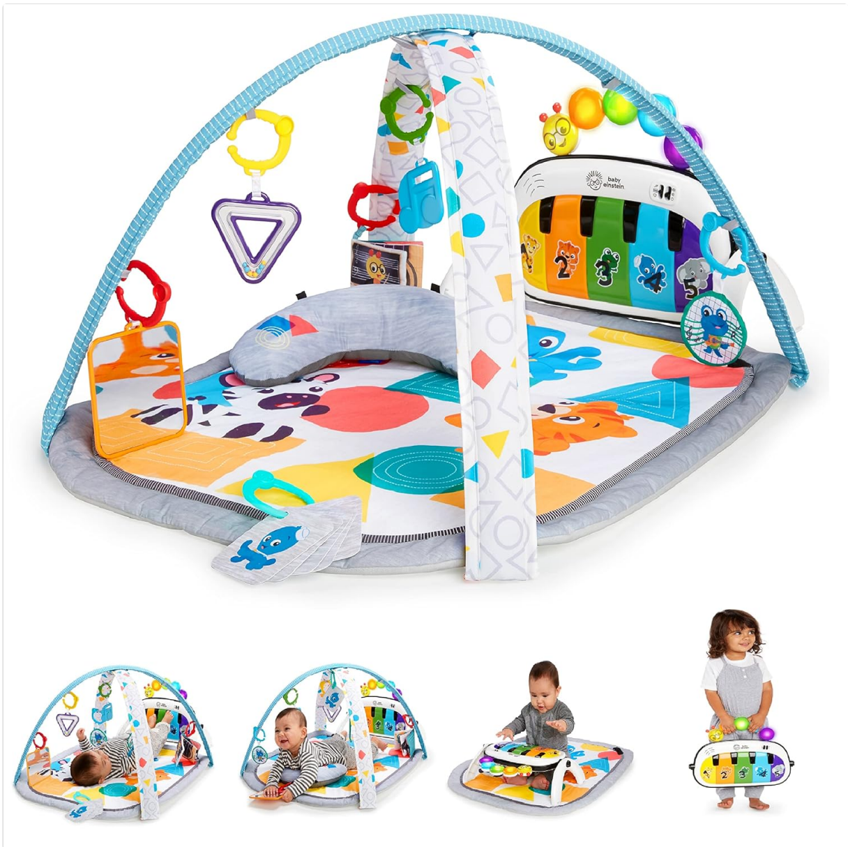
Image 2.1: Fully assembled Baby Einstein 4-in-1 Kickin' Tunes Play Gym, showing the mat, arches, piano, and hanging toys.