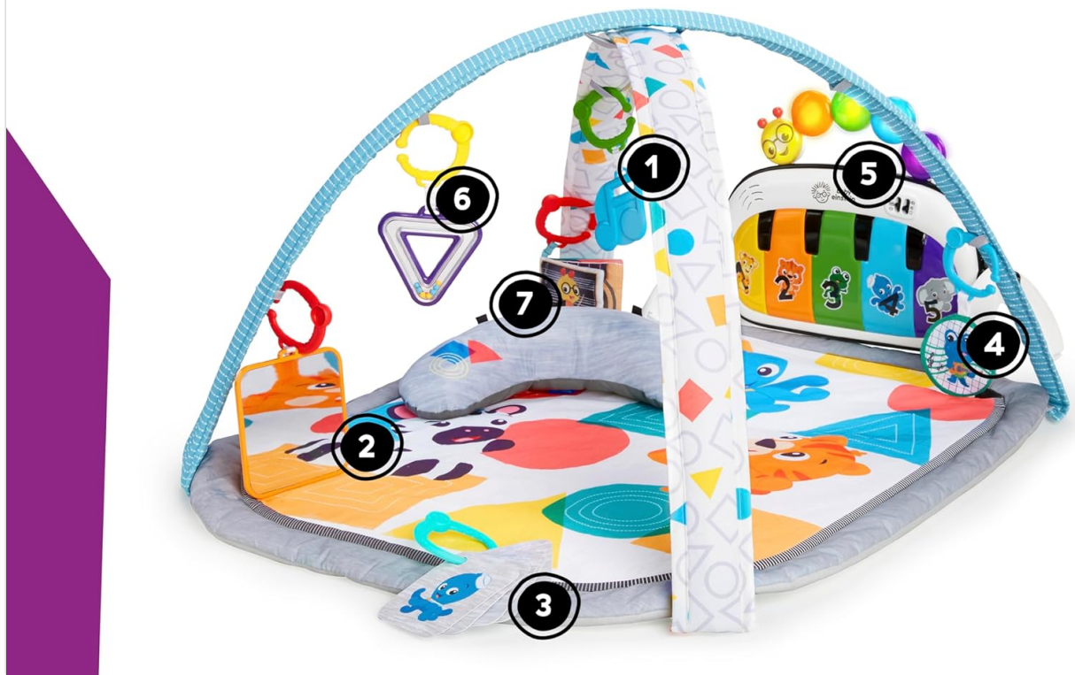
Image 3.1: Diagram illustrating the various components of the play gym, including the textured music note, baby-safe mirror, flash cards, crinkle toy, piano toy, rattle, and book.