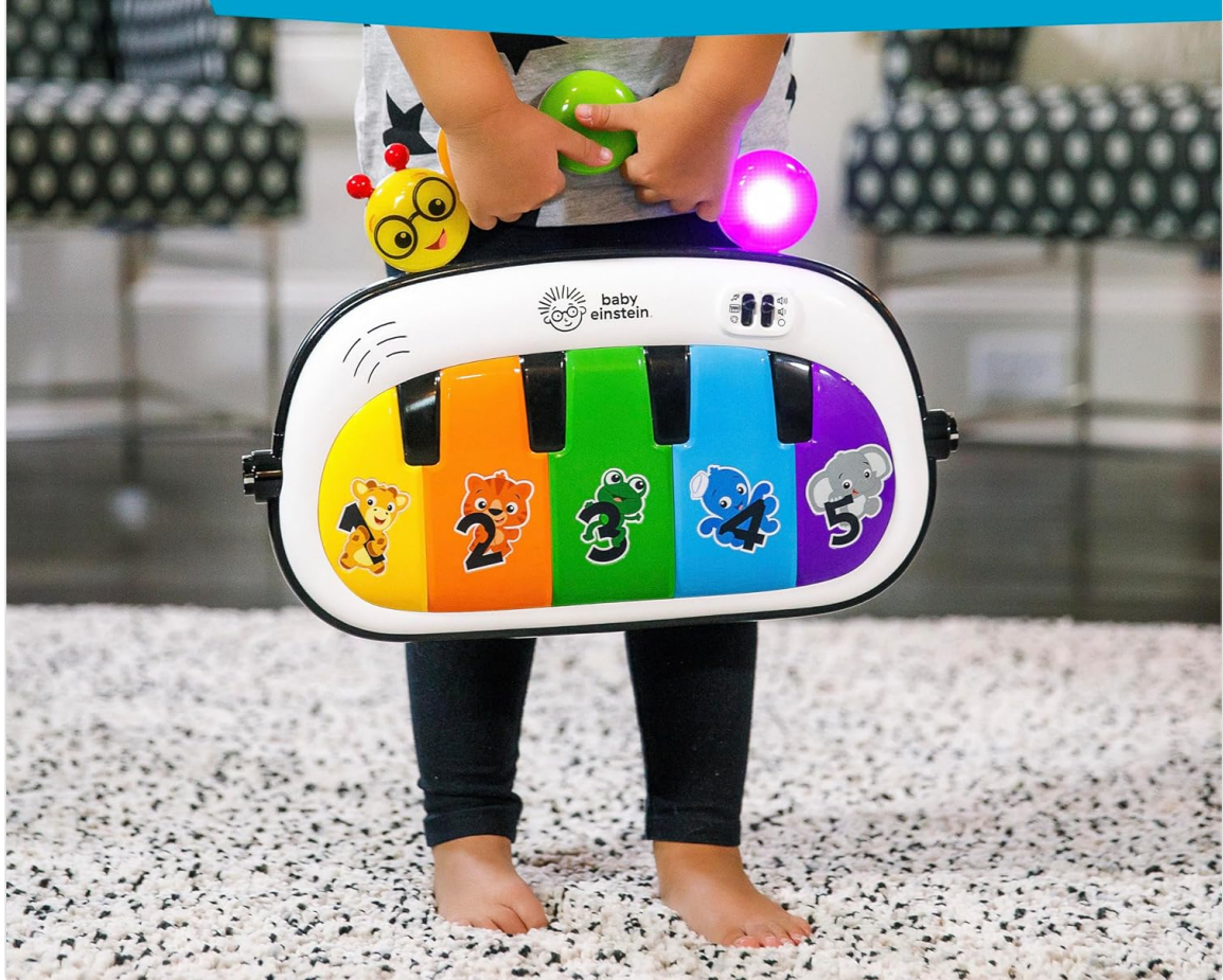
Image 5.5: A toddler holding the detachable piano, illustrating the 'On-the-Go' play option.