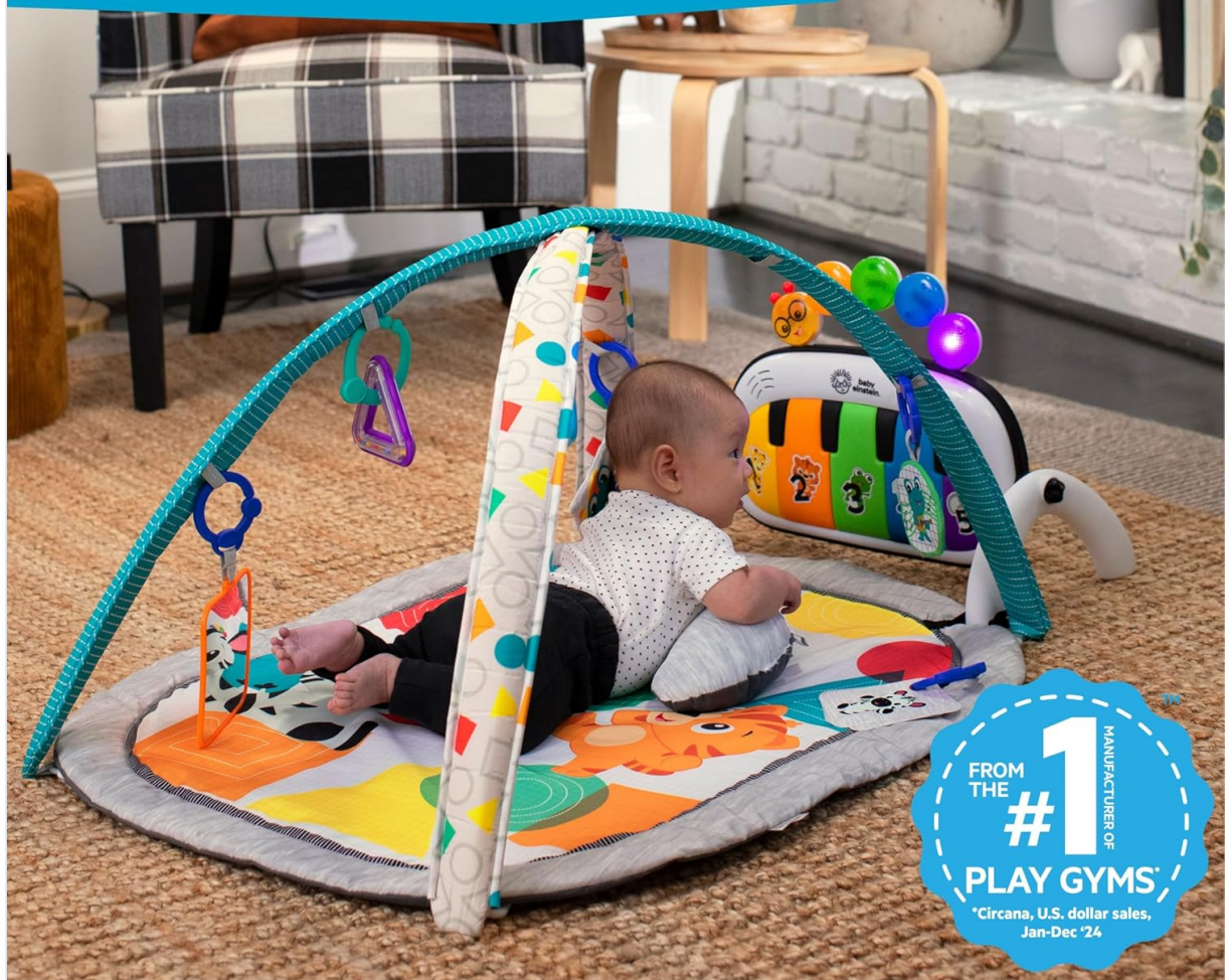
Image 6.1: Close-up of an infant's feet activating the Magic Touch piano, demonstrating its responsive design.

70+ sounds & activities; 25+ minutes of music