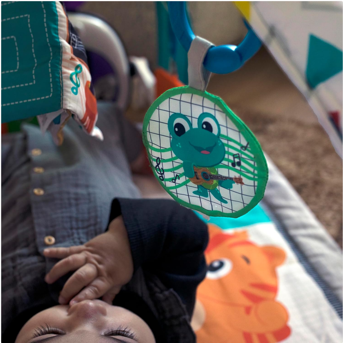
Image 5.3: An infant during 'Tummy Time', positioned to interact with the musical piano.