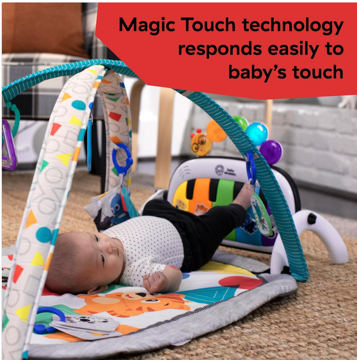
Image 5.2: An infant engaging in the 'Lay and Play' mode, interacting with the piano using their feet.