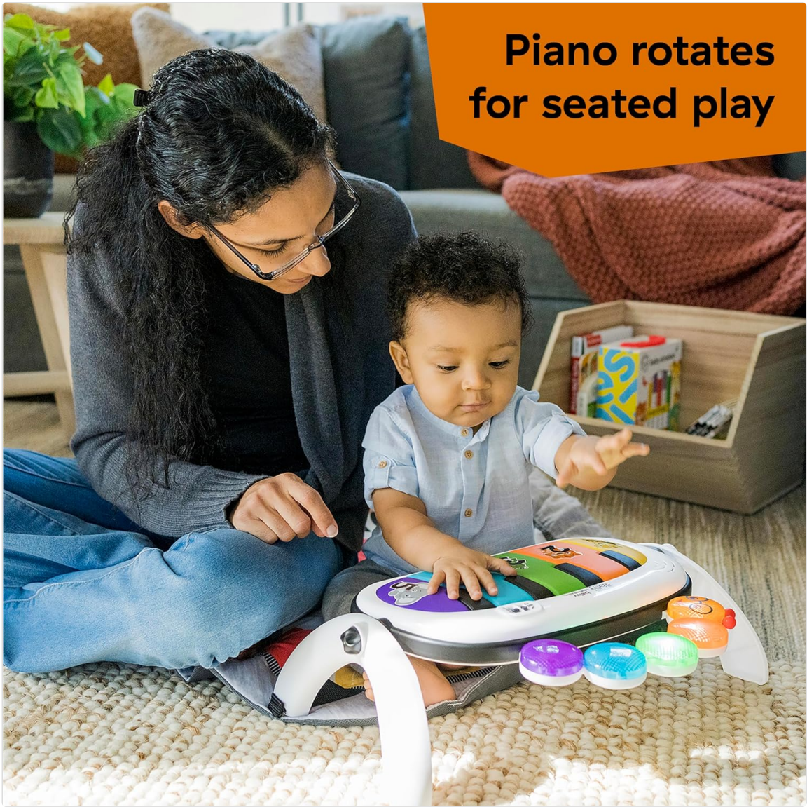
Image 5.4: An adult and infant demonstrating the 'Seated Play' mode, with the piano adjusted for hand interaction.