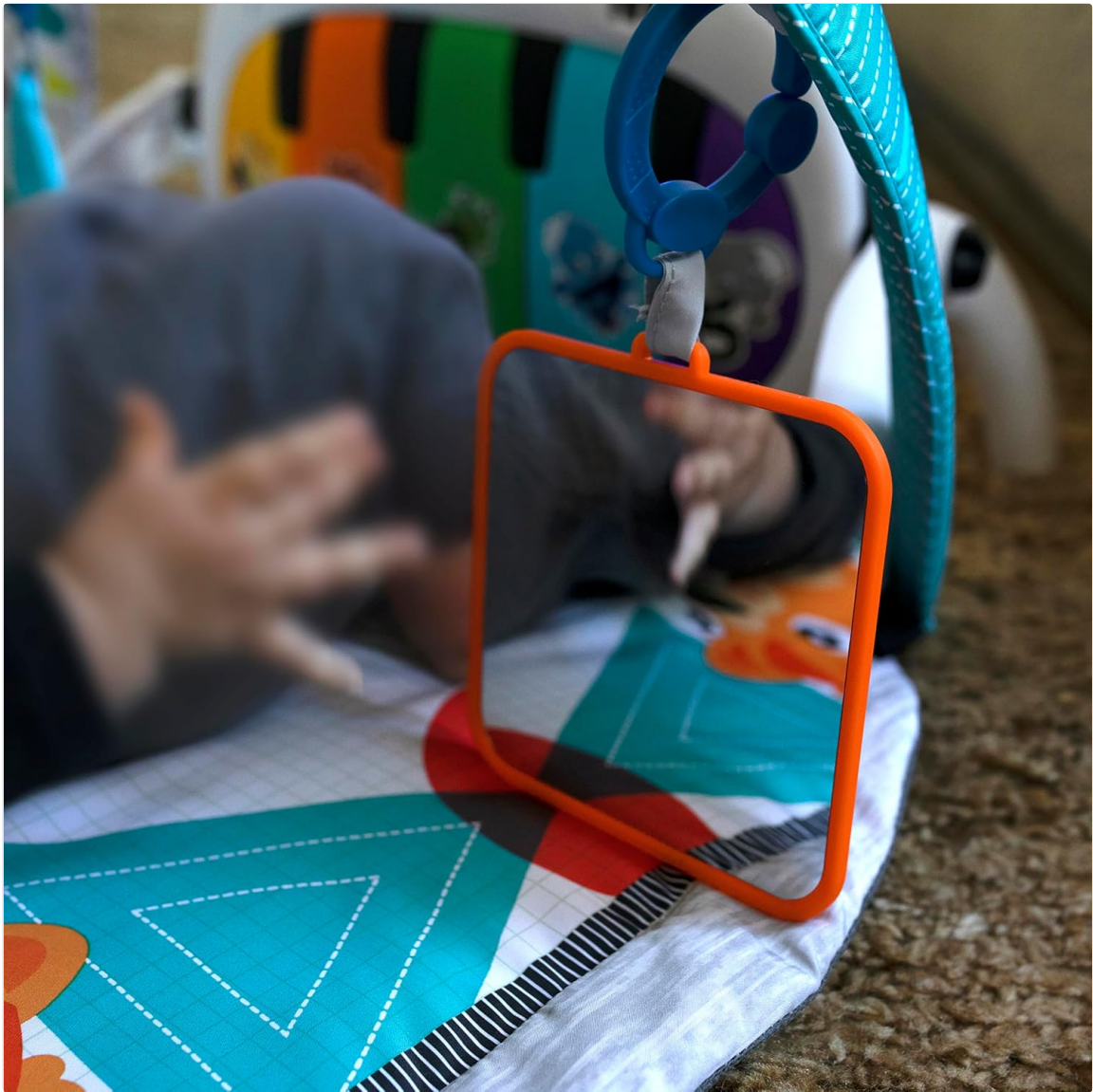
Image 6.3: A baby-safe mirror toy, encouraging self-recognition and visual play.