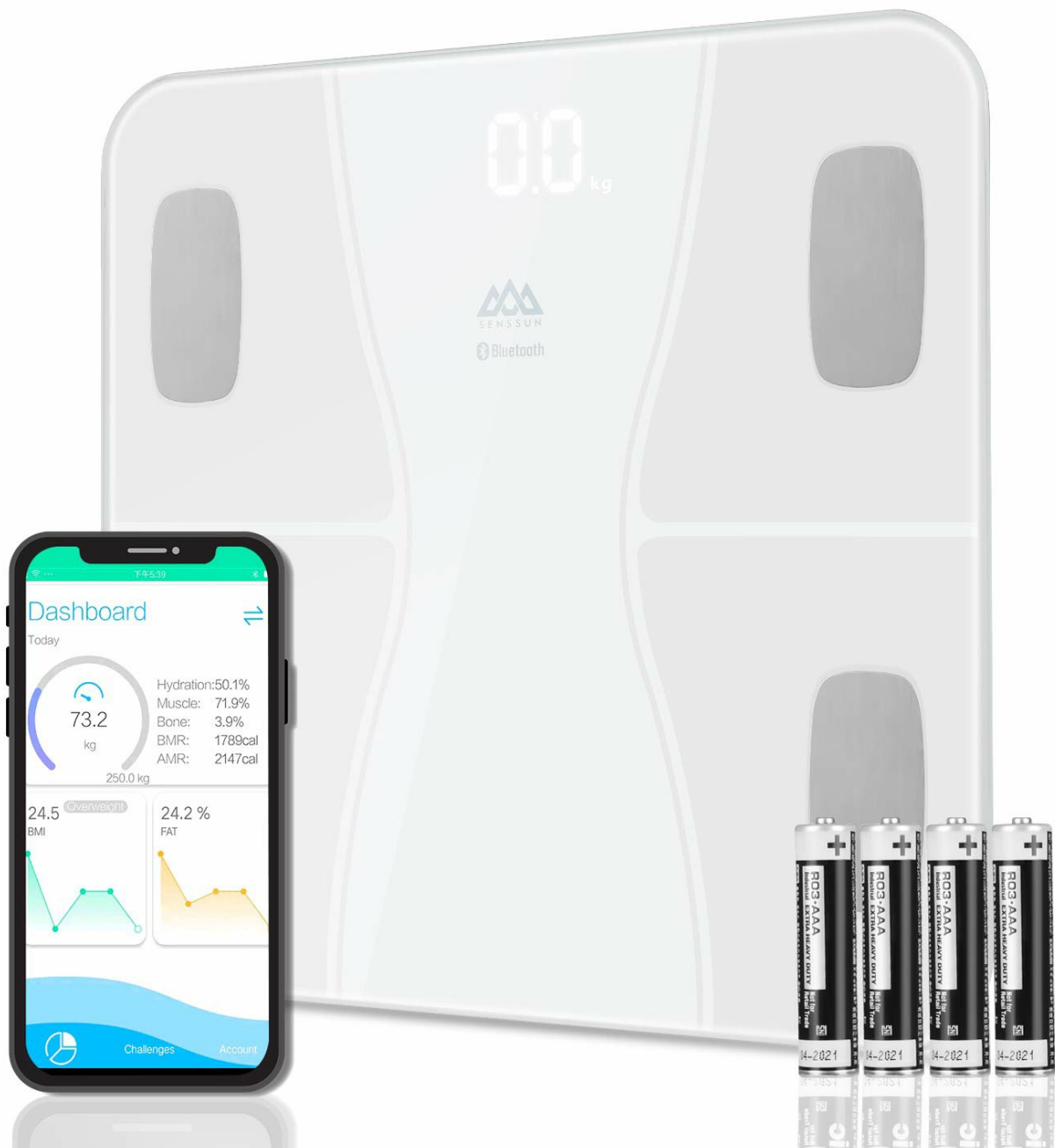
The SENSUN Smart Scale, showing its sleek design, accompanying mobile application, and the required AAA batteries.