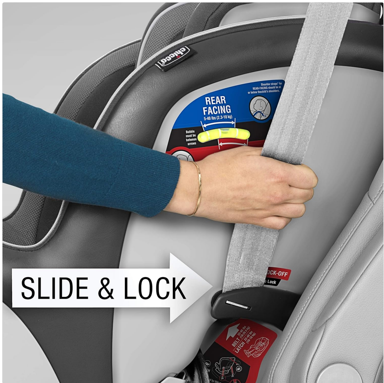
Image: Demonstrating the SuperCinch force-multiplying tightener for easy installation.