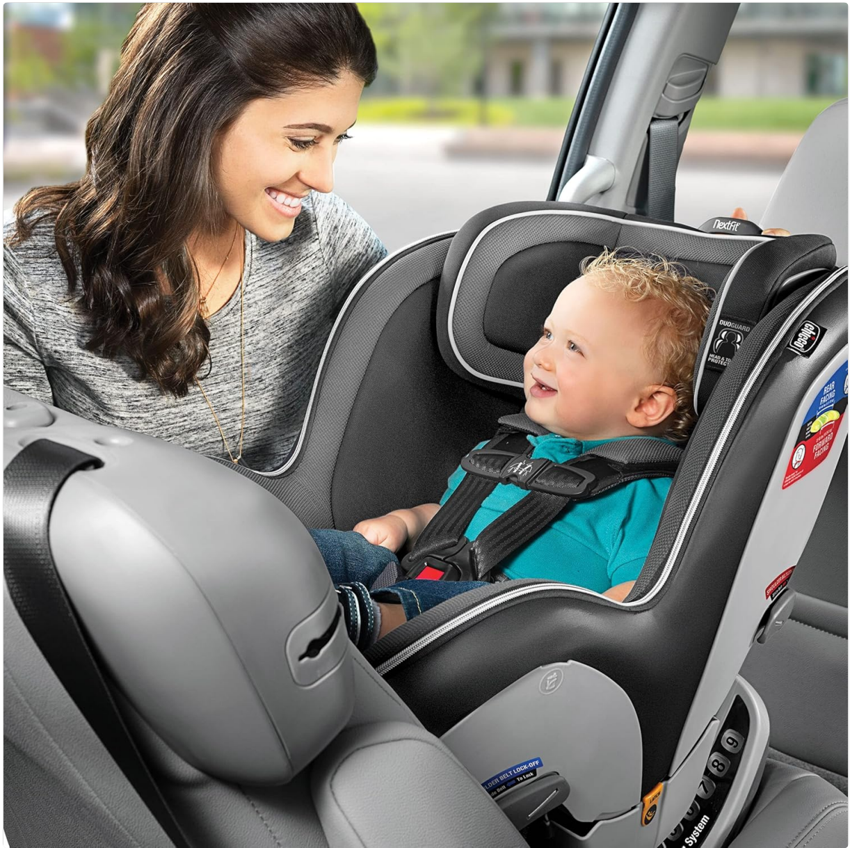
Image: A baby comfortably seated in the rear-facing position of the Chicco NextFit Zip car seat.