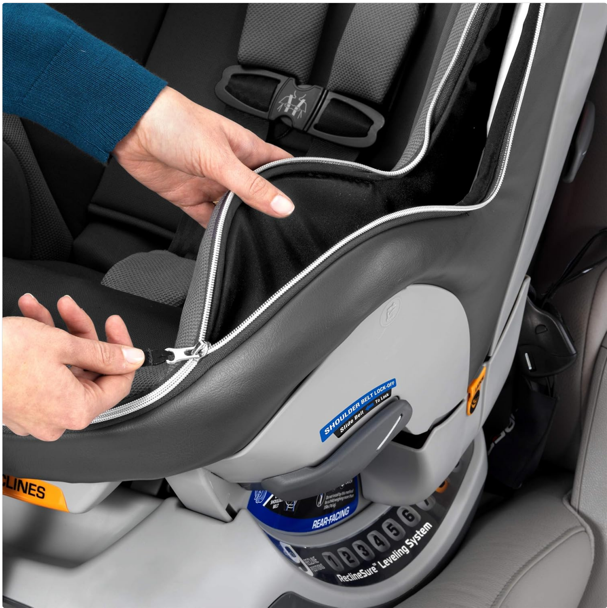
Image: The ReclineSure leveling system indicating proper rear-facing recline.