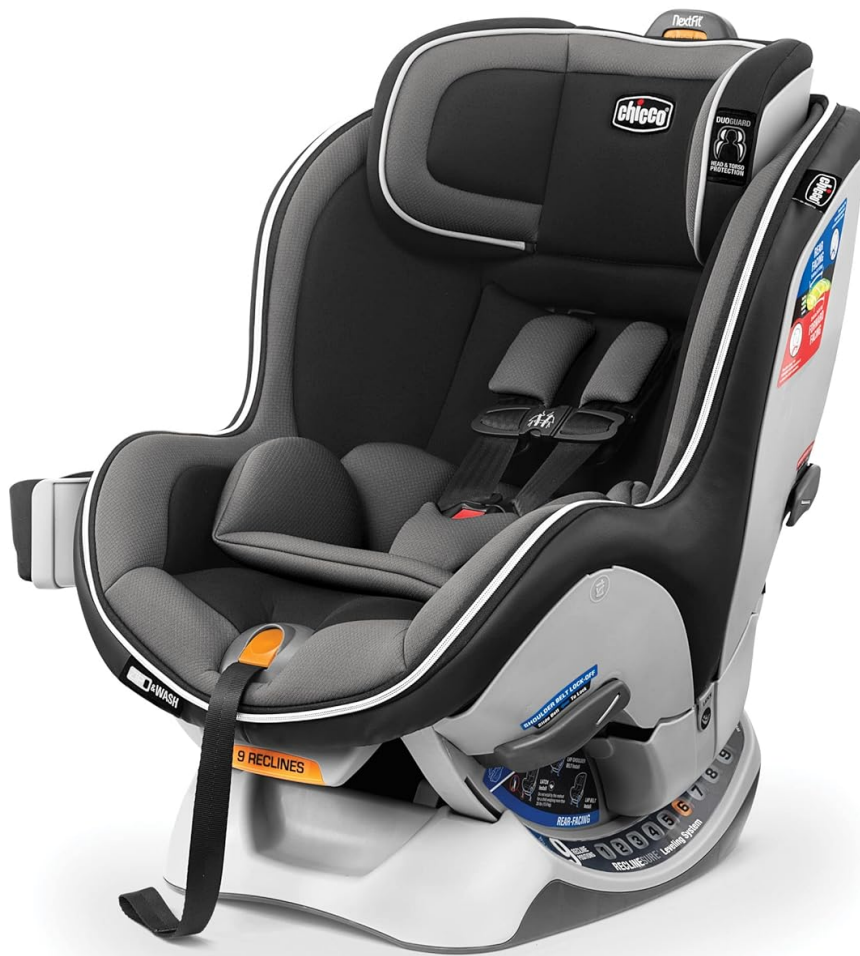
Image: The Chicco NextFit Zip Convertible Car Seat, showcasing its design and features.