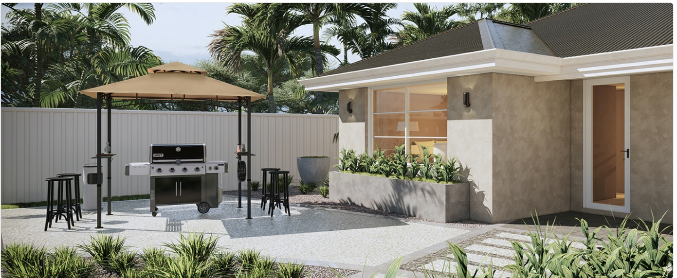
Figure 4: Multi-function hooks for convenient storage of grilling tools.