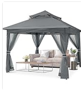
Figure 6: Sturdy top hook for hanging additional lighting or decorative items.