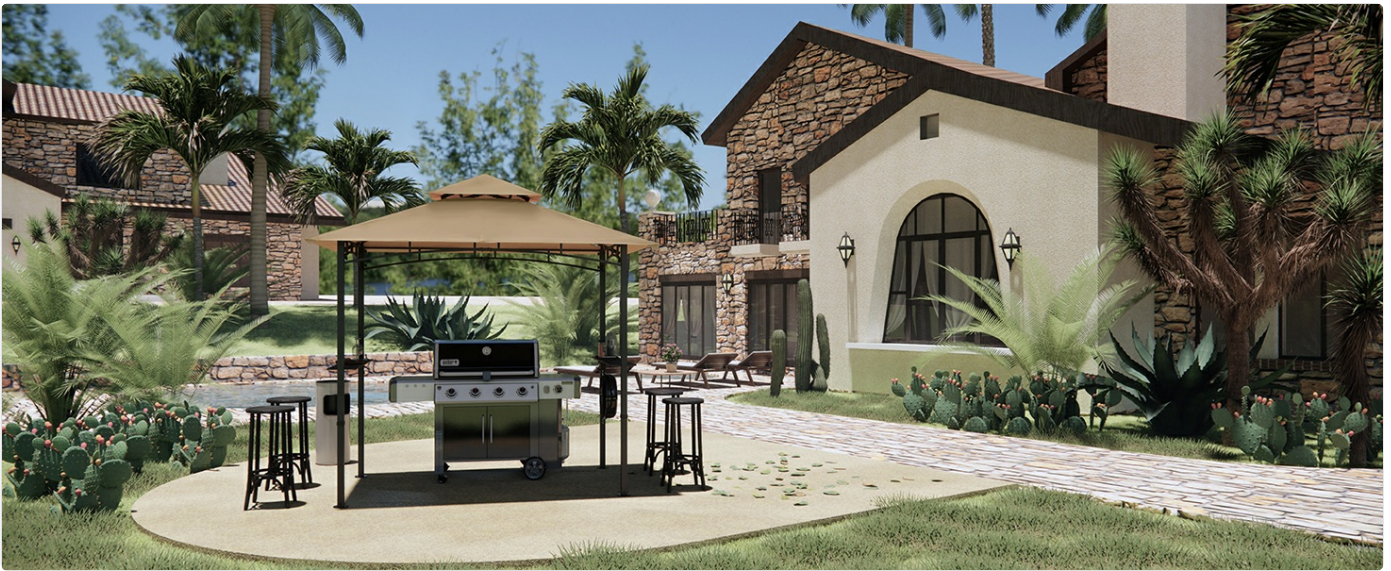
Figure 3: Side shelf with space for items, a bottle opener, and LED lights.