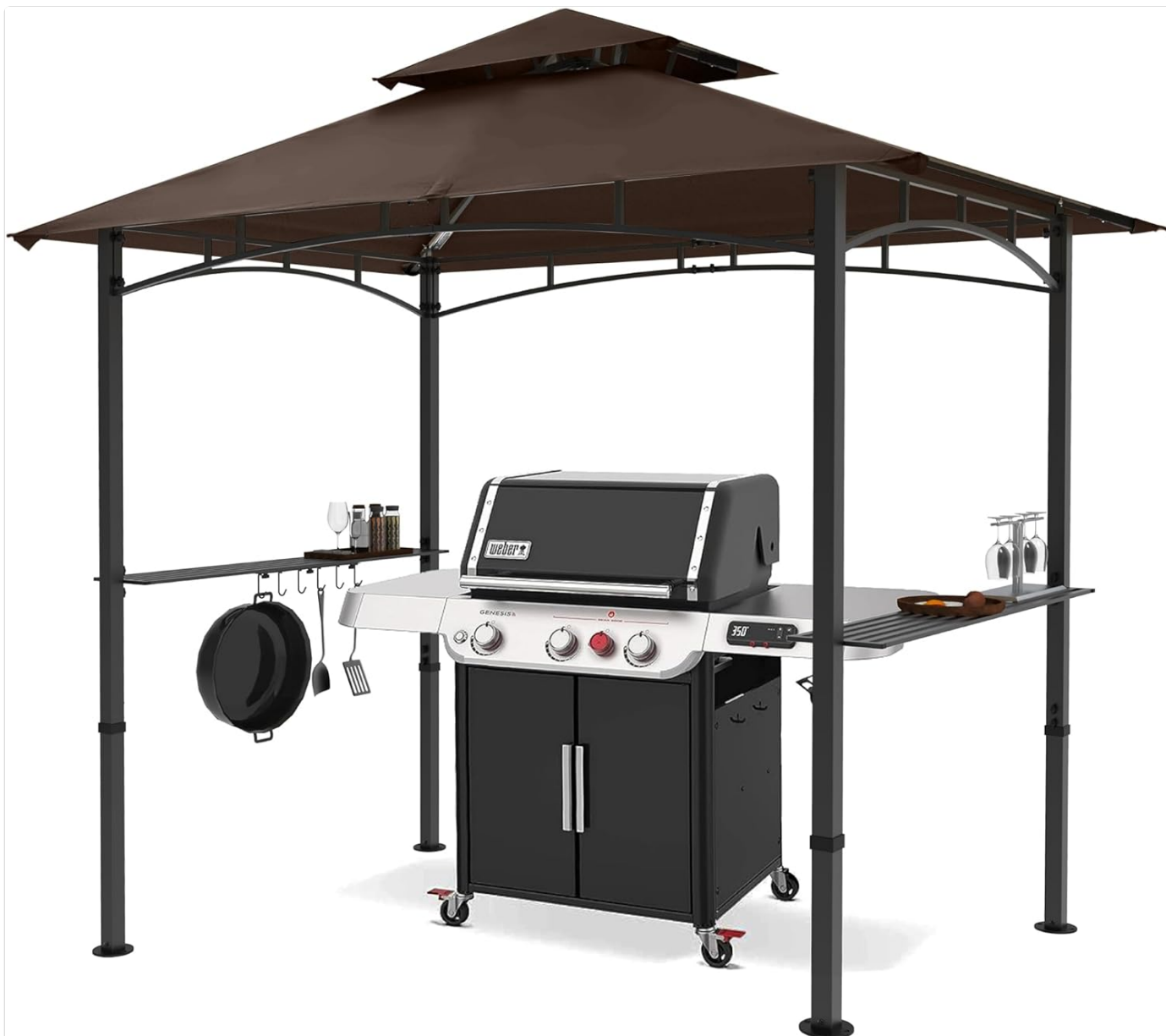
Figure 1: The MASTERCANOPY 8 x 5 Grill Gazebo providing shelter for a grill.