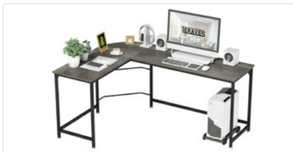
Figure 3: Adjustable leg pad for stability.