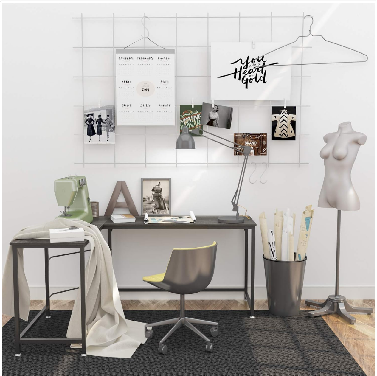
Figure 4: Desk in use, showcasing ample workspace.