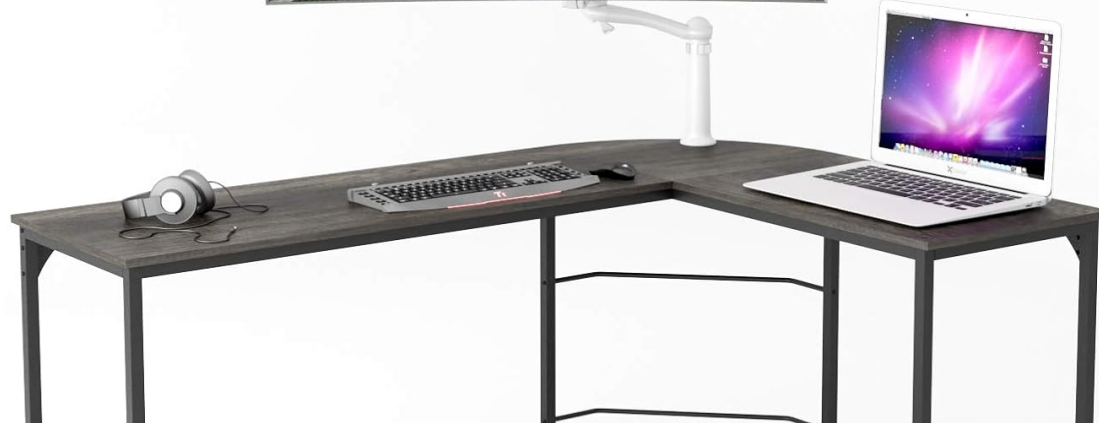
Figure 6: Waterproof engineered wood surface for easy cleaning.