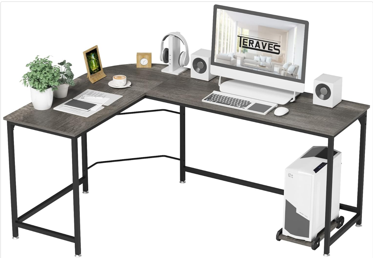
Figure 1: Teraves Reversible L-Shaped Desk (Black Oak)

The Teraves Reversible L-Shaped Desk is designed for versatility and functionality, suitable for various environments including home offices, study areas, and gaming setups. Its L-shaped configuration maximizes space and offers a modern aesthetic.