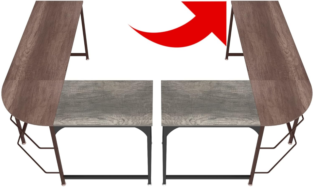
Figure 2: Reversible panel configuration for flexible setup.