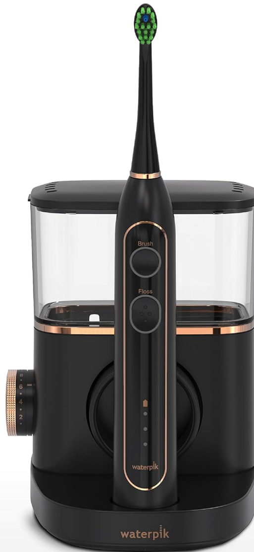
Image: Waterpik Sonic-Fusion unit with warranty information and customer support details.

Customer Service 1-888-226-3042 Monday-Friday 7 am – 5pm MST