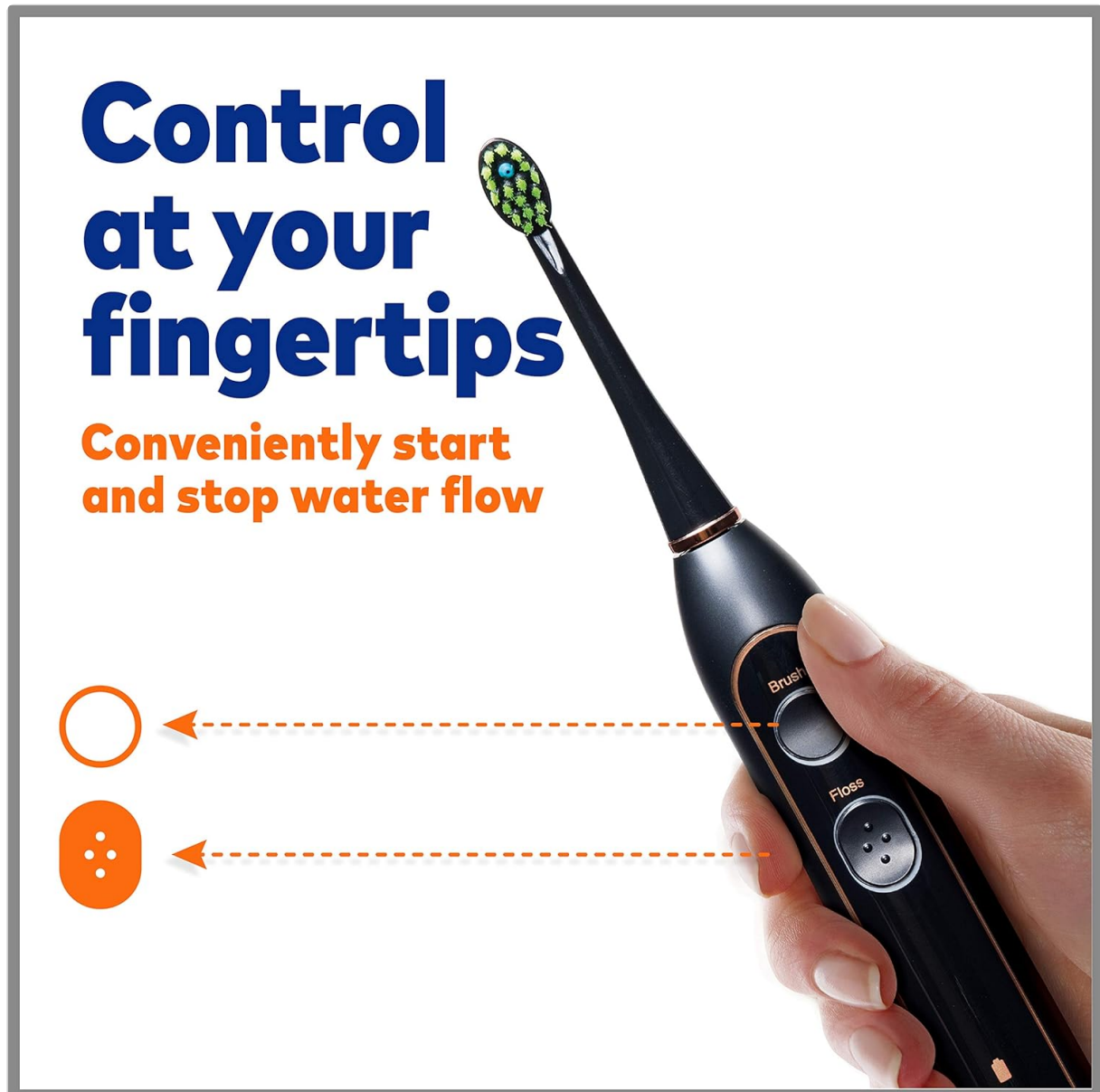
Image: The control panel on the Waterpik Sonic-Fusion handle, featuring distinct buttons for Brush and Floss modes.