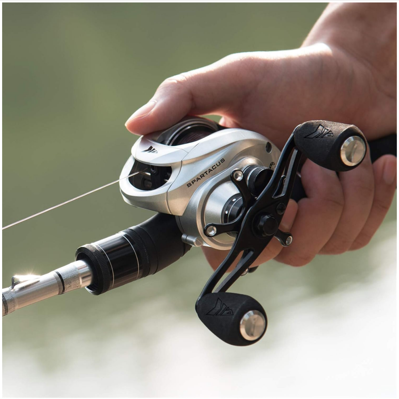
Figure 3.1: Reel attached to rod with line spooled