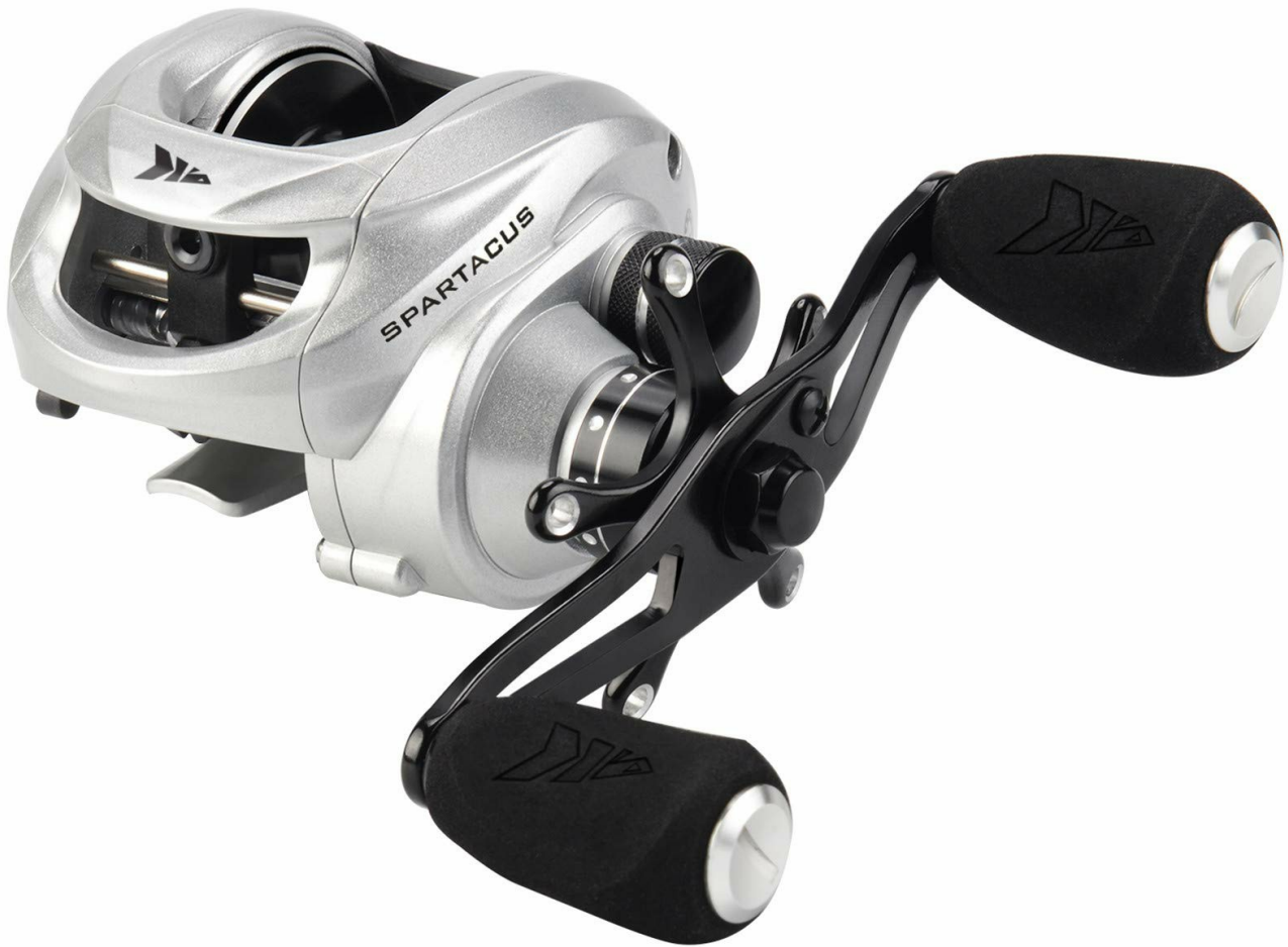
Figure 2.1: KastKing Spartacus Baitcasting Fishing Reel (Left Handed)