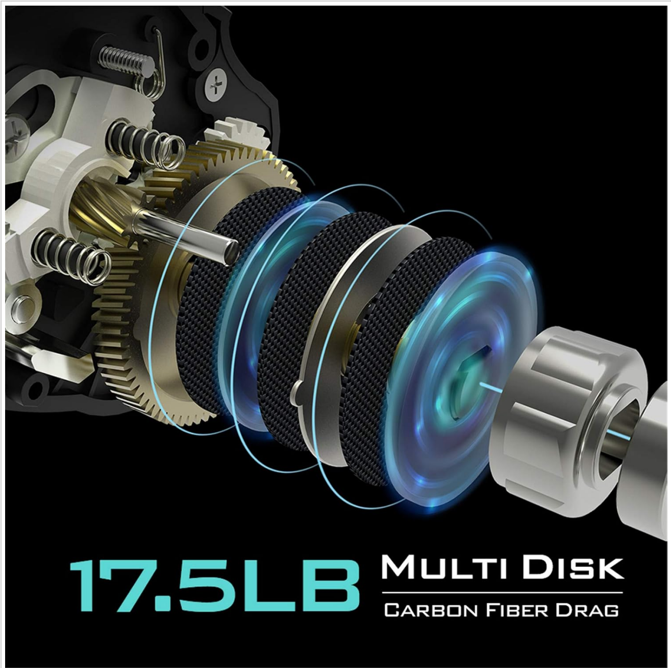
Figure 4.1: Multi-Disk Carbon Fiber Drag System

The drag system controls the amount of force required to pull line from the reel. Adjust the drag by turning the star-shaped knob located next to the handle. Turn clockwise to increase drag tension and counter-clockwise to decrease it. Set the drag to approximately 25-30% of your line's breaking strength.