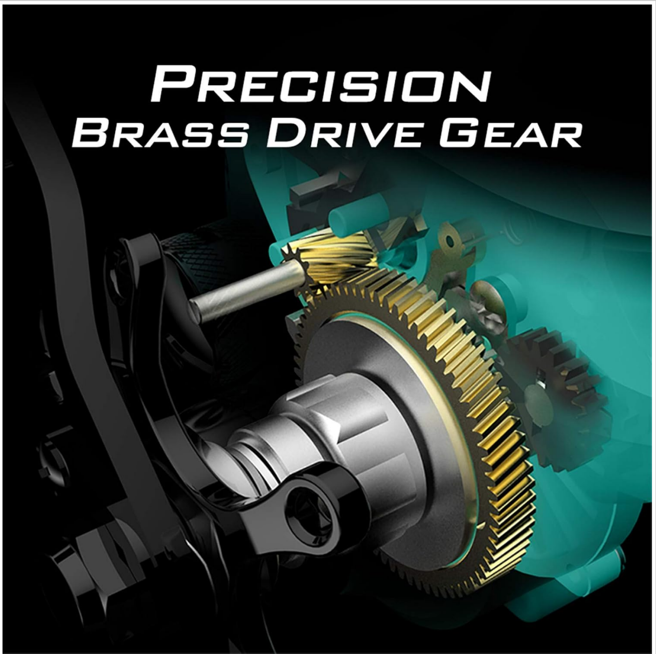
Figure 4.2: Precision Brass Drive Gear