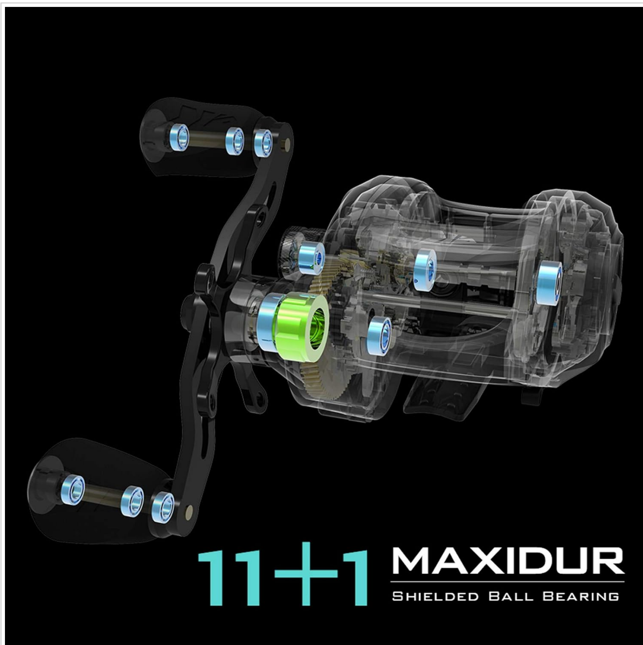
Figure 4.3: Maxidur Shielded Ball Bearing System