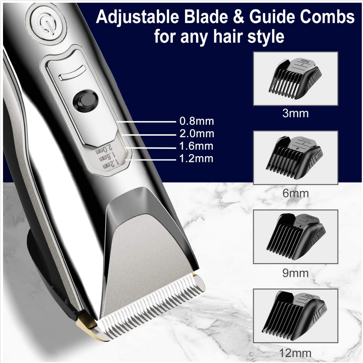
Image: Illustration showing the adjustable blade settings (0.8mm, 1.2mm, 1.6mm, 2.0mm) and the four included guide combs (3mm, 6mm, 9mm, 12mm).