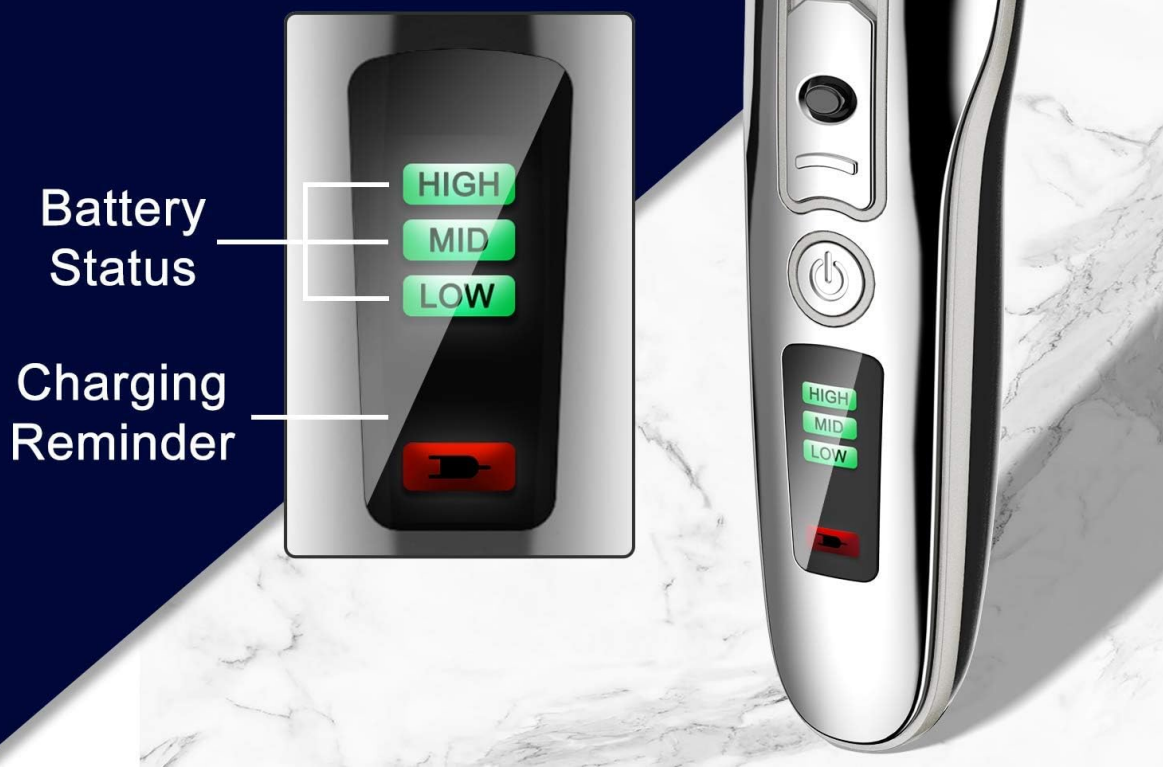
Image: Close-up of the LED display on the Paubea K18MHC, indicating battery status (High, Mid, Low) and a charging reminder icon.