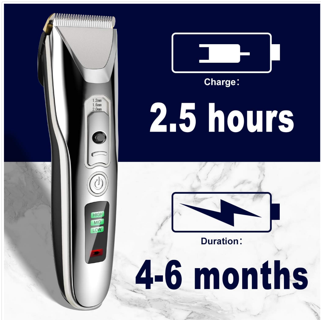
Image: Illustration showing the charging process and battery duration information for the Paubea K18MHC hair clippers. A full charge takes 2.5 hours.