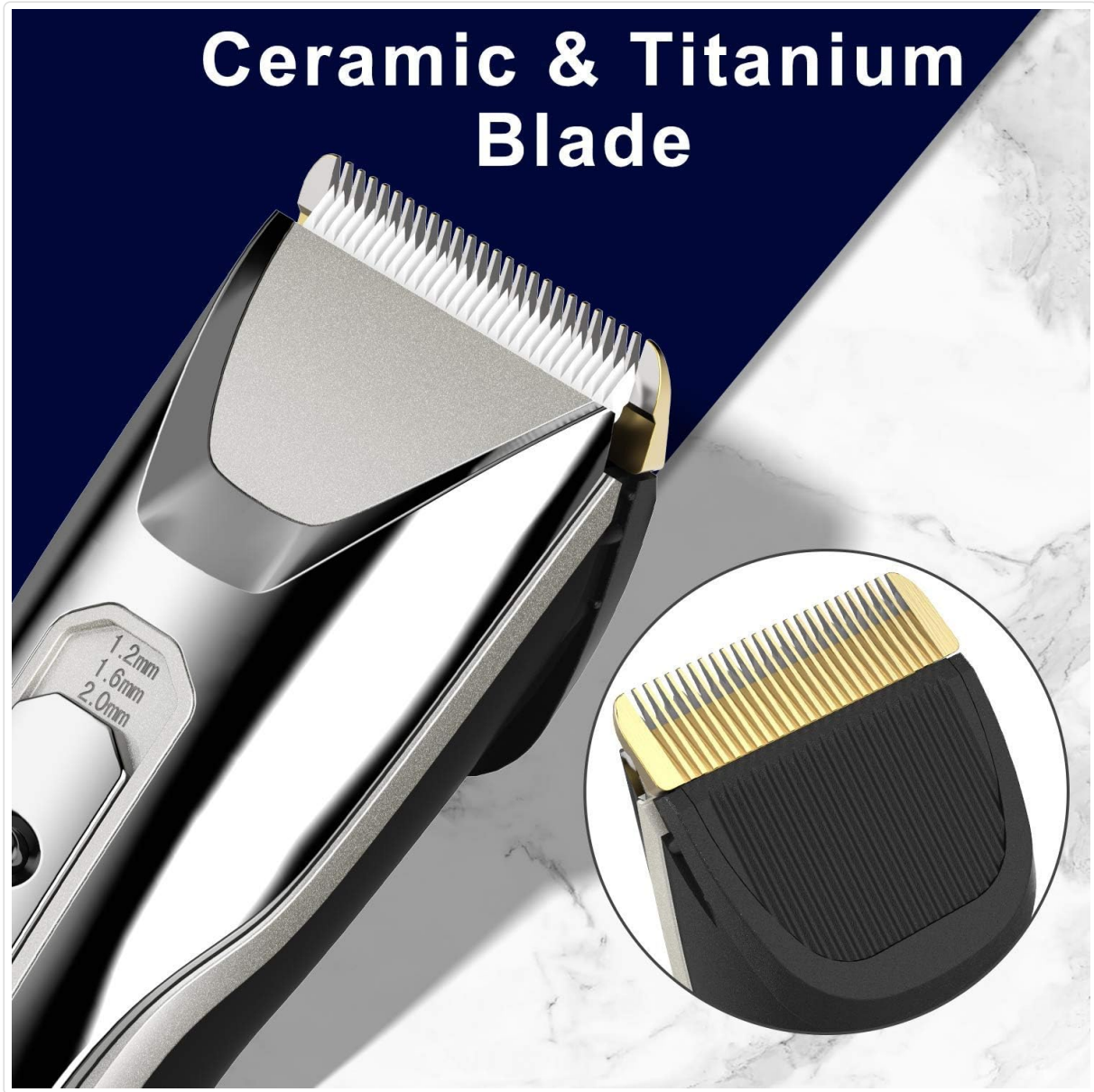
Image: Detailed view of the ceramic and titanium blade assembly on the Paubea K18MHC hair clipper.