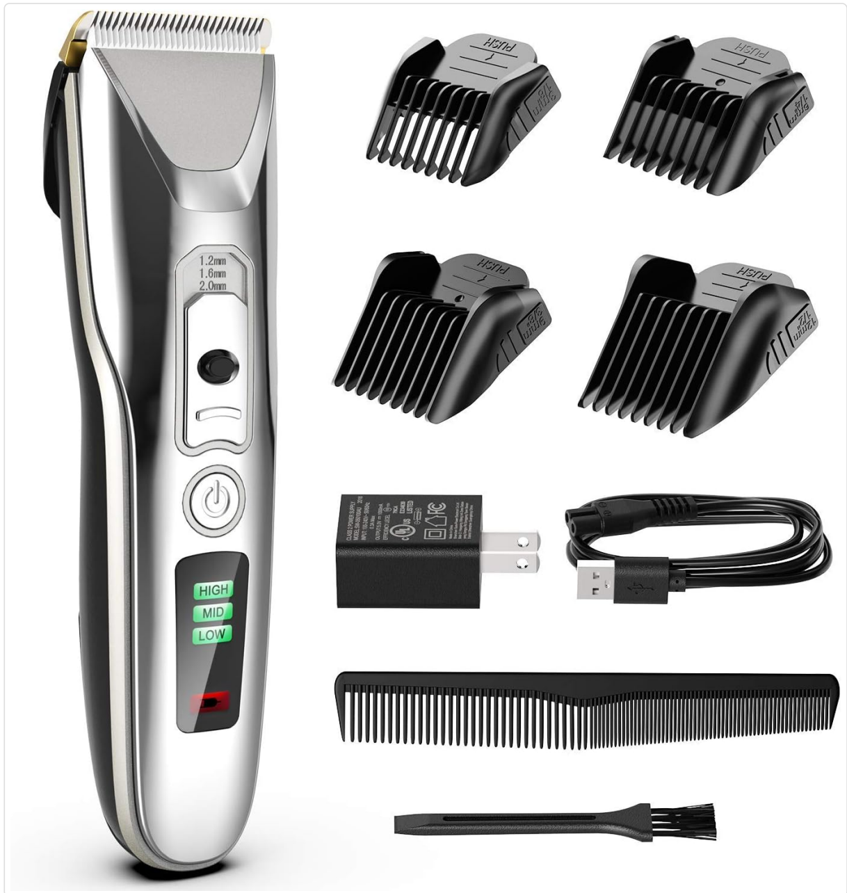
Image: Contents of the Paubea K18MHC Hair Clippers package, including the clipper, four guide combs, charging cable, power adapter, cleaning brush, and comb.