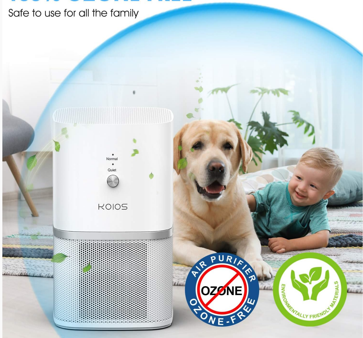
Image: The KOIOS Air Purifier is certified 100% Ozone-Free, making it safe for households with children and pets.