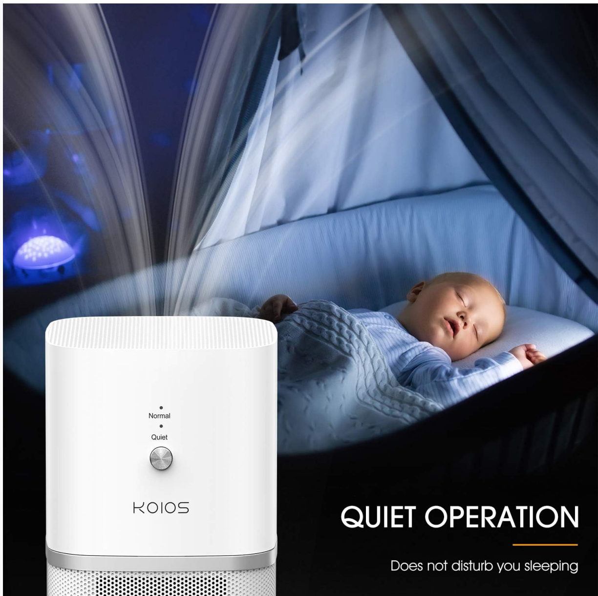
Image: The air purifier operating in quiet mode, suitable for bedrooms and nurseries.