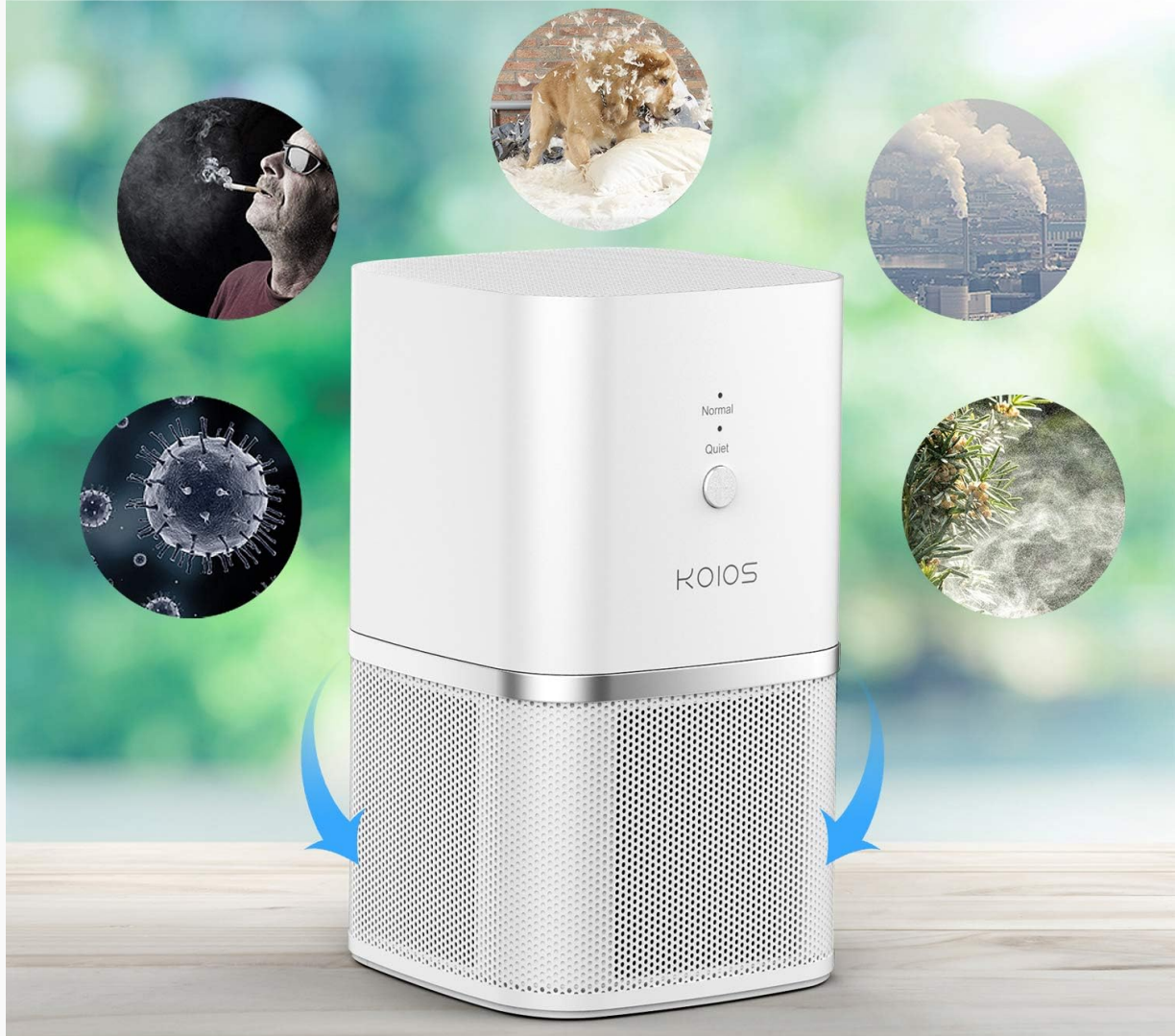
Image: Front view of the KOIOS Air Purifier, highlighting its compact size and simple control interface.

Removes 99.97% of dust, smoke, allergies, odors, mold spores, pollen and pet dander.