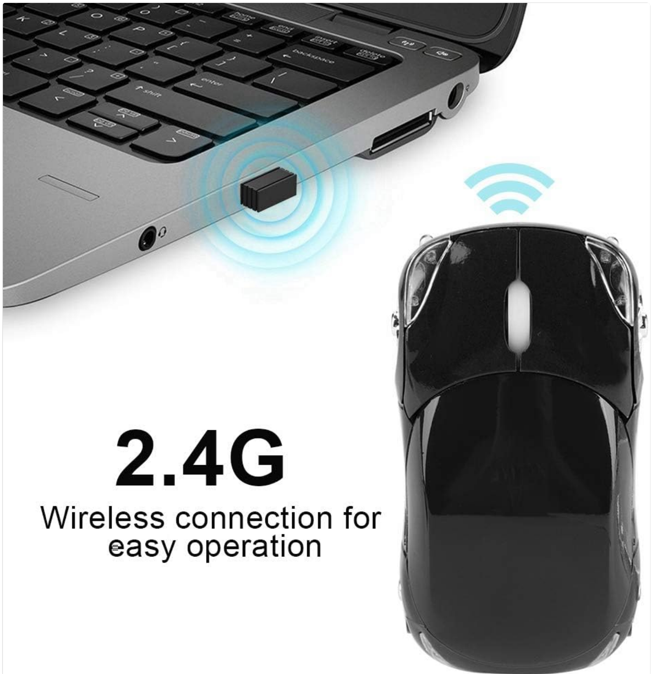
Image: The USB receiver connected to a laptop, demonstrating the 2.4G wireless connection with the car mouse.