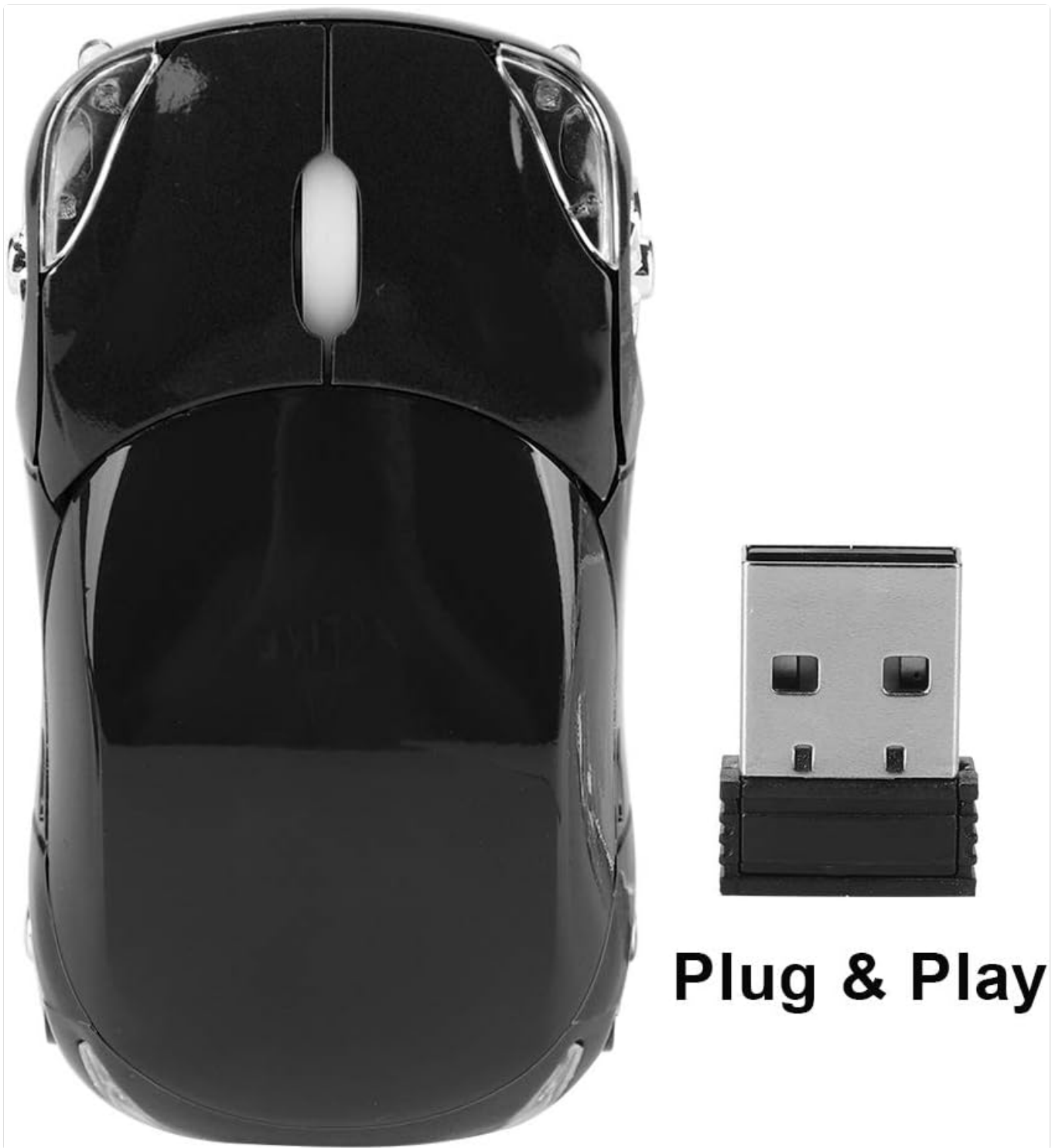
Image: A top-down view of the car mouse and its USB receiver, highlighting its plug-and-play functionality.