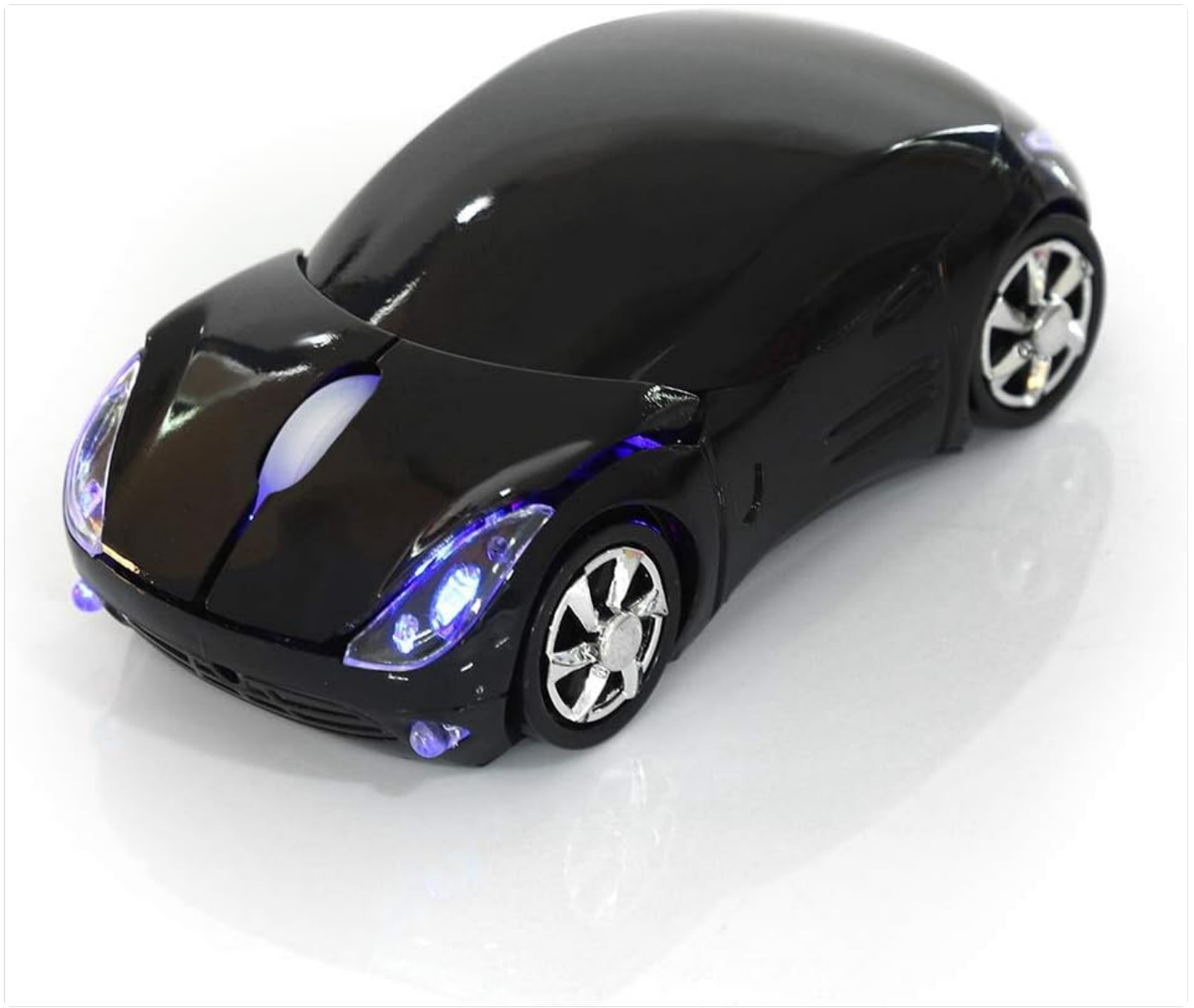
Image: The Bewinner Car Mouse in black, featuring illuminated headlights and a sleek design.