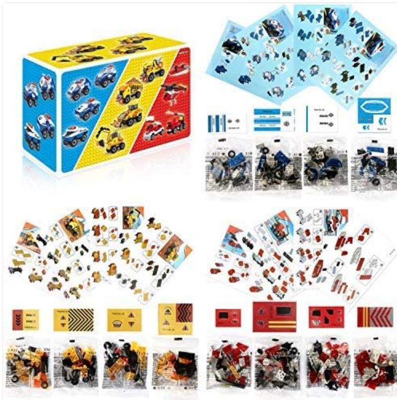
Image: The complete set contents, including the main box, individually packaged block sets, instruction manuals, and sticker sheets.