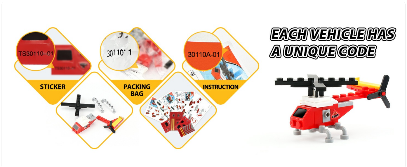
Image: An illustration detailing the unique code system used to identify corresponding stickers, packing bags, and instruction manuals for each individual vehicle.

Your browser does not support the video tag.