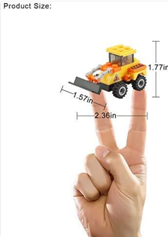
Image: A mini building block vehicle displayed on a finger, providing a visual reference for its compact size and approximate dimensions.