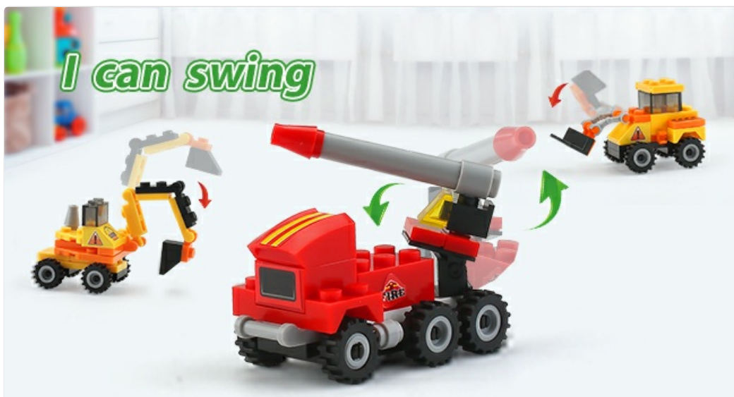
Image: A red fire truck and a yellow excavator illustrating the range of motion of their movable parts.