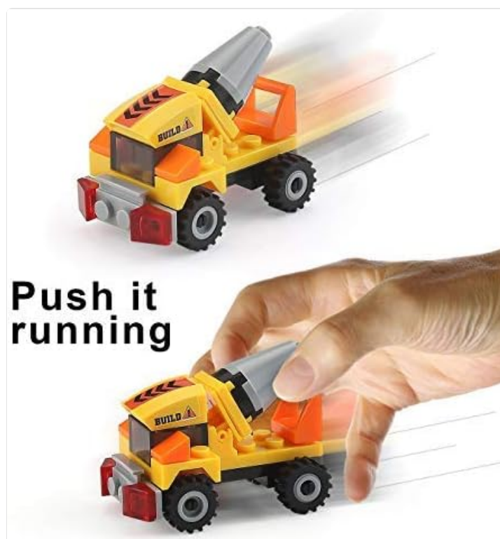
Image: A hand demonstrating the push-and-go feature of an assembled construction truck.