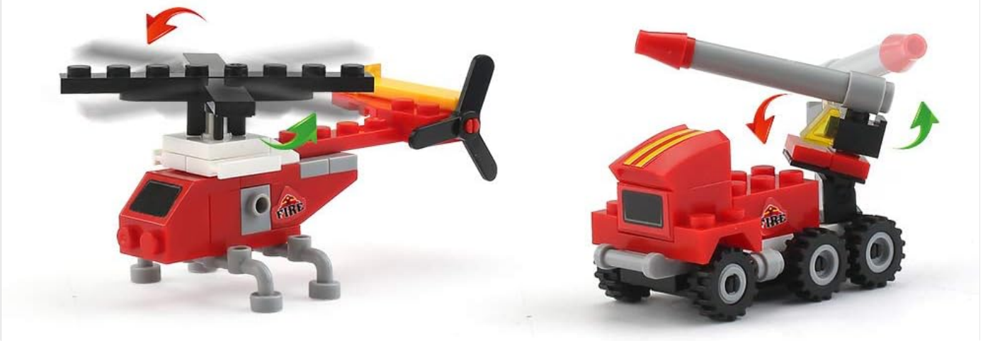
Image: Various mini-vehicles showcasing their movable components, including an excavator arm and a helicopter rotor.