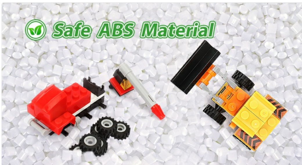
Image: A close-up view of the building blocks, highlighting their composition from safe ABS material.