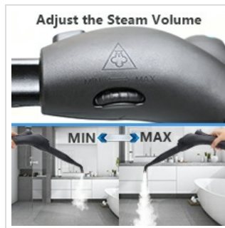
Image: A close-up of the steam cleaner's handle, showing the dial for adjusting steam volume from minimum to maximum output.