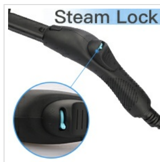
Image: A detailed view of the steam cleaner's handle, highlighting the steam lock switch for continuous steam operation.