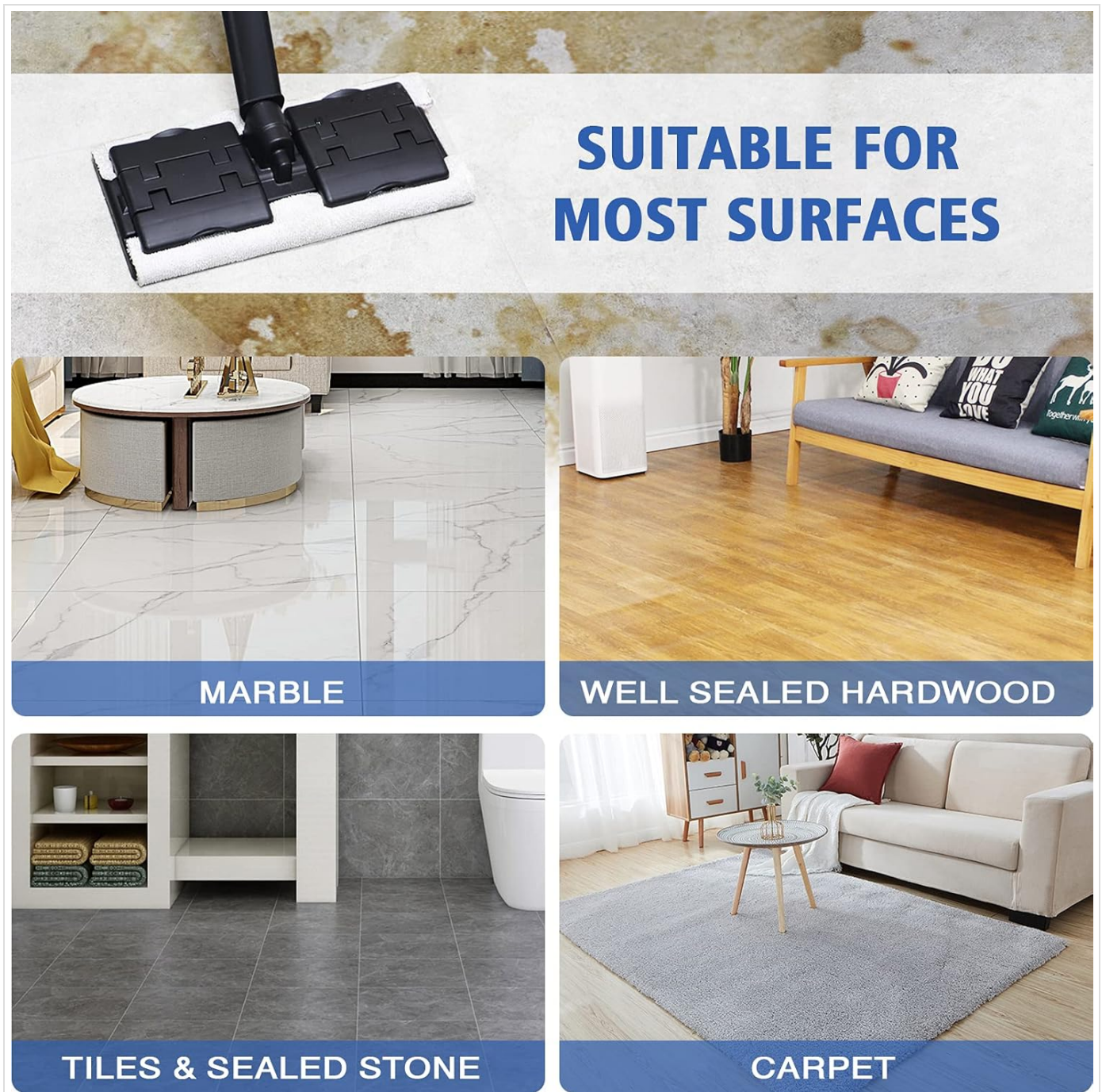
Image: A visual guide showcasing various surfaces suitable for cleaning with the MLMLANT steam cleaner, including marble, well-sealed hardwood, tiles, sealed stone, and carpet.