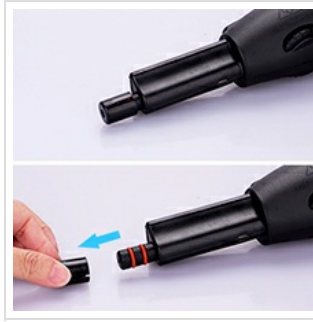
Image: A visual guide demonstrating the proper method for attaching accessories to the steam cleaner's nozzle.