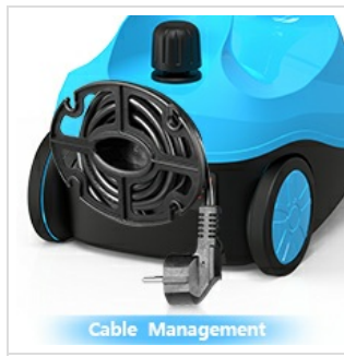
Image: A close-up view of the steam cleaner's integrated cable management system, designed for tidy storage of the power cord.