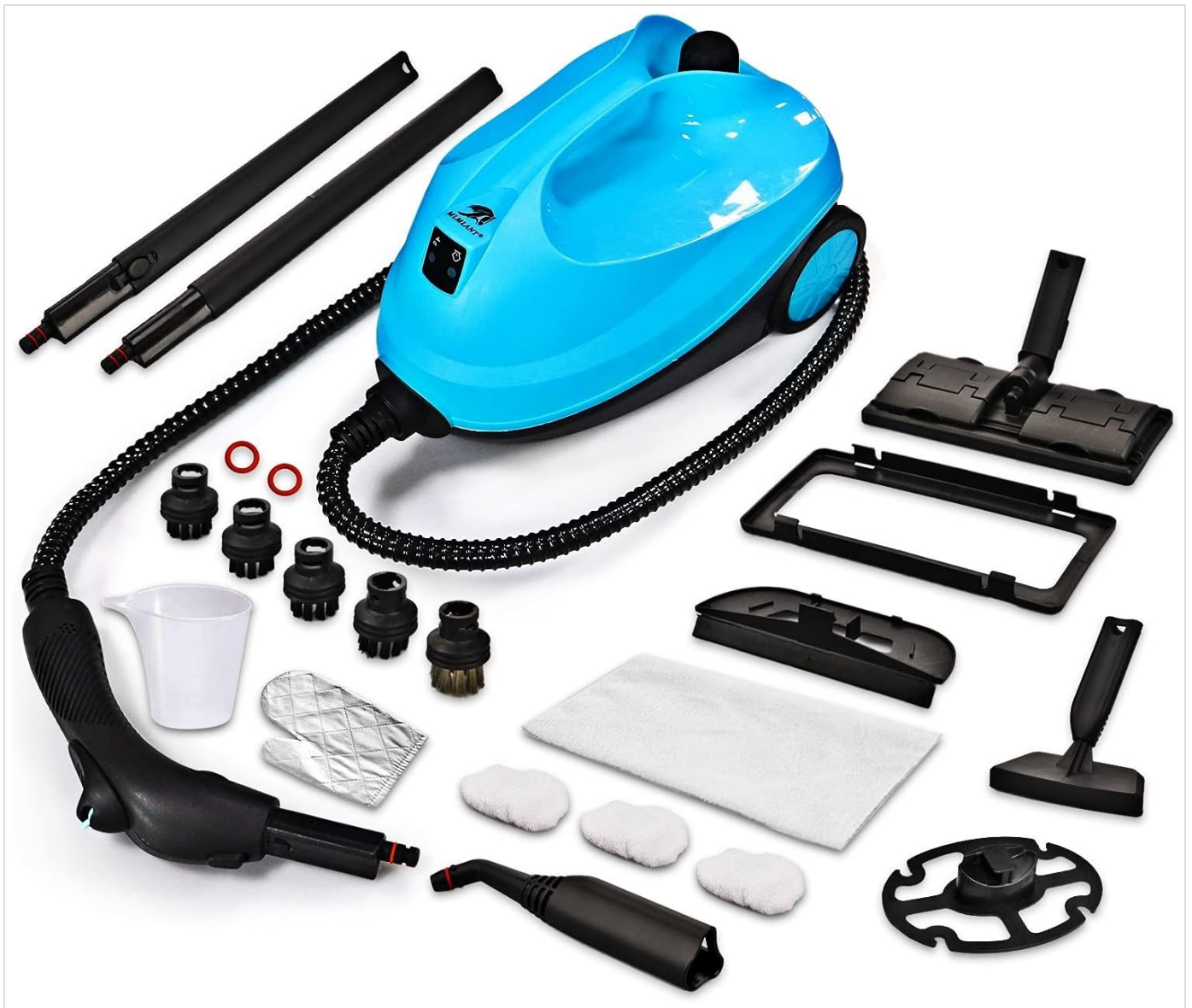
Image: The MLMLANT SC541 Steam Cleaner unit displayed with its full set of 20 accessories, including various brushes, nozzles, and cloths.