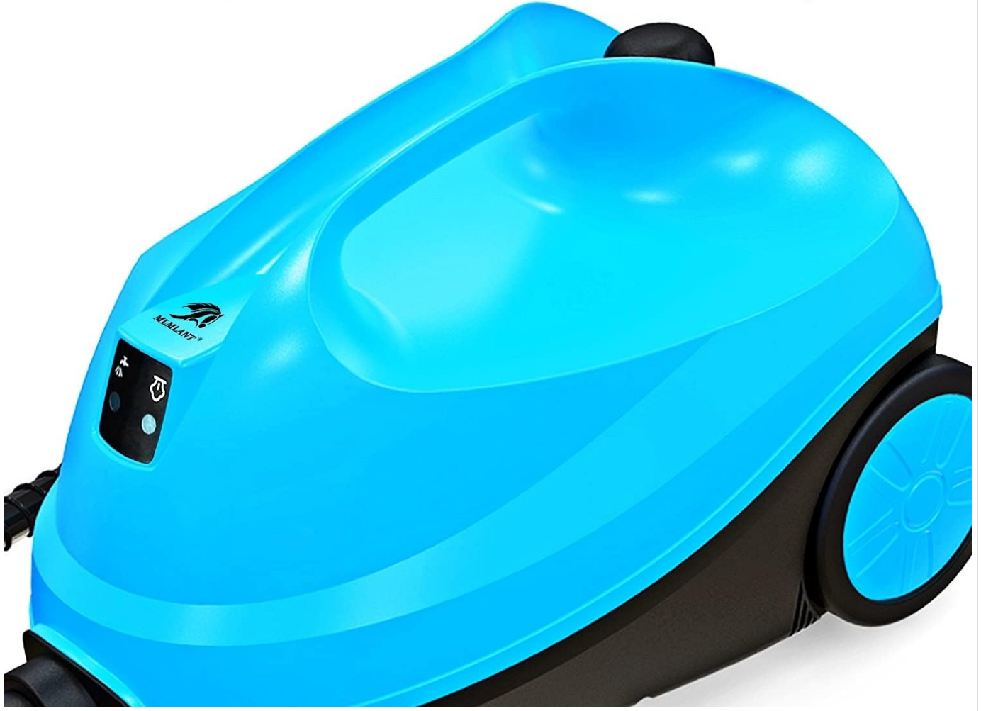
Image: A close-up view of the MLMLANT steam cleaner, emphasizing its rapid and powerful steaming capabilities with a 2000W heating system.