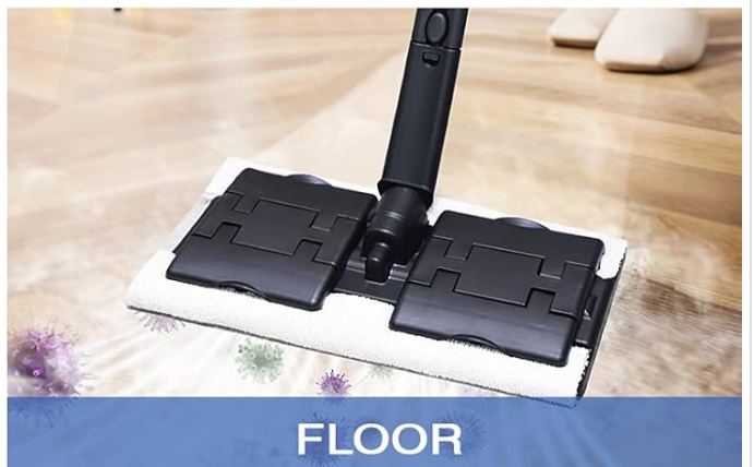
Image: A collage demonstrating the steam cleaner's effectiveness on different surfaces, including windows, carpets, stoves, couches, corners, and floors.