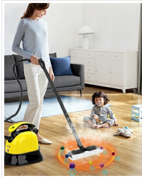
Image: A woman demonstrating the use of the MLMLANT steam cleaner on a floor, with a child playing nearby, illustrating the product's child and pet-safe cleaning capabilities.