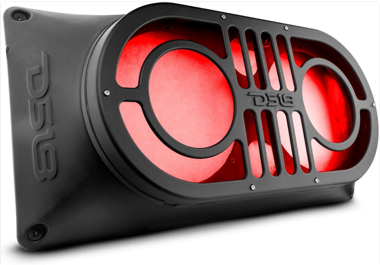
Image 1.1: The DS18 JMID speaker enclosure, showcasing its design with red illuminated speakers, intended for tailgate mounting.