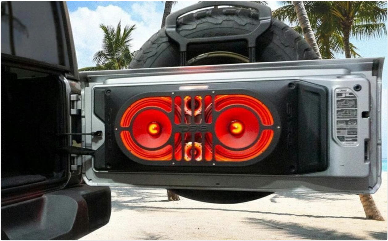
Image 5.1: Detailed view of the speaker and tweeter mounting points within the DS18 JMID enclosure.