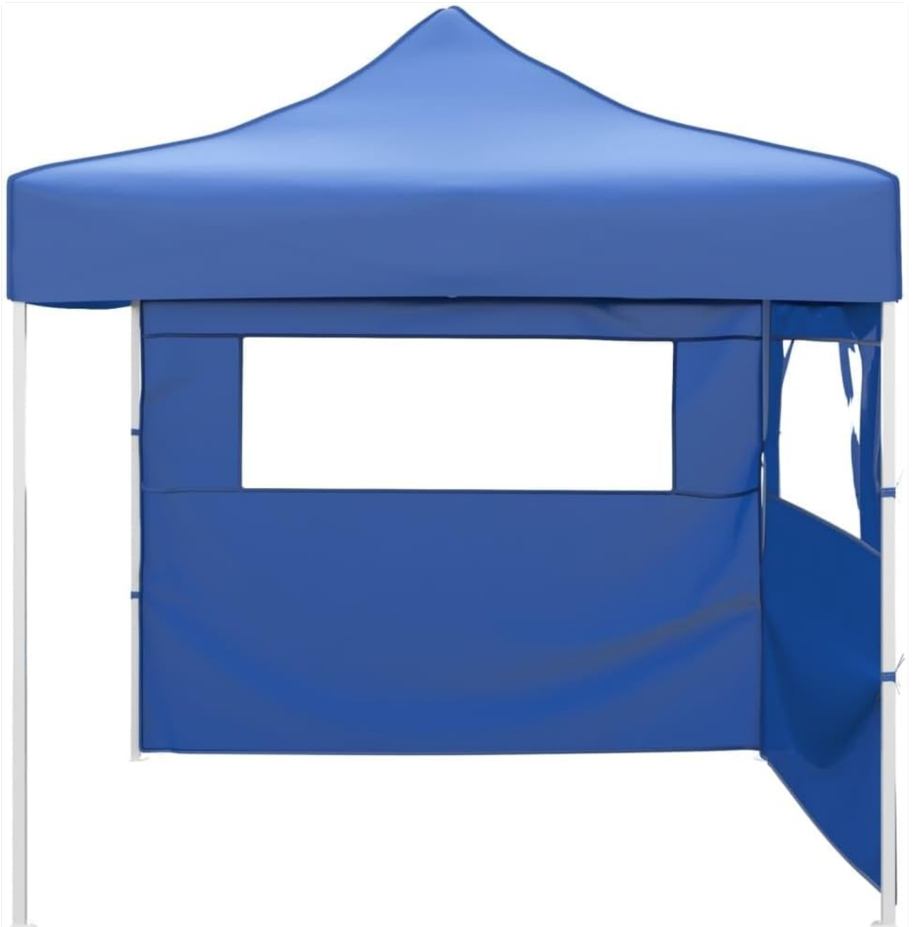
Image 5: The tent with one sidewall attached, demonstrating its appearance and function.