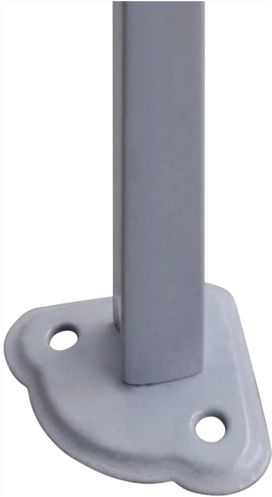
Image 6: Detail of a tent leg foot plate, designed for secure ground anchoring.