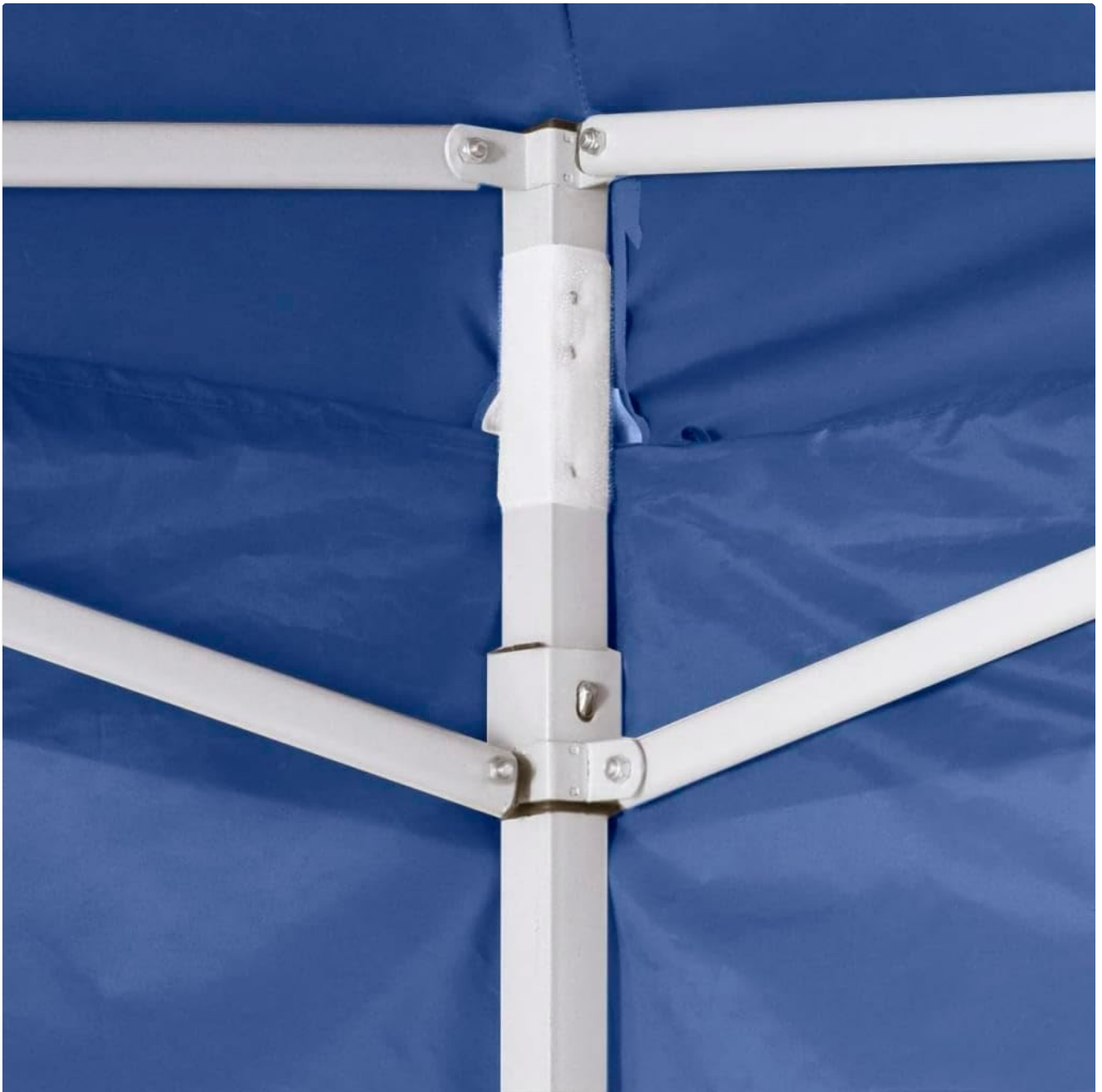
Image 2: Detail of a frame connection point, showing the secure bolt and joint.