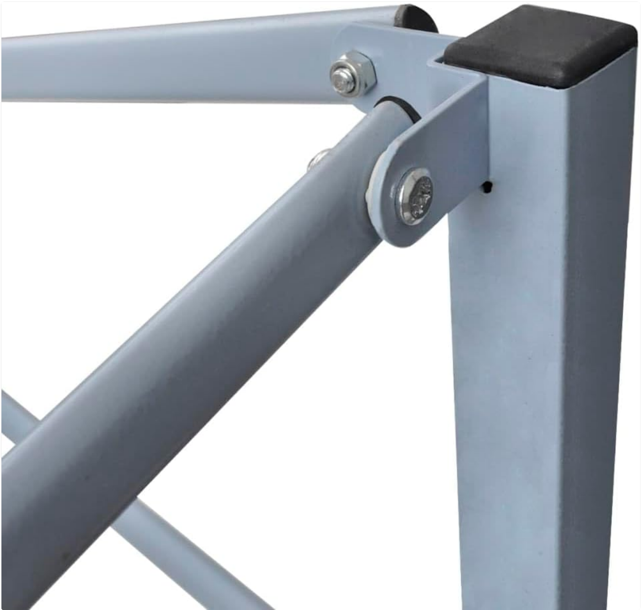
Image 3: Detail of a tent frame corner joint, illustrating the robust construction.