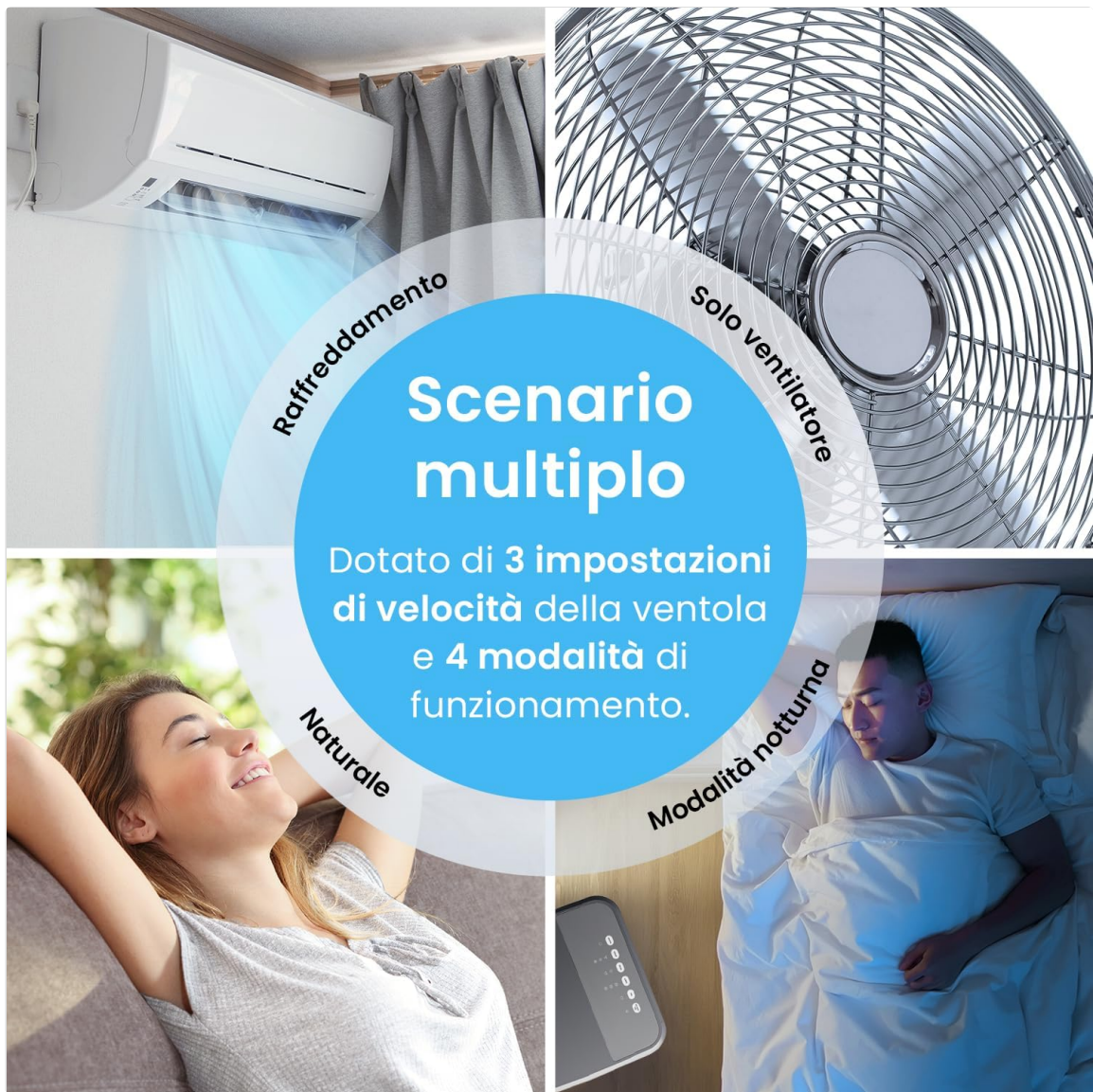
Image: A collage showing the four operating modes: Cooling (air conditioner), Fan Only (metal fan), Natural (person relaxing), and Night Mode (person sleeping). This highlights the versatility of the unit.