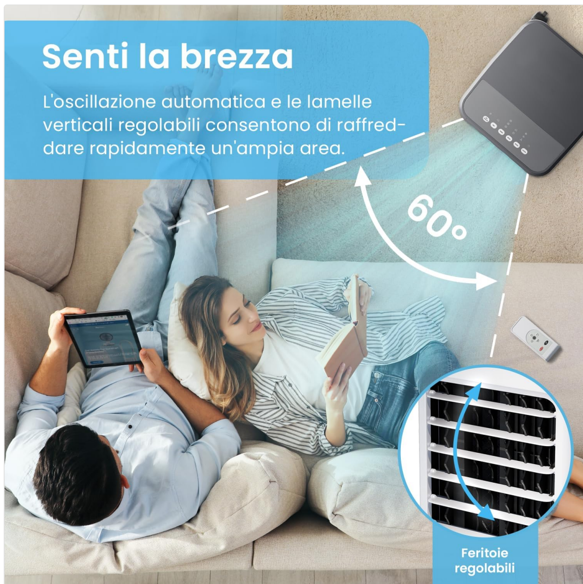
Image: Two people relaxing on a sofa with the air cooler in the foreground, illustrating the 60-degree automatic oscillation feature. An inset shows the adjustable vertical louvers for manual airflow direction.