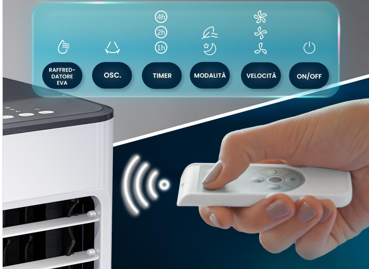
Image: A close-up of the air cooler's LED control panel with various function icons (Cooler, Oscillation, Timer, Mode, Speed, On/Off) and a hand holding the remote control, indicating wireless operation.

Programmate il raffreddatore ad aria a distanza utilizzando il telecomando o il pannello a sfioramento di facile utilizzo.