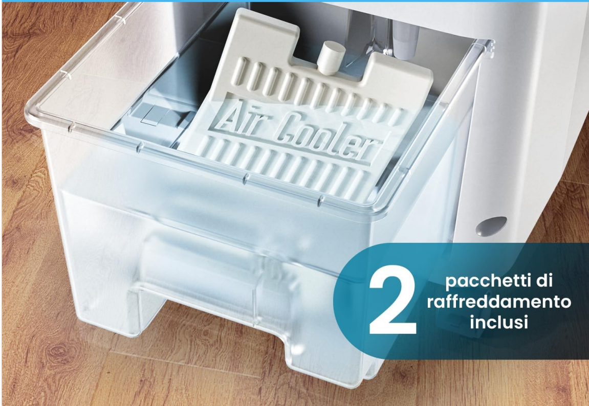
Image: A close-up view of the removable water tank with two "Air Cooler" branded ice packs inside, demonstrating how to add them for enhanced cooling.

Riempite il serbatoio d'acqua rimovibile con acqua fredda e pacchetti di raffreddamento per mantenere il vostro spazio al fresco più a lungo.