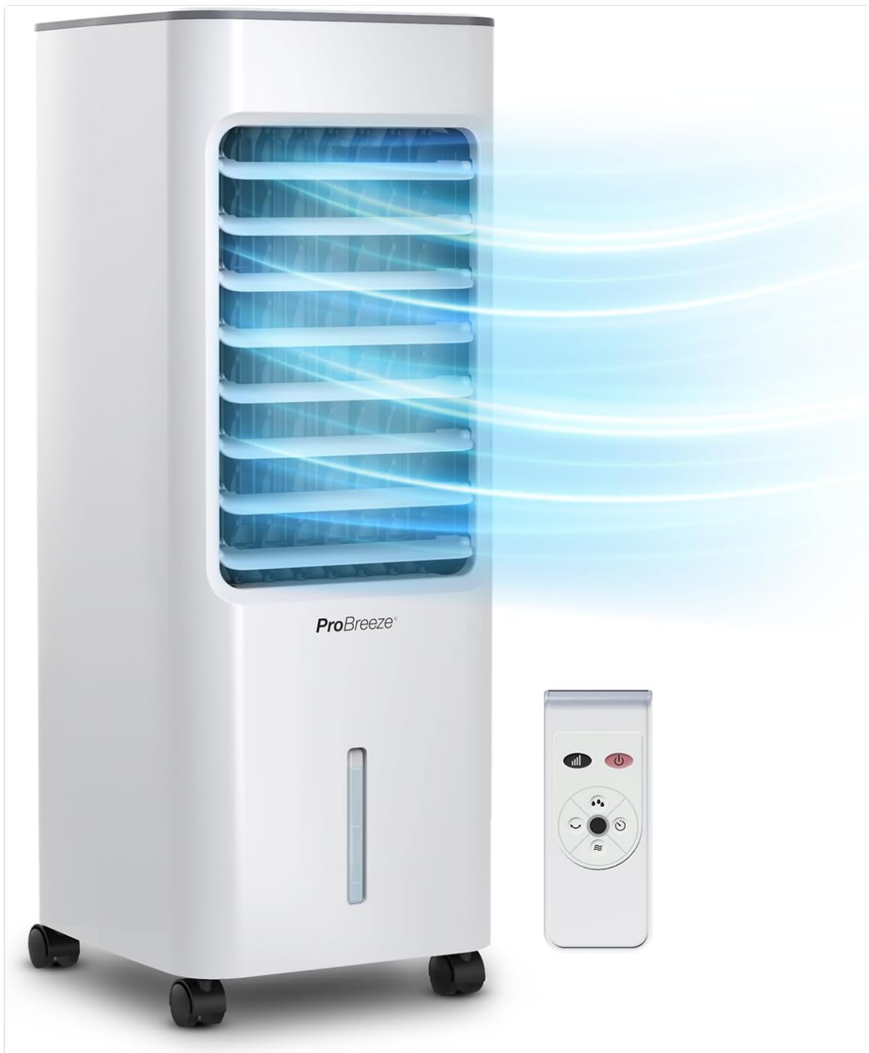
Image: The Pro Breeze 5L Evaporative Air Cooler, a tall white unit with a front grille, shown next to its remote control.