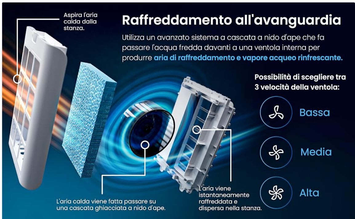
Image: An exploded view diagram of the air cooler's internal components, illustrating how warm air is drawn in, passes over a honeycomb ice cascade, and is then cooled and dispersed. It also shows the three fan speed options: Low, Medium, and High.