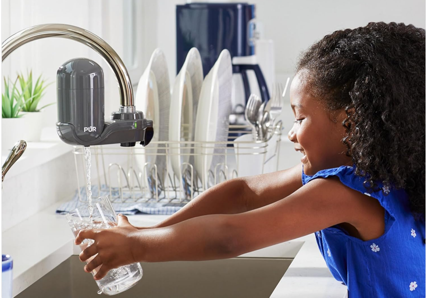
Image: A genuine PUR filter, emphasizing the importance of using authentic replacement filters for optimal performance.

Enjoy cleaner, better-tasting water, right from your tap.