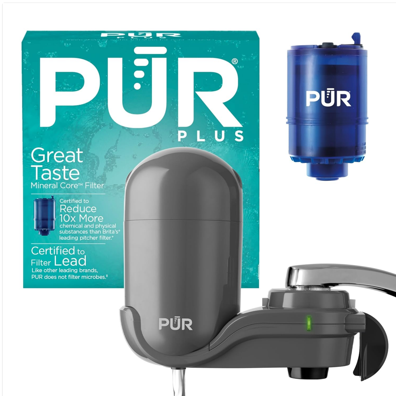
Image: The PUR PLUS Vertical Faucet Mount Water Filtration System, including the faucet unit and a replacement filter box.