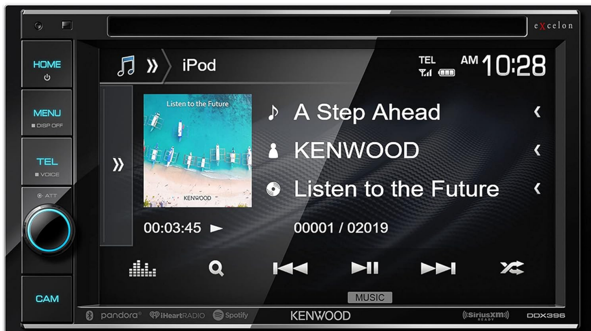
Figure 4.1: Display showing iPod audio playback interface with album art and track information.

Connect your iPod or USB storage device to the unit's USB input. The unit will detect the device and allow you to browse and play audio files. On-screen controls will be available for navigation and playback.