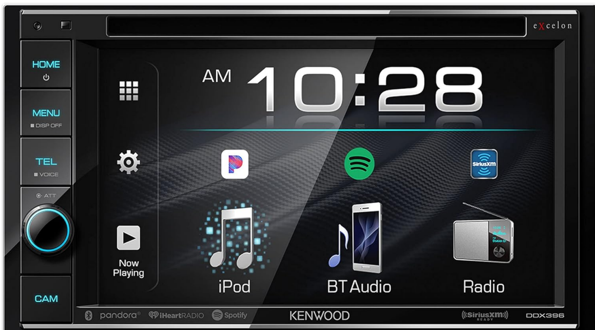
Figure 1.1: Front view of the Kenwood DDX396 display showing various application icons.