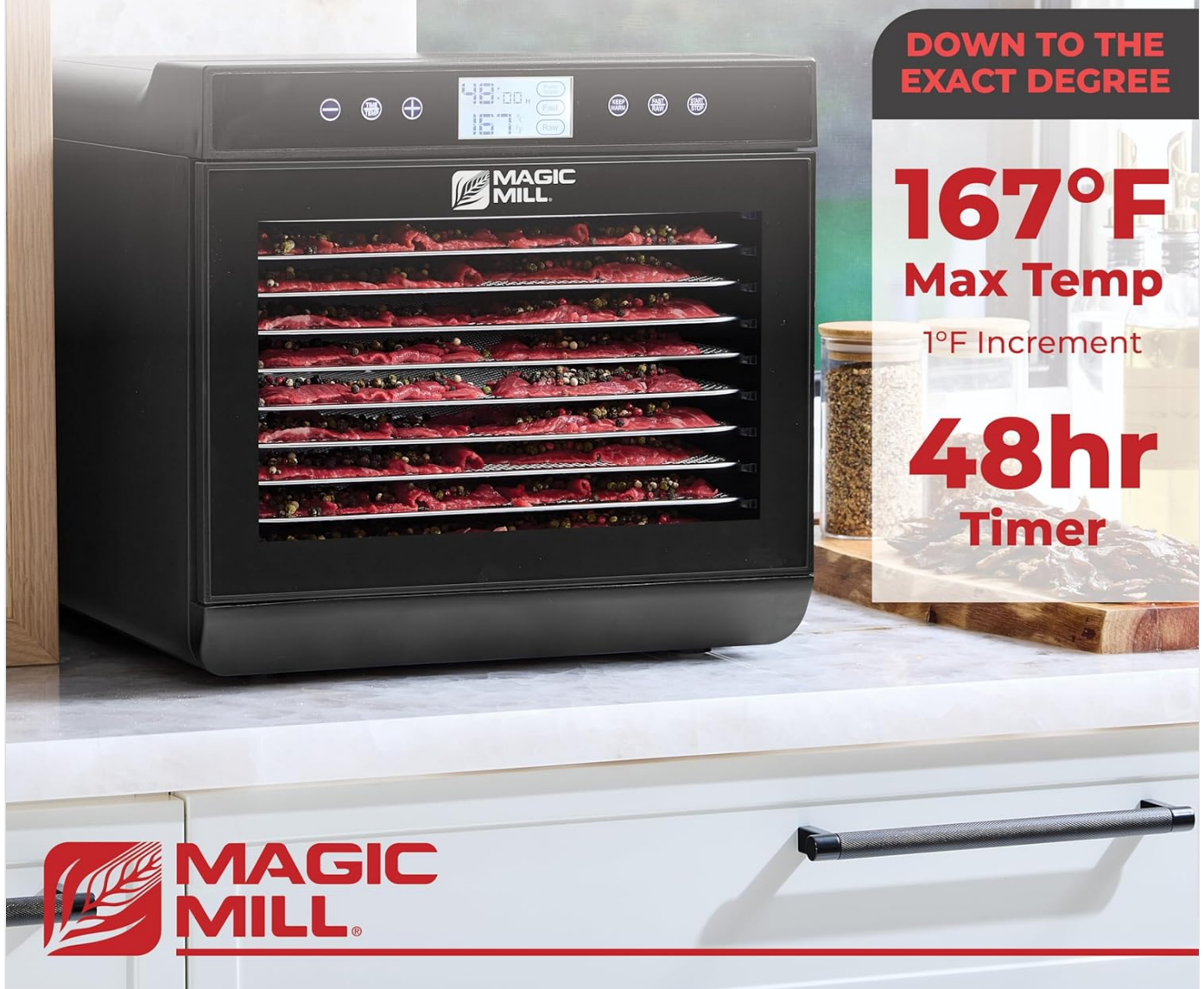
Figure 4.1: Digital control panel displaying temperature and timer settings.

Powerful Machine for Protein-Packed, Chewy Jerky