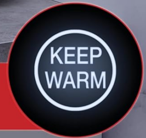
Figure 4.3: Dehydrator operating quietly with the "Keep Warm" function indicator.

Will keep your food warm after the drying process for additional 24 hours on 95°F