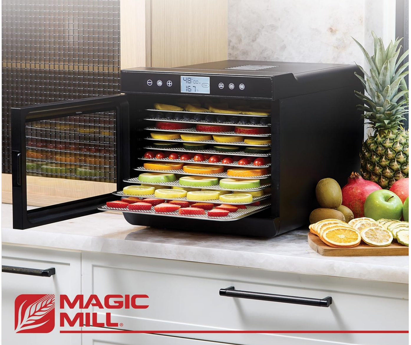
Figure 3.2: The dehydrator with its door open, revealing the 10 stainless steel trays.

Allows you to create endless delicious & healthy snacks.