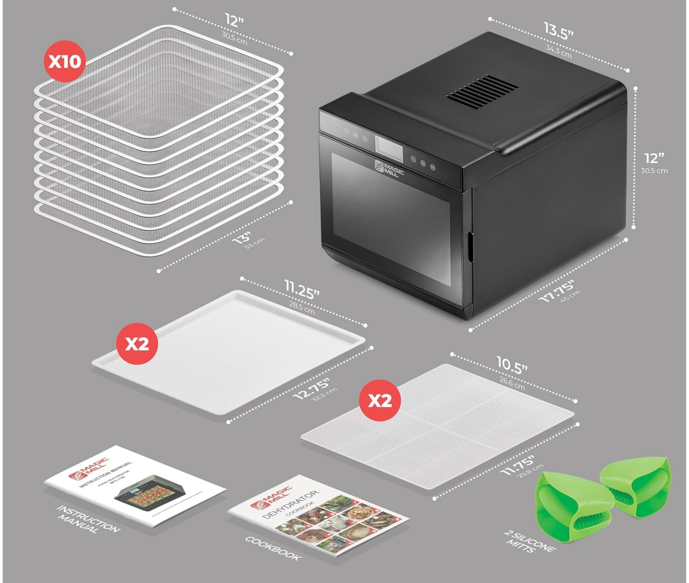
Figure 3.1: Contents included in the Magic Mill Food Dehydrator package.

This diagram illustrates the various components found inside the product box, including the main dehydrator unit, 10 stainless steel trays, 2 fruit roll trays, 2 silicone mesh trays, an instruction manual, a cookbook, and 2 silicone mitts. Dimensions of the trays and the unit are also provided.