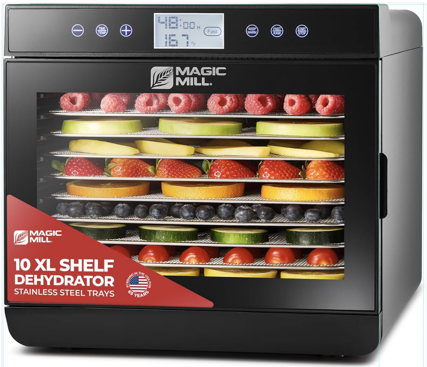
Figure 1.1: The Magic Mill Premium Food Dehydrator Machine with 10 stainless steel trays filled with various fruits.

This image displays the front view of the Magic Mill food dehydrator, showcasing its transparent door and the 10 extra-large stainless steel trays loaded with colorful fruits such as raspberries, apple slices, strawberries, blueberries, and zucchini. The digital control panel is visible at the top.