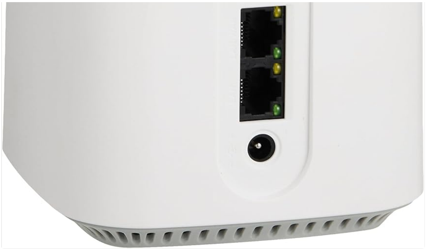
Figure 4.2: Rear view of the D-Link DWR 2000M 5G AX1800 Router, displaying the various ports including LAN, WAN, and power input.