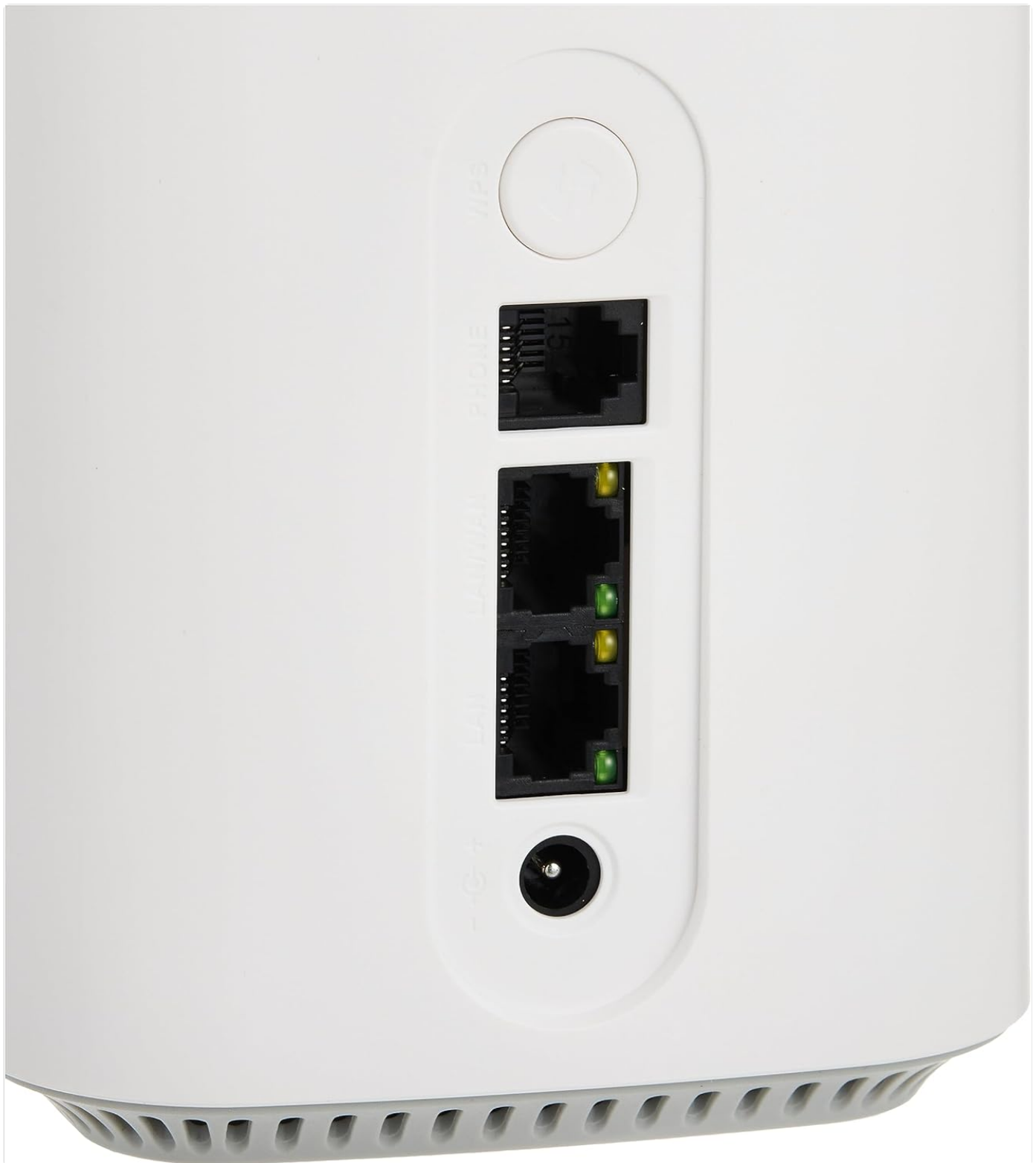
Figure 4.3: Close-up view of the rear ports on the D-Link DWR 2000M, highlighting the Ethernet LAN ports, WAN port, and the power input. Also visible are the WPS button and a reset pinhole.

The rear panel houses all the essential connectivity ports. These include multiple Gigabit Ethernet LAN ports for wired devices, a Gigabit WAN port for connecting to an external modem or fiber optic terminal, an FXS port for voice services, and a USB 3.0 port for connecting external storage or other peripherals. A WPS button is available for easy Wi-Fi Protected Setup, and a recessed reset button allows for factory default restoration.