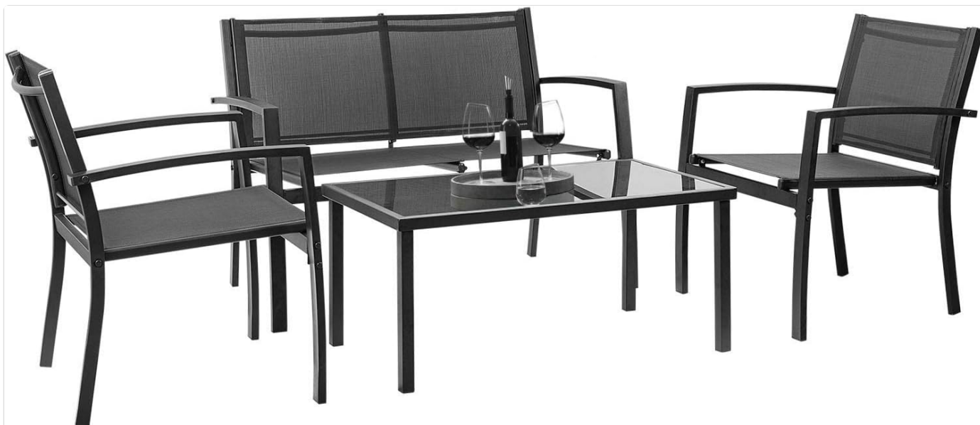
Figure 1: Complete Devoko 4-Piece Patio Furniture Set.