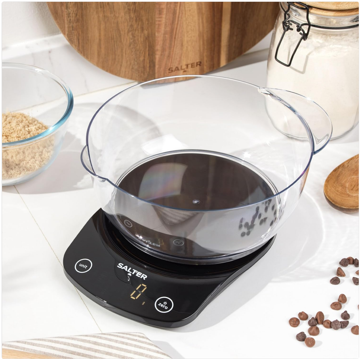
Image: The clear weighing bowl placed on the scale, ready for the tare function before adding ingredients.