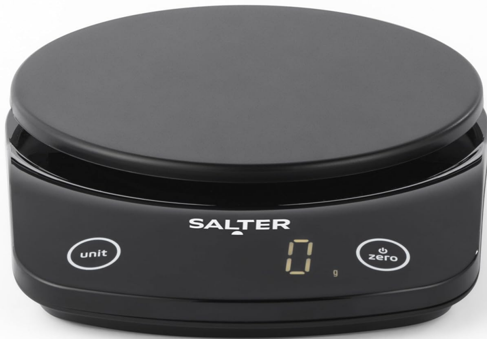
Image: The Salter 1074 BKDR scale unit without the weighing bowl, showing its compact design.