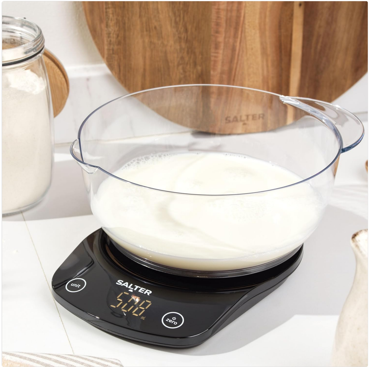
Image: The scale displaying a measurement of 508 ml, indicating milk being weighed in the clear bowl.