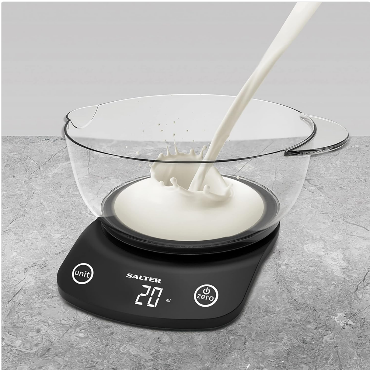
Image: Milk being poured into the weighing bowl on the scale, with the display showing an initial measurement of 20 ml.