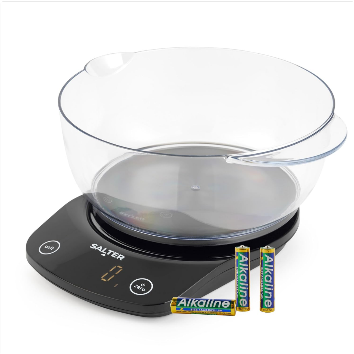
Image: The Salter 1074 BKDR kitchen scale, including the main unit, the clear weighing bowl, and three AAA batteries.