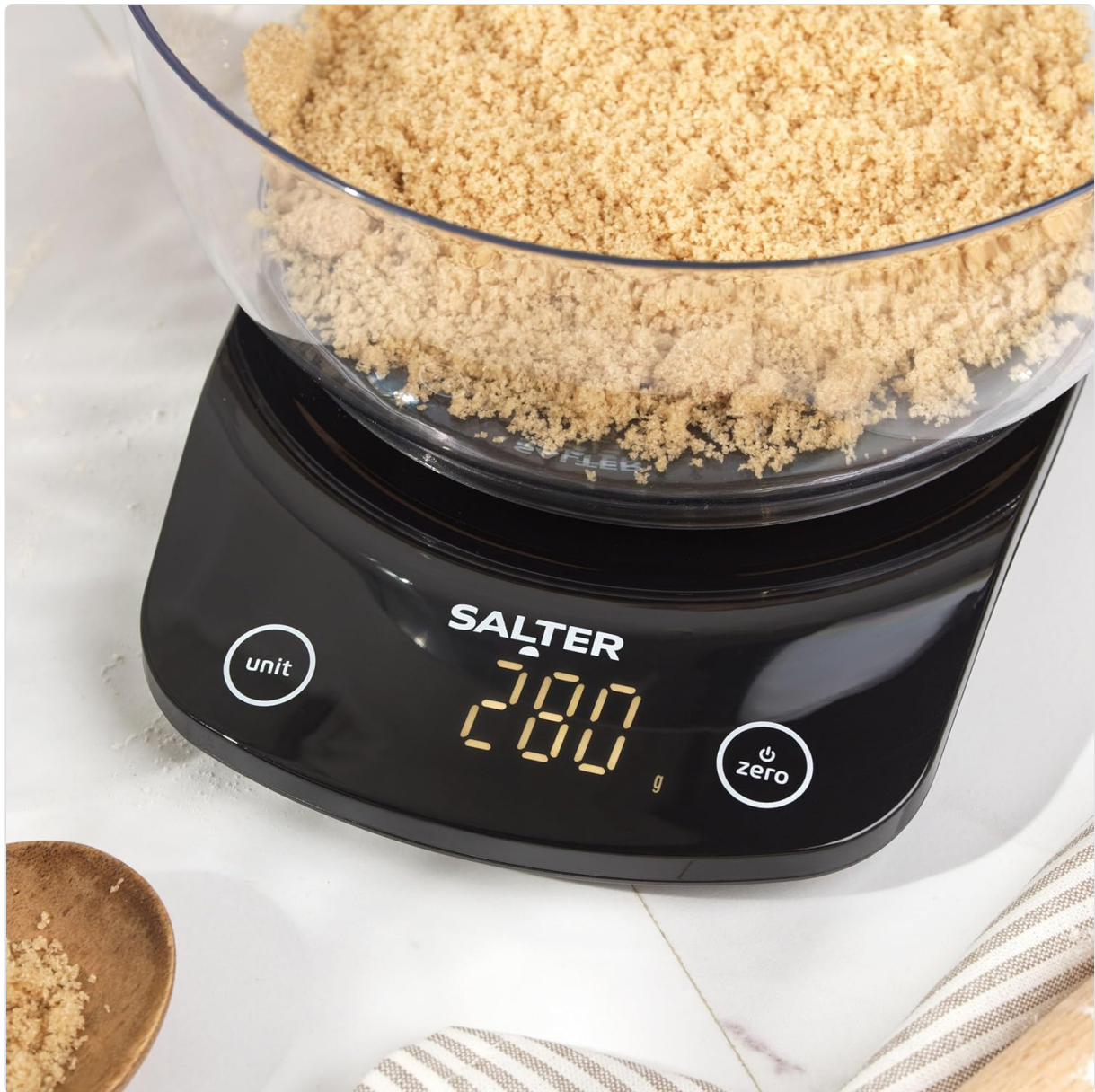
Image: A close-up view of the scale's display showing a measurement of 280 grams, with brown sugar in the bowl.