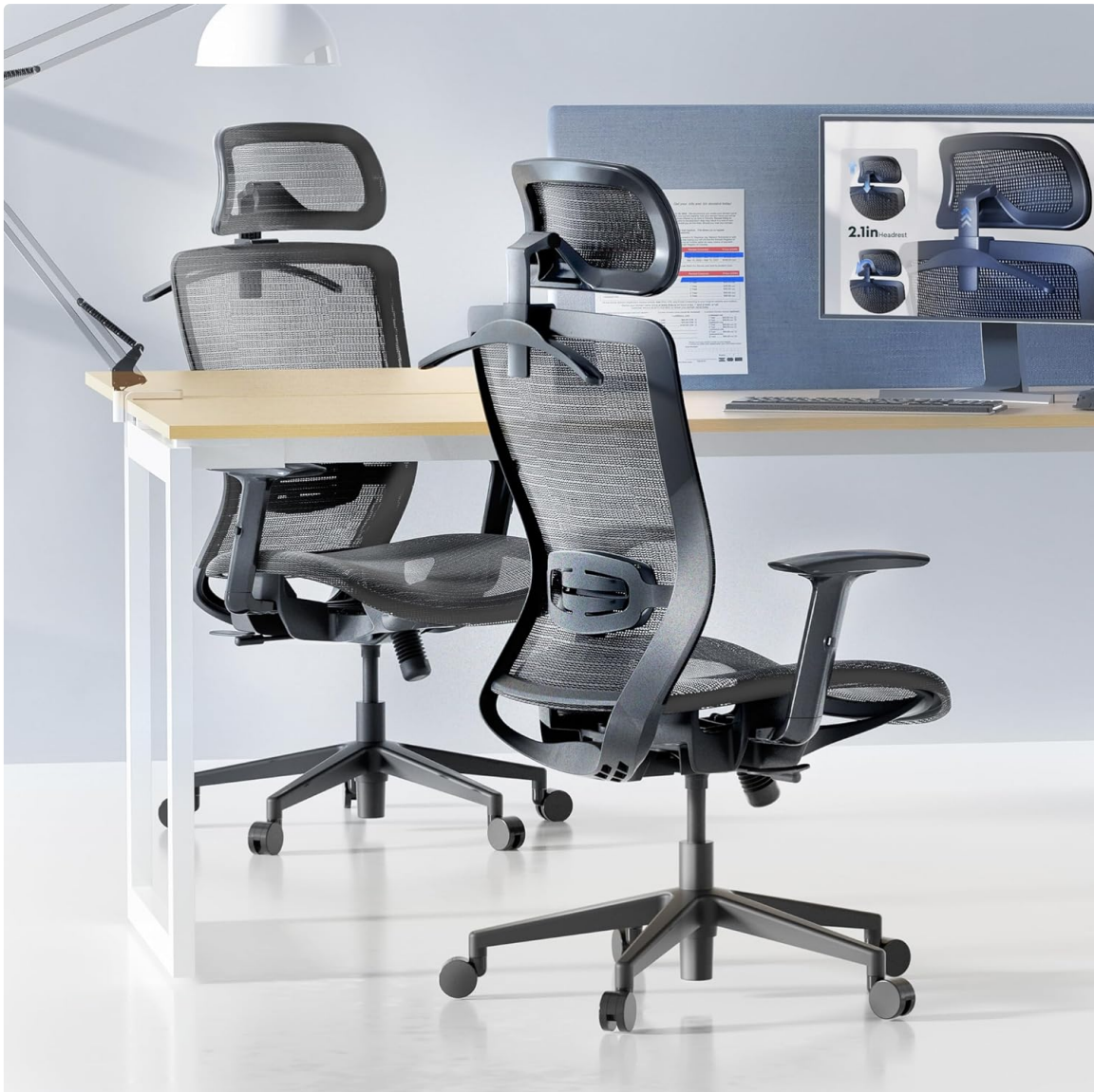
Image: Overview of chair dimensions and adjustable features.