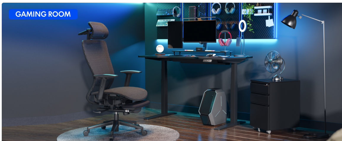
Image: Visual guide to chair adjustments.