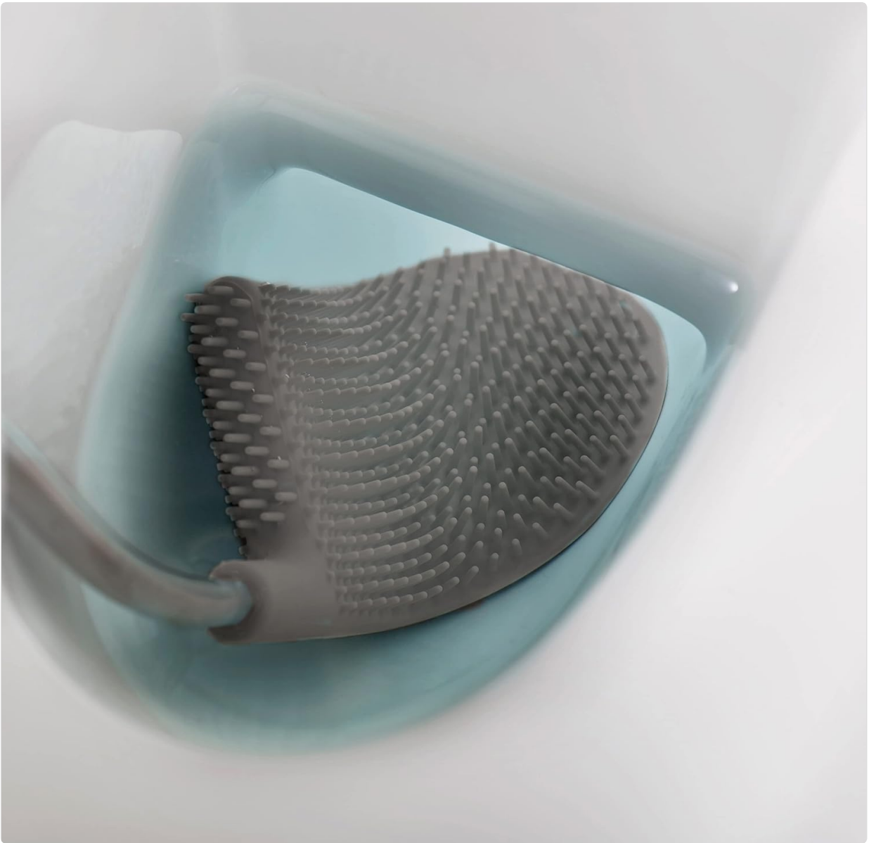
Image 4: The flexible D-shaped head easily reaches and cleans under the toilet rim.