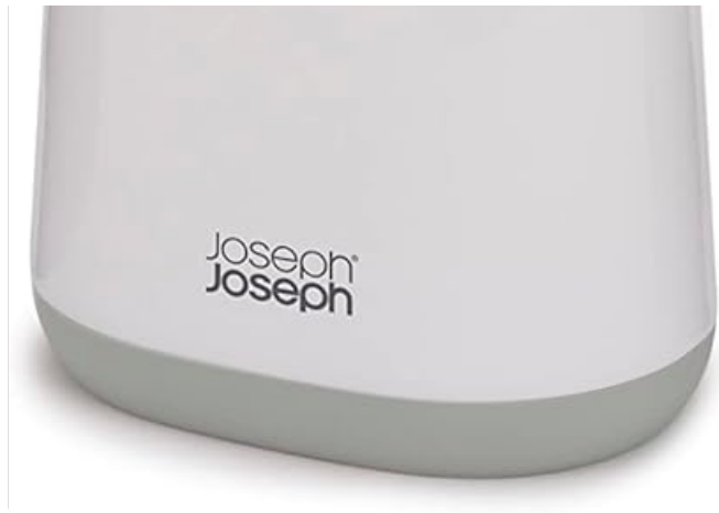
Image 2: The Flex Lite brush and holder set. No assembly is required.