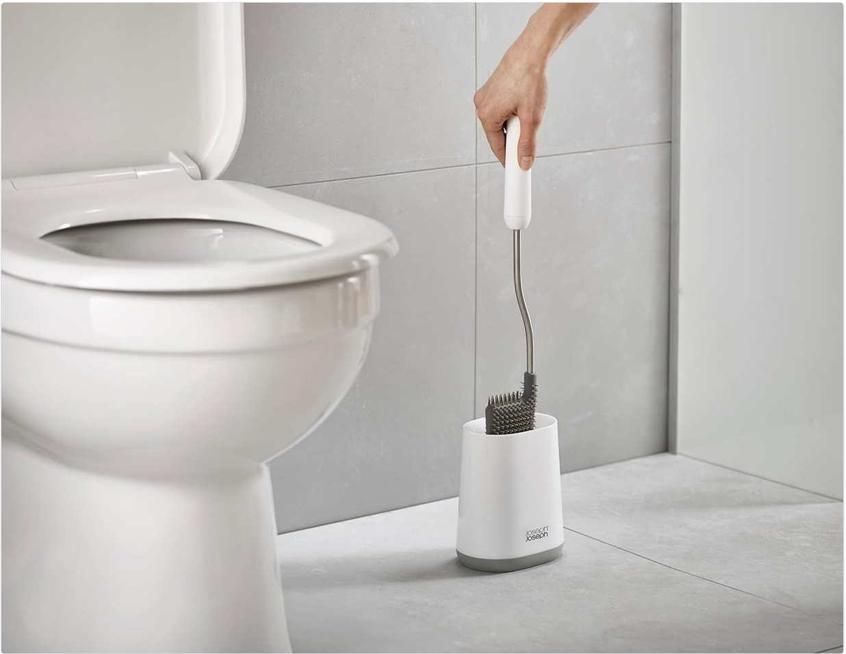
Image 3: A hand demonstrates removing the Flex Lite brush from its holder.