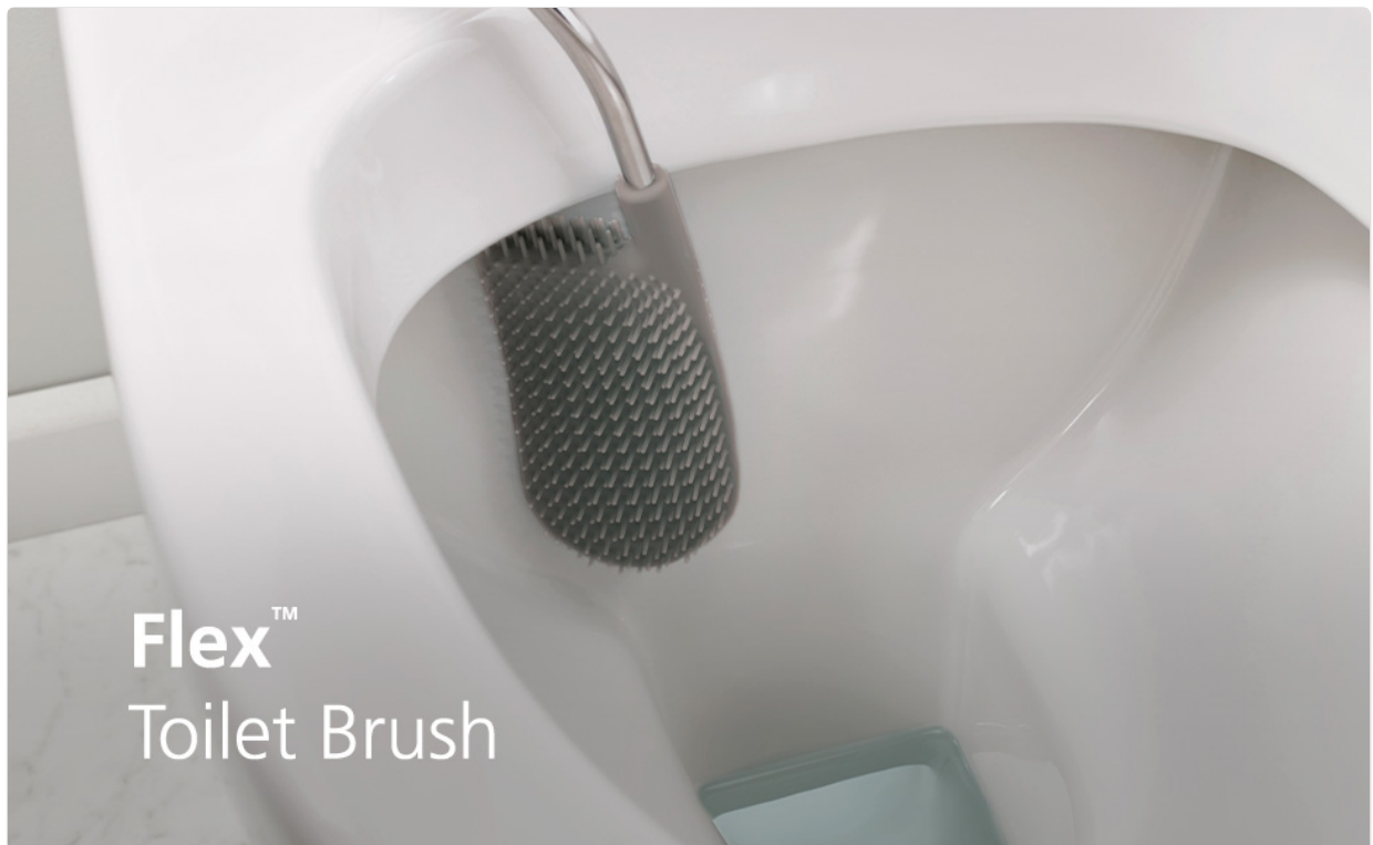
Image 1: The Joseph Joseph Flex Lite Silicone Toilet Brush with its slimline holder, ready for use.

The Joseph Joseph Flex Lite Silicone Toilet Brush is designed for effective and hygienic toilet cleaning. Its innovative D-shaped flexible head allows access to all areas of the toilet bowl, including under the rim. The water-repellent silicone material ensures quick drying and prevents dirt accumulation, offering a more hygienic alternative to traditional bristle brushes. The slimline holder provides compact and discreet storage.