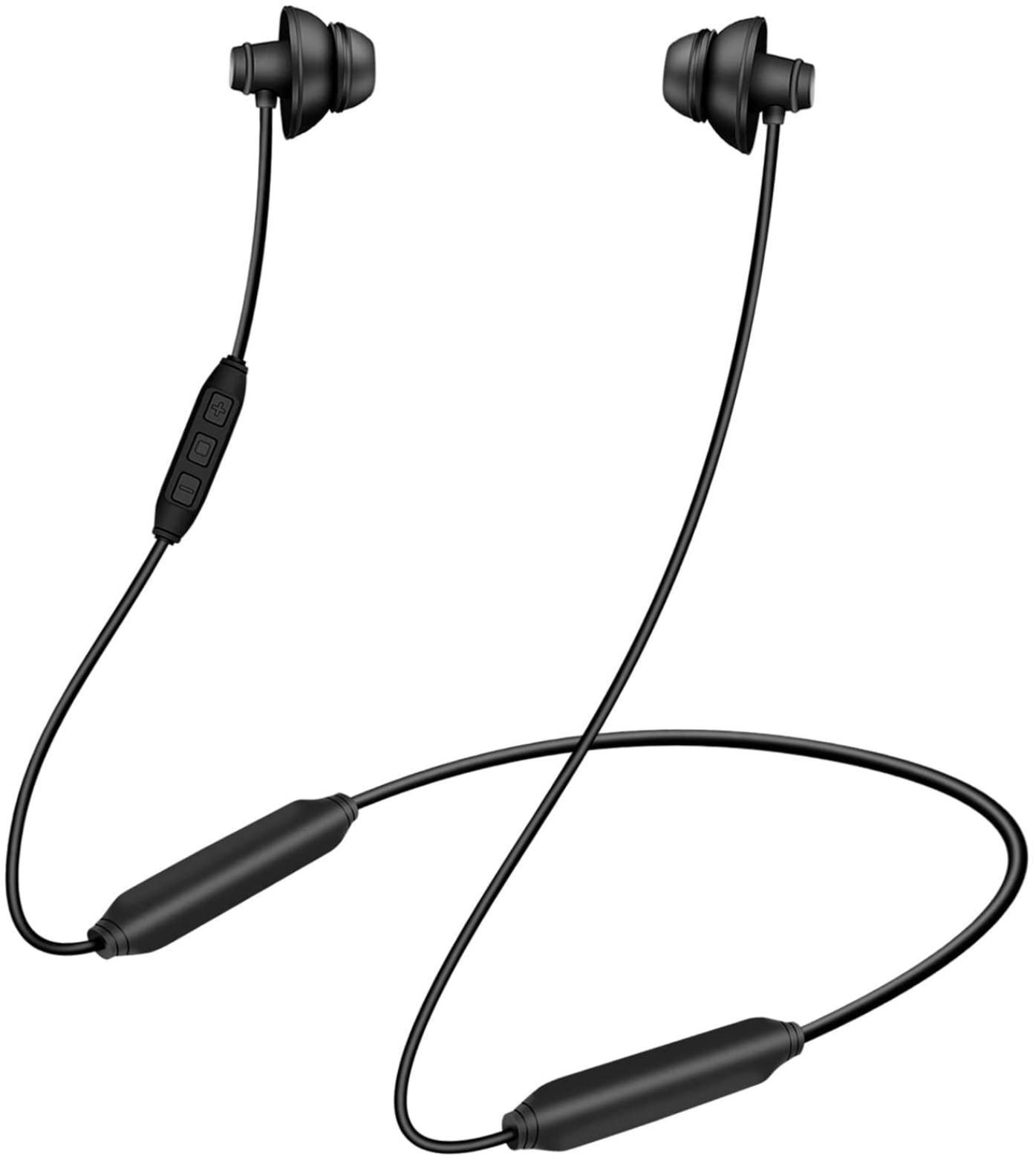
Figure 1: Goojodoq Bluetooth Sleep Headphones, showcasing the in-ear earbuds and flexible neckband.