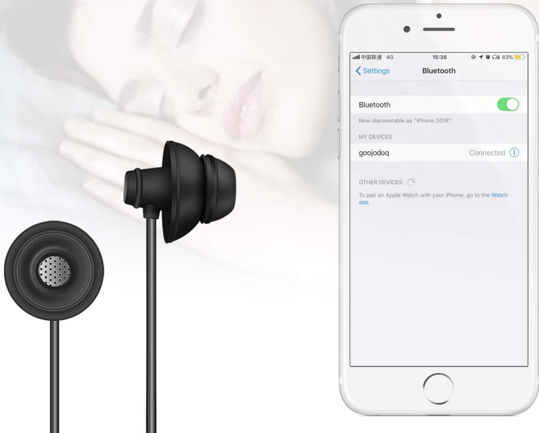
Figure 2: Example of a device's Bluetooth pairing screen, showing the "goojodoq" headphones ready for connection.

Bluetooth 4.2 enables stable connection and high-fidelity sound quality