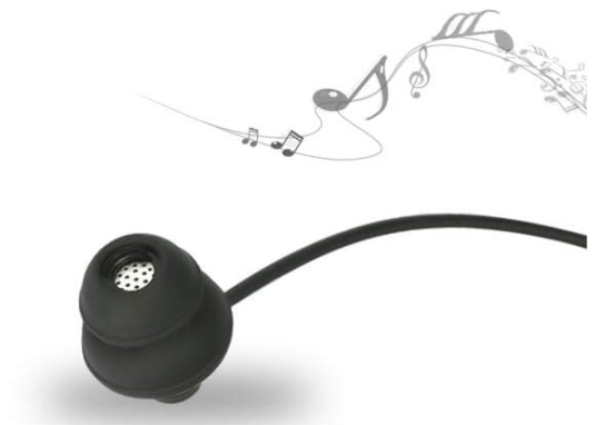
Figure 5: Image demonstrating the noise reduction capability of the in-ear earplug design, showing how it effectively blocks out external sounds.

In-ear Earplug Design Effectively Block Out Background Noise