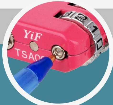
Image: A detailed view of a pink padlock, illustrating the 'Open Alert Indicator' in its activated (popped-up) state, signifying a security inspection.

4 Release the reset button to the default position.