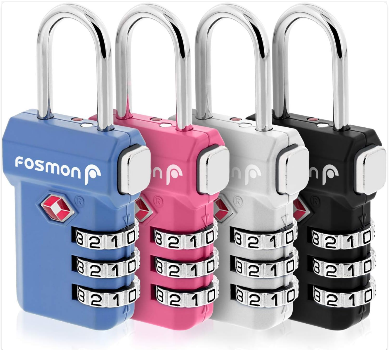
Image: A set of four Fosmon TSA travel padlocks in various colors, highlighting their compact design and combination dials.