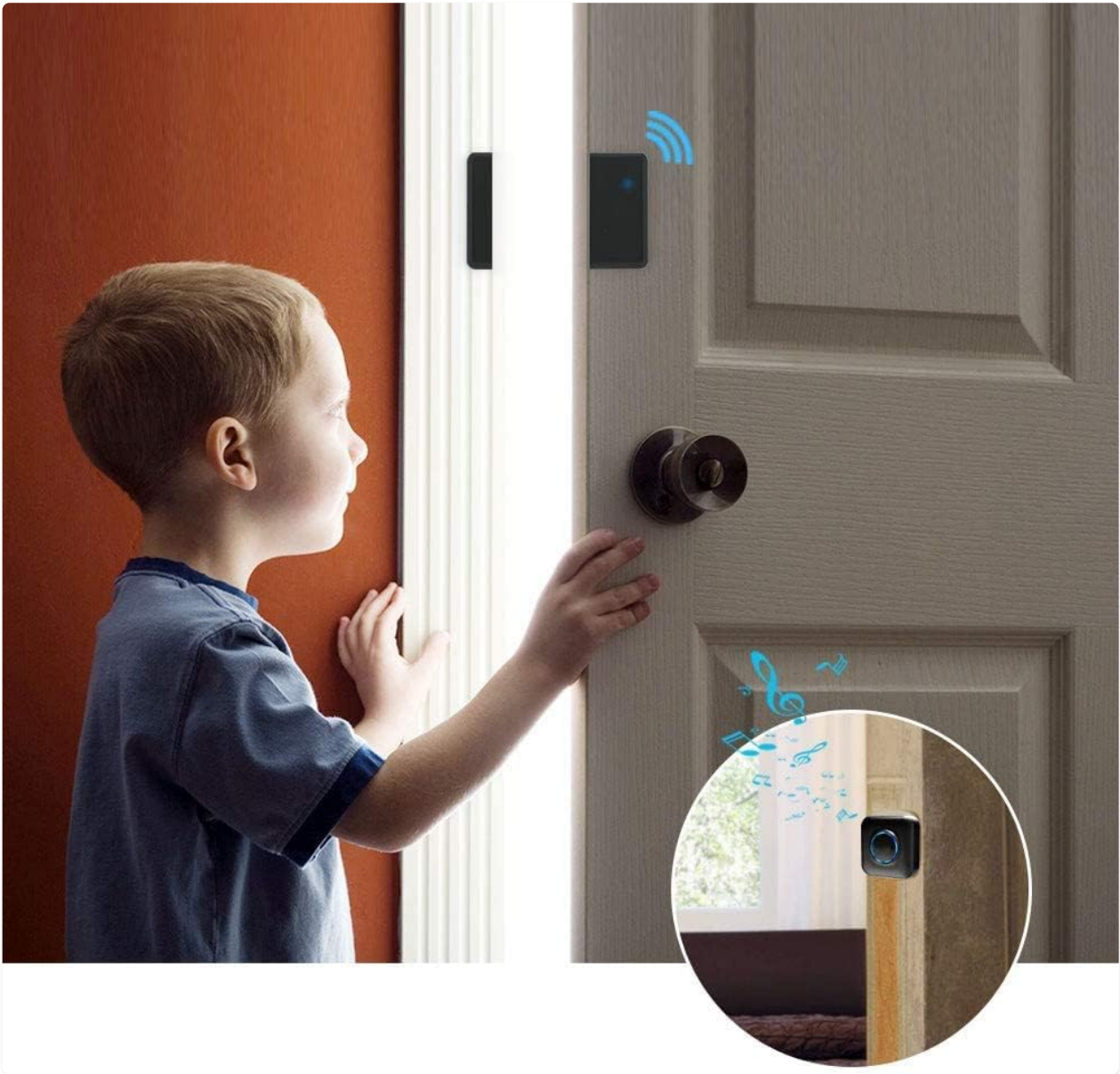
Image: Examples of where the door sensor can be used, including office environments, children's rooms, retail stores, and pet doors.