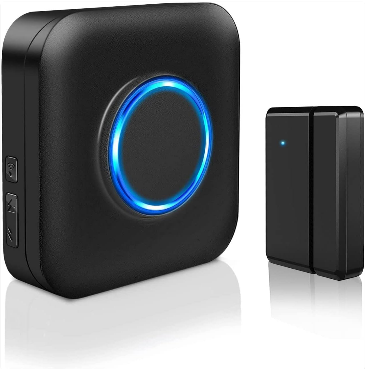
Image: The main receiver unit (left) and the magnetic sensor unit (right) of the BITIWEND Wireless Door Sensor Chime.