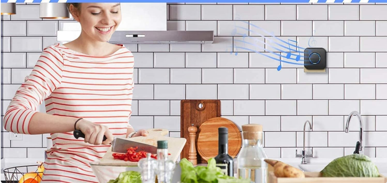
Image: The receiver unit highlights its features: 58 selectable chimes, 5 volume levels, and a volume range of 0-110dB with an LED indicator.