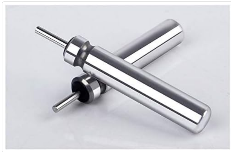
Image: A pair of Smart Kingfisher 425 rechargeable lithium batteries.