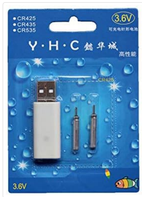
Image: Retail packaging showing the USB charger and two 425 rechargeable batteries.