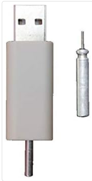
Image: The USB charger unit with its two charging pins visible.