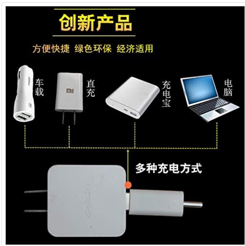
Image: Diagram illustrating multiple methods for charging the device, including car chargers, wall adapters, power banks, and laptops.