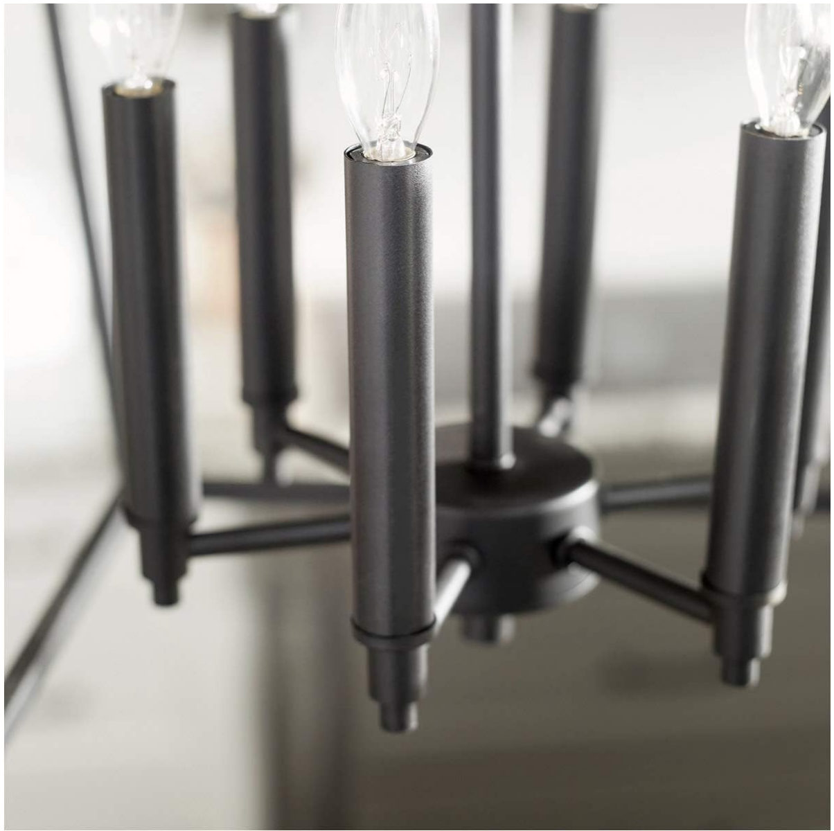
A detailed close-up of the central light cluster, showing the six E12 bulb sockets and their candelabra-style candle sleeves. This view highlights the internal structure and bulb type required.