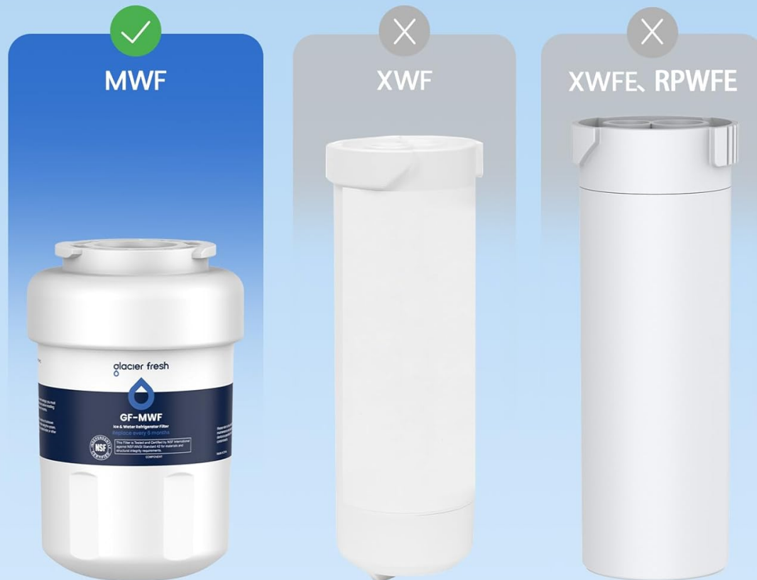
Figure 1: Compatibility chart for GLACIER FRESH GF-MWF filter. Ensure your refrigerator uses the MWF type filter.