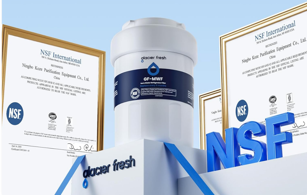
Figure 6: GLACIER FRESH GF-MWF is tested and certified by NSF International against NSF/ANSI Standard 42.