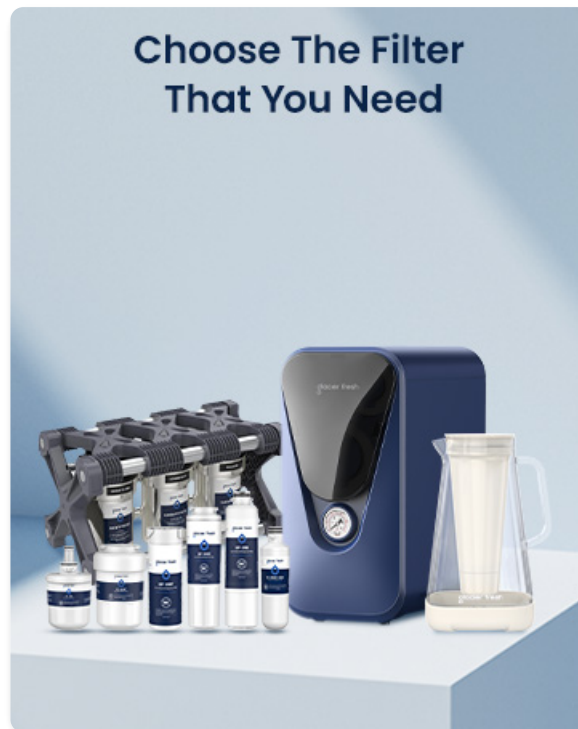
Figure 5: Reminder to change the filter every 3-6 months for optimal performance.

Using the provided month stickers can help you track your replacement date. Simply apply the sticker to the new cartridge and mark your calendar.