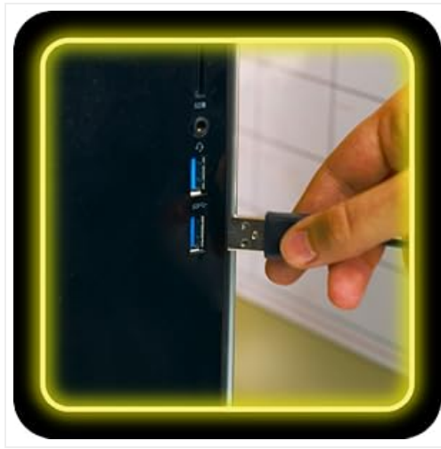
Image: Connecting the USB cable to the back of the Pacman light.