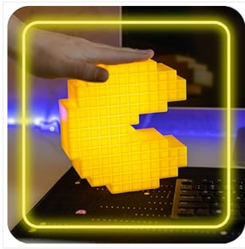
Image: Activating the Pacman light by touching its top surface.