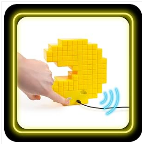
Image: Rear view of the Pacman light, highlighting the USB port and power switch.