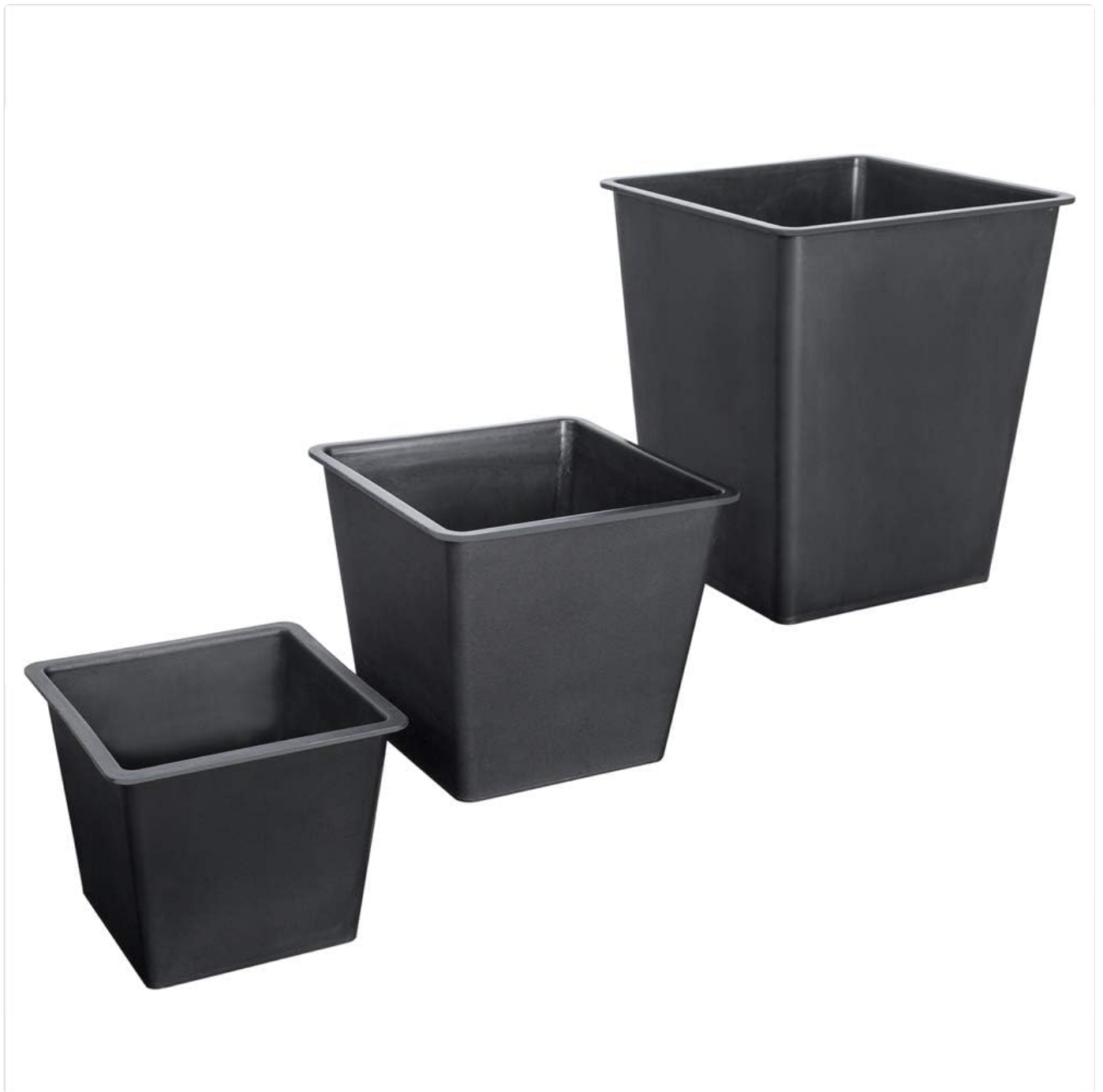
Image: The three black plastic inner pots, ready for planting.