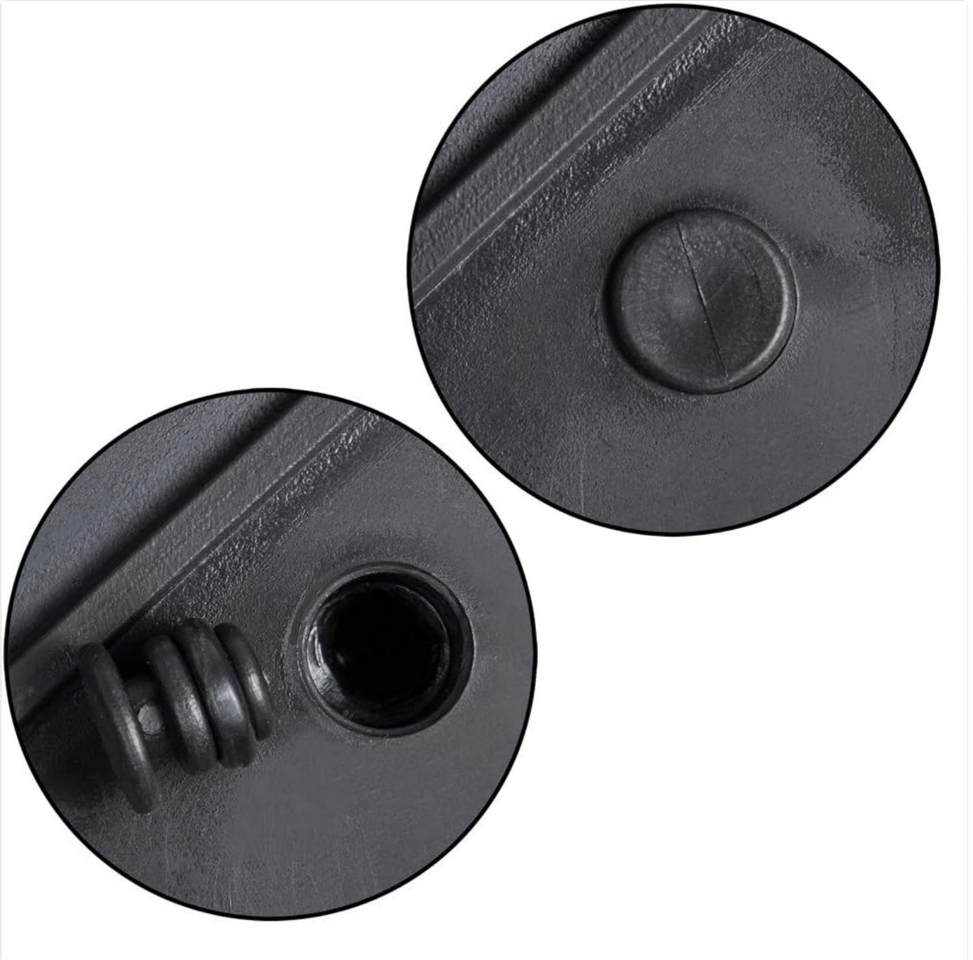
Image: Detail of the drainage hole and its removable stopper for water management.