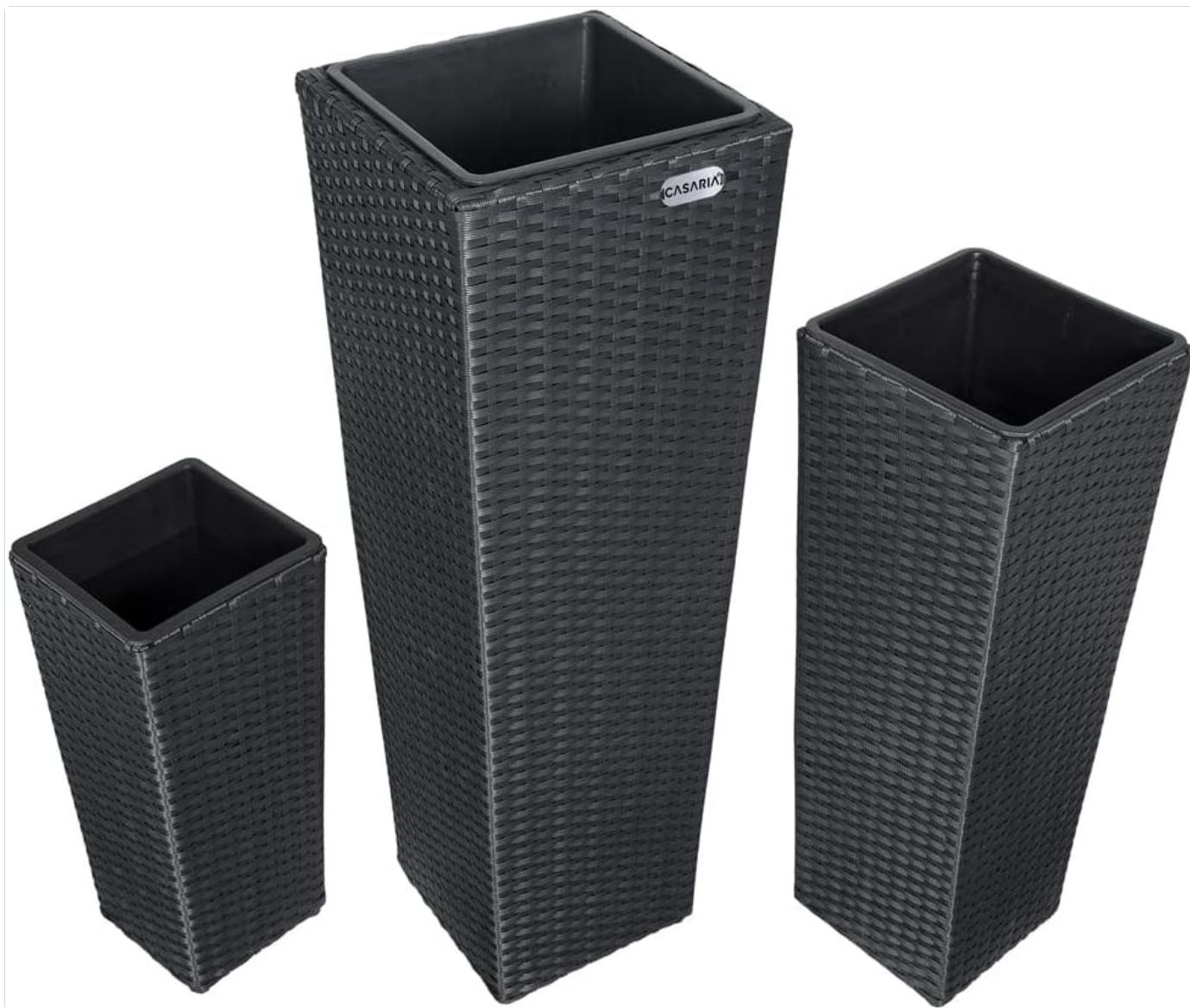
Image: The set of three planters, illustrating their different sizes and potential for arrangement.