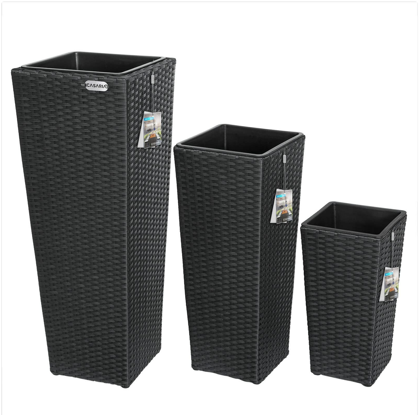
Image: The Casaria Set of 3 Poly Rattan Planters, showcasing their elegant design and suitability for outdoor environments.