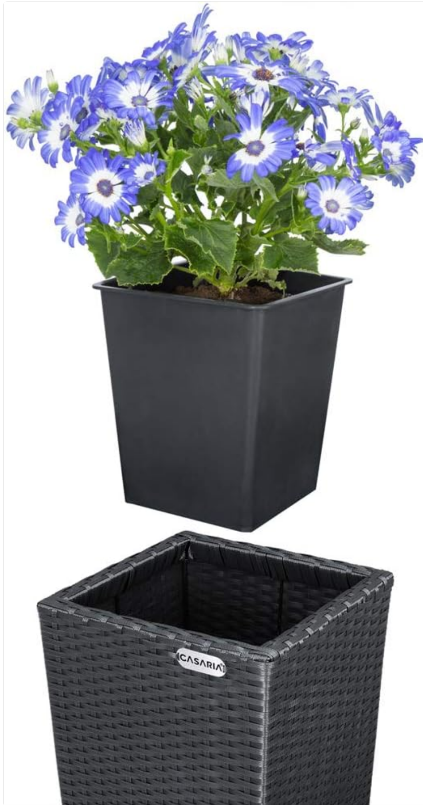
Image: The removable inner pot, demonstrating how it fits within the poly rattan outer frame.