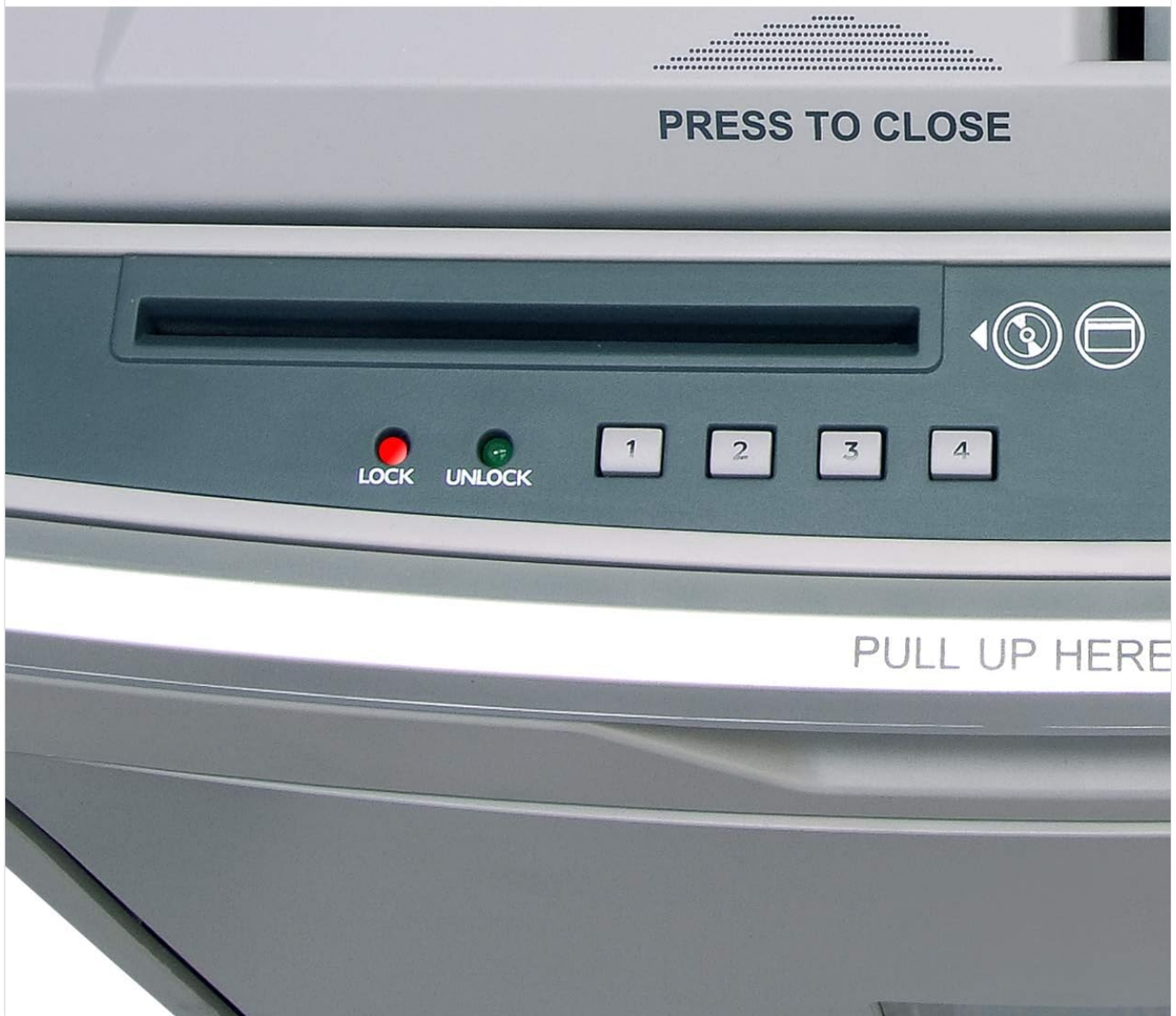
Figure 4: Close-up of the control panel showing the LOCK/UNLOCK lights and PIN entry buttons. This feature allows securing documents in the auto-feed tray.