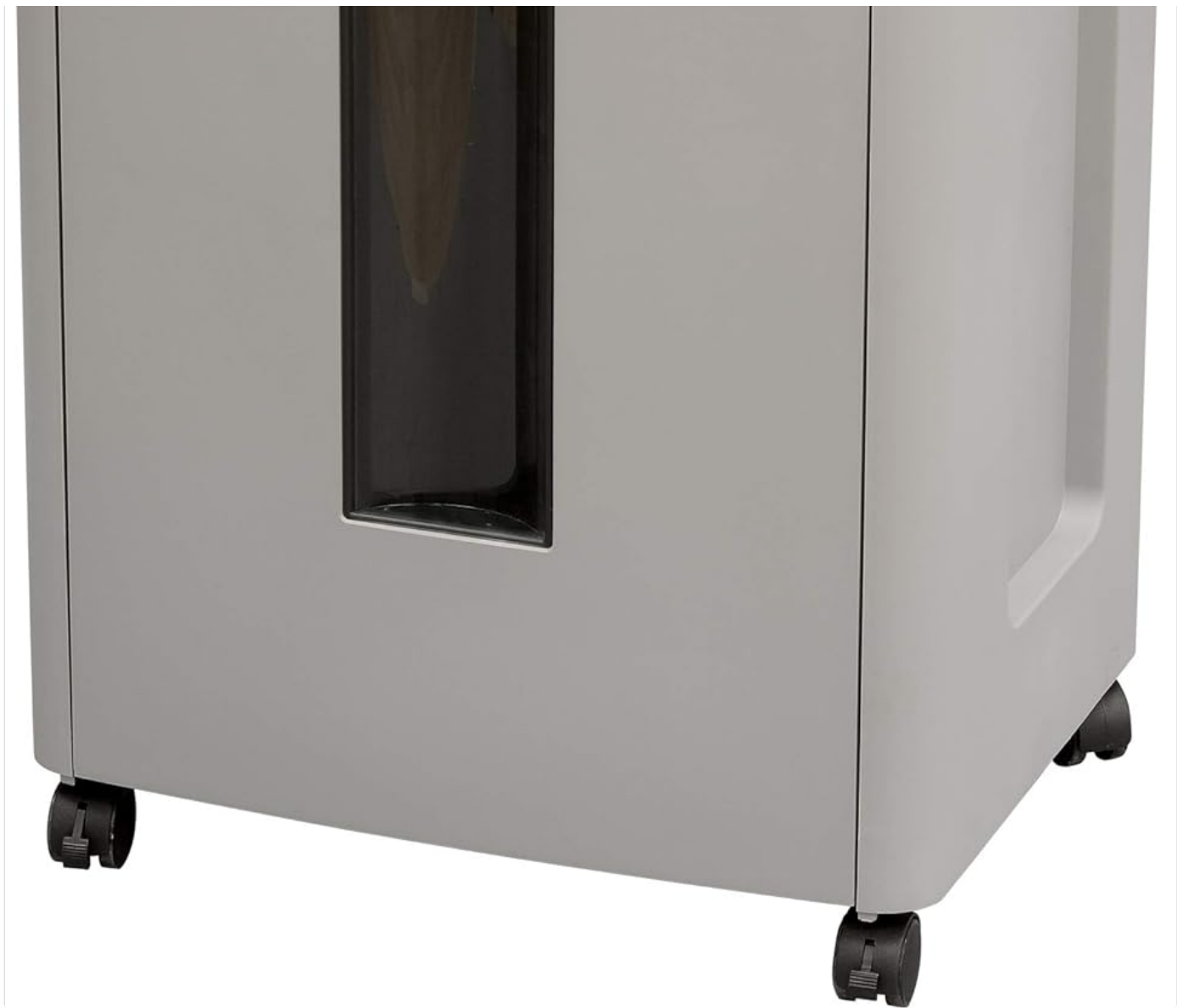
Figure 1: BOXIS AutoShred AF650 Paper Shredder, front view. This image shows the overall design of the shredder, including the waste bin window and casters.