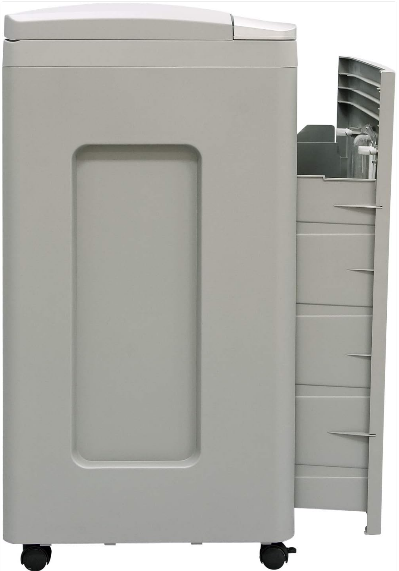
Figure 9: Side view of the shredder with the 14-gallon waste bin partially pulled out for emptying.