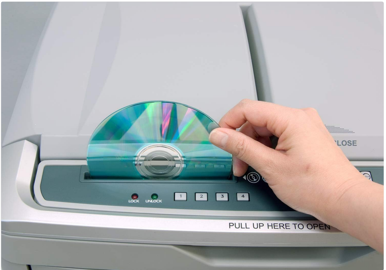
Figure 6: A hand inserting a CD into the dedicated shredding slot on the shredder's top panel.