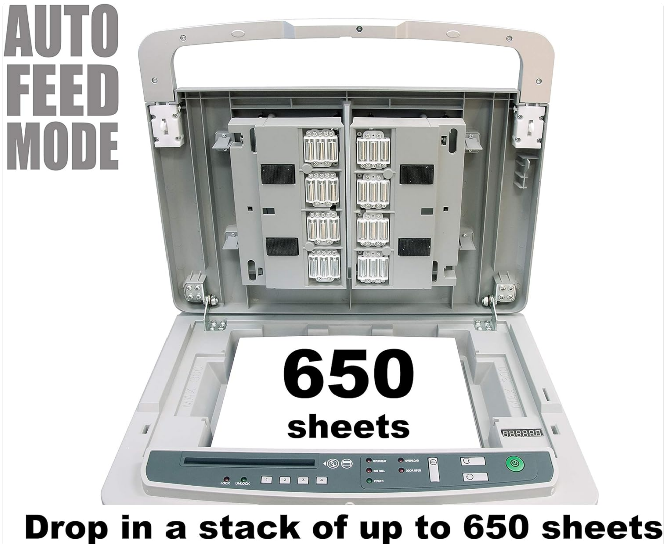
Figure 3: Demonstrates placing a stack of up to 650 sheets into the auto-feed tray for automatic shredding.