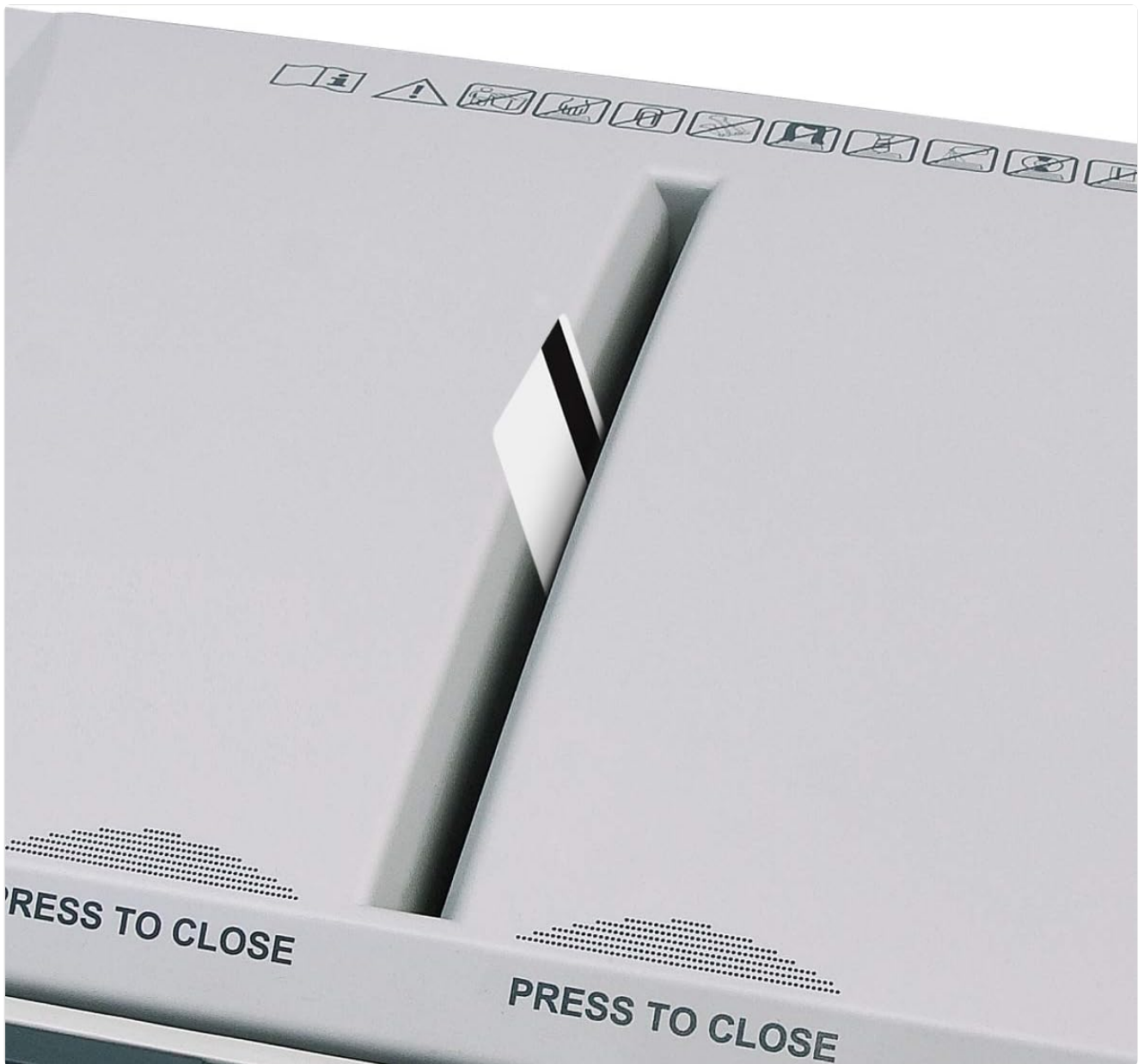
Figure 7: A credit card being inserted into the dedicated slot for secure disposal.

The BOXIS AutoShred AF650 utilizes microcut technology, turning documents into 1,200 to 1,500 particles per letter-sized document, offering a higher level of security compared to standard crosscut shredders.