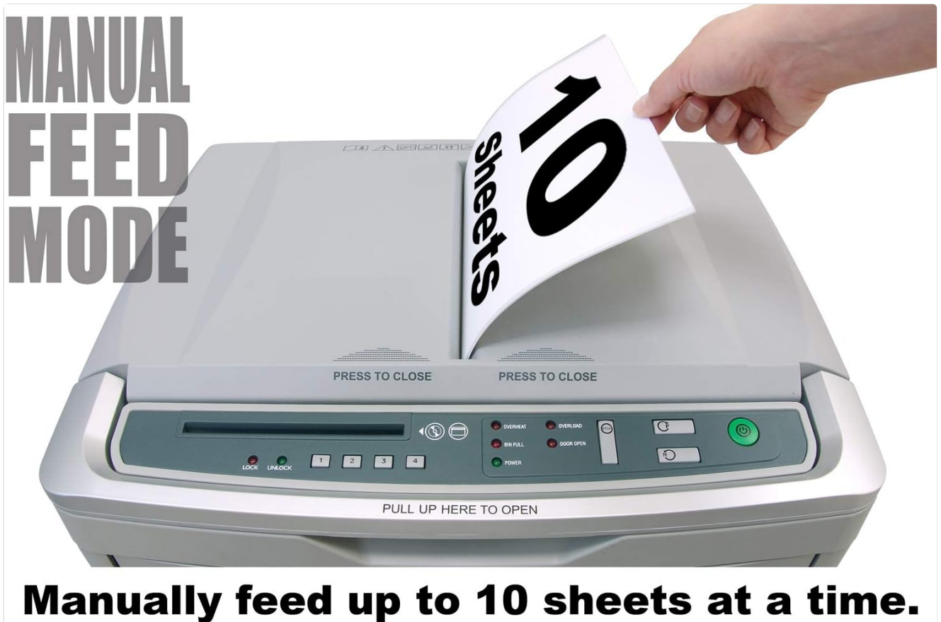
Figure 5: Illustrates inserting up to 10 sheets of paper into the manual feed slot for quick shredding.