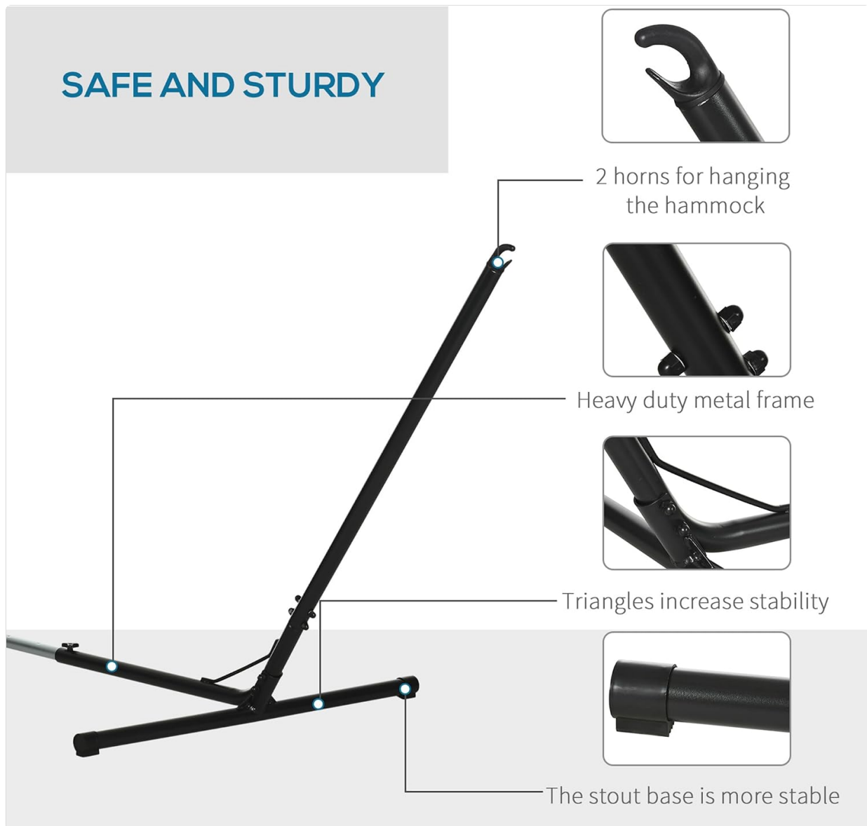
Figure 1: Exploded view of hammock stand components.