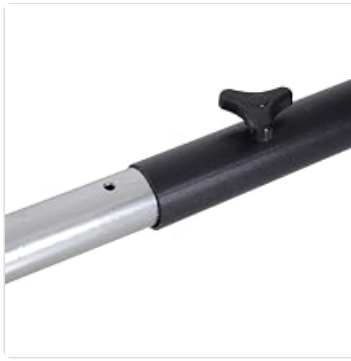
Figure 2: Visual guide for easy assembly.