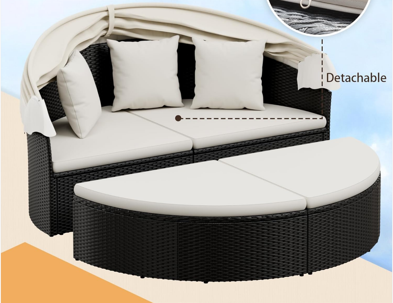
Image: The daybed configured with separated seating, demonstrating its versatility for different outdoor arrangements.