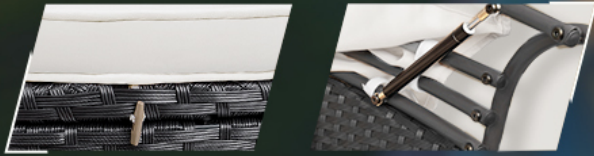
Image: Close-up of the adjustable canopy mechanism, showing how it can be easily extended or retracted for shade.

You can enjoy a sun bath in the warm sunshine when closing the canopy or enjoy a cool in the hot weather when opening the canopy.