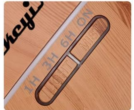
Image: Detailed view of the diffuser's mist outlets on top, the power input port at the back, and the control buttons (Light, Mist, Timer) located on the front base.