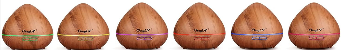
Image: The CkeyiN 550ml Aroma Diffuser, featuring a wood grain finish, mist output, and a remote control for convenient operation. The base shows an illuminated LED ring.