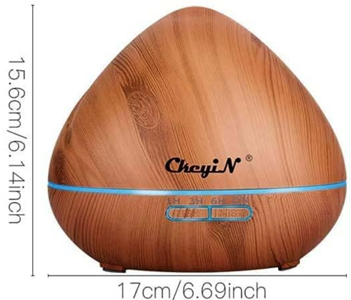
Image: The diffuser's dimensions are displayed as 15.6 cm (height) by 17 cm (width). Below, seven different LED light colors are shown, indicating the customizable ambient lighting feature.