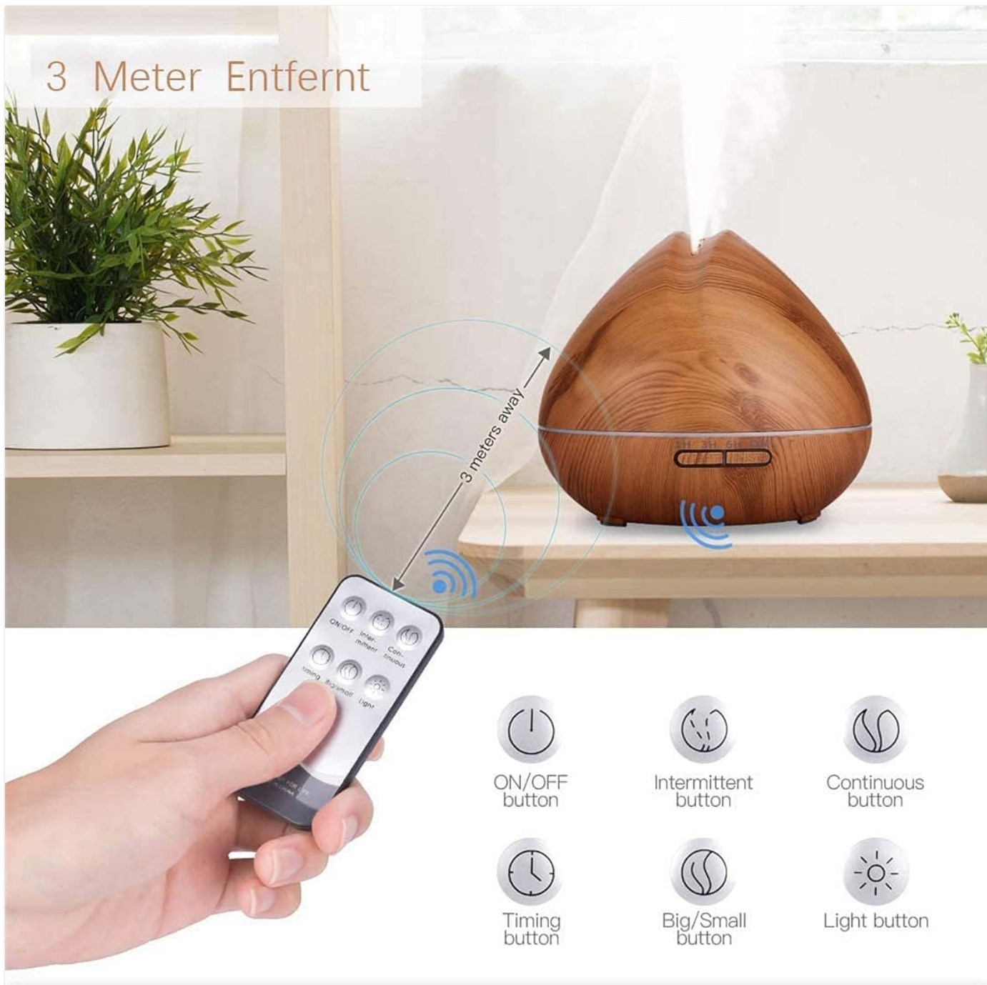
Image: A hand holding the remote control, demonstrating its effective range of approximately 3 meters. The remote features buttons for ON/OFF, Intermittent mist, Continuous mist, Timing, Mist Volume (Big/Small), and Light control.