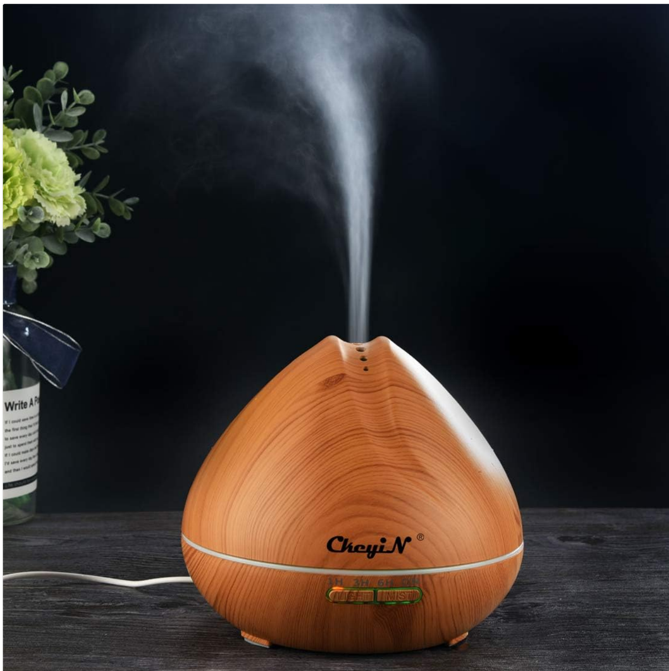
Image: The CkeyiN Aroma Diffuser actively releasing a visible stream of mist, demonstrating its humidifying and diffusing capability.