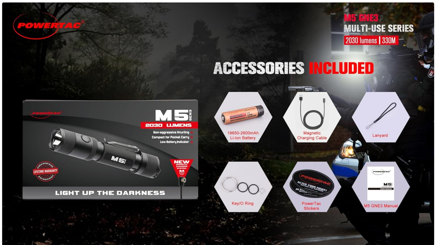
Image: A visual representation of the PowerTac M5-G3 flashlight and all its included accessories, such as the battery, charging cable, lanyard, and spare O-rings.