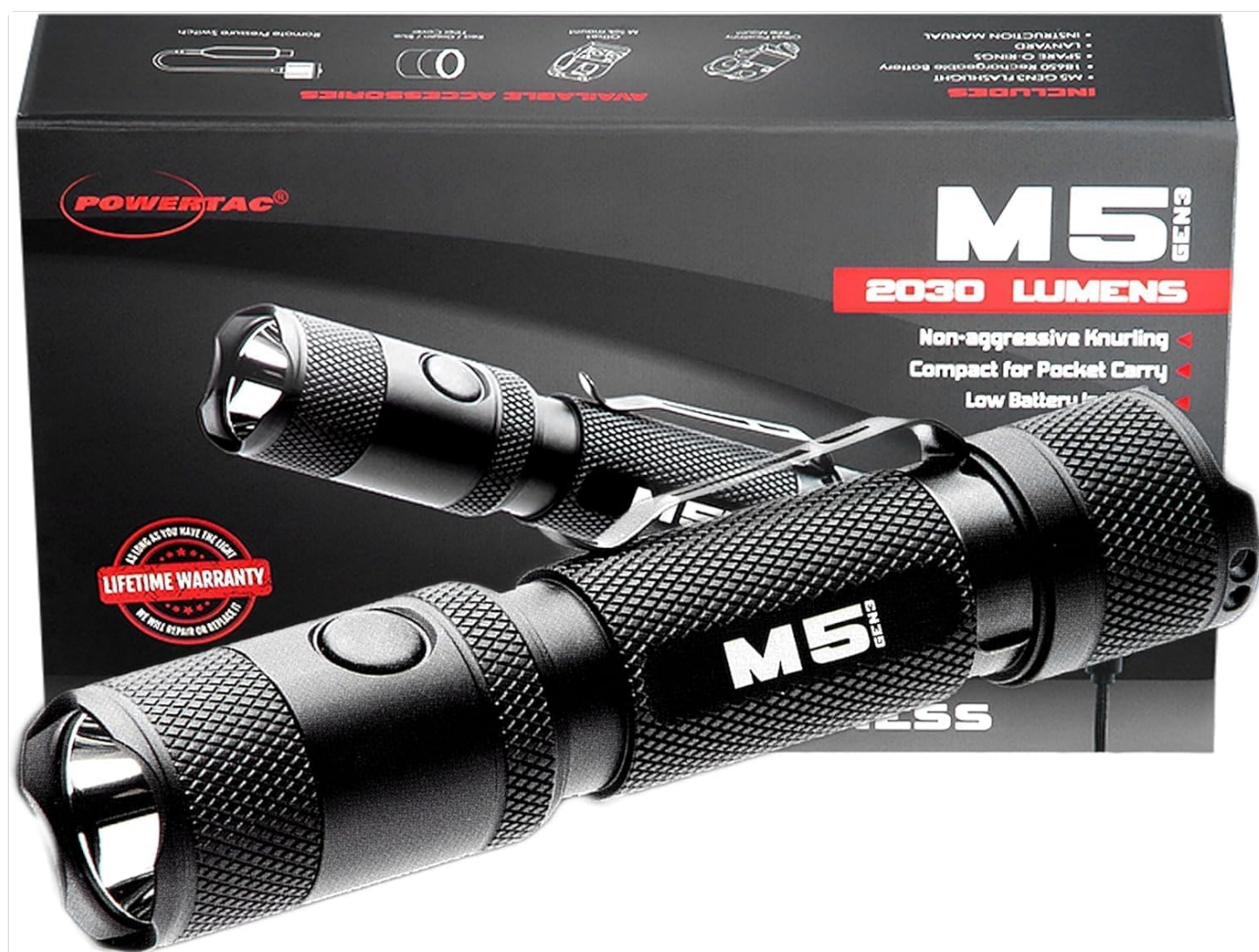
Image: PowerTac M5-G3 Tactical Flashlight shown with its retail packaging, highlighting its compact size and design.

The PowerTac M5-G3 is a high-performance tactical flashlight designed for reliability and versatility in various conditions. It features a powerful LED, multiple lighting modes, and convenient magnetic charging. Its robust construction ensures durability for demanding applications.