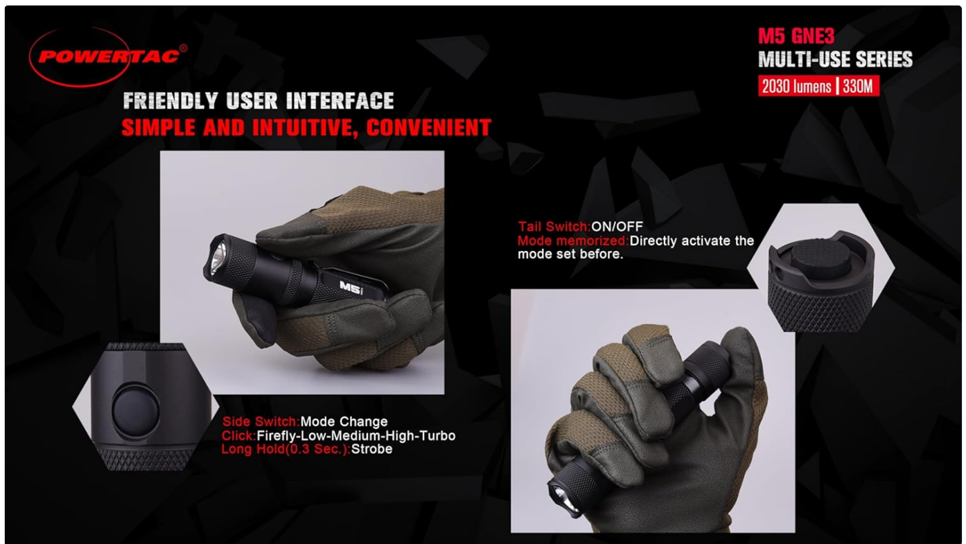
Image: A diagram illustrating the dual switch operation of the PowerTac M5-G3, detailing the functions of the tail switch for on/off and momentary activation, and the side switch for mode cycling and strobe.

Video: An official product video from PowerTac USA demonstrating the features and operation of the M5-G3 flashlight.