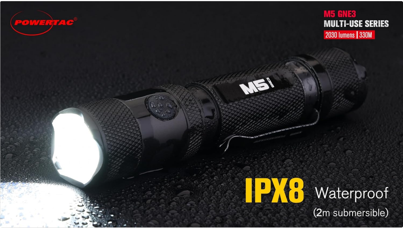
Image: The PowerTac M5-G3 flashlight submerged in water, illustrating its IPX8 waterproof capability (2m submersible).