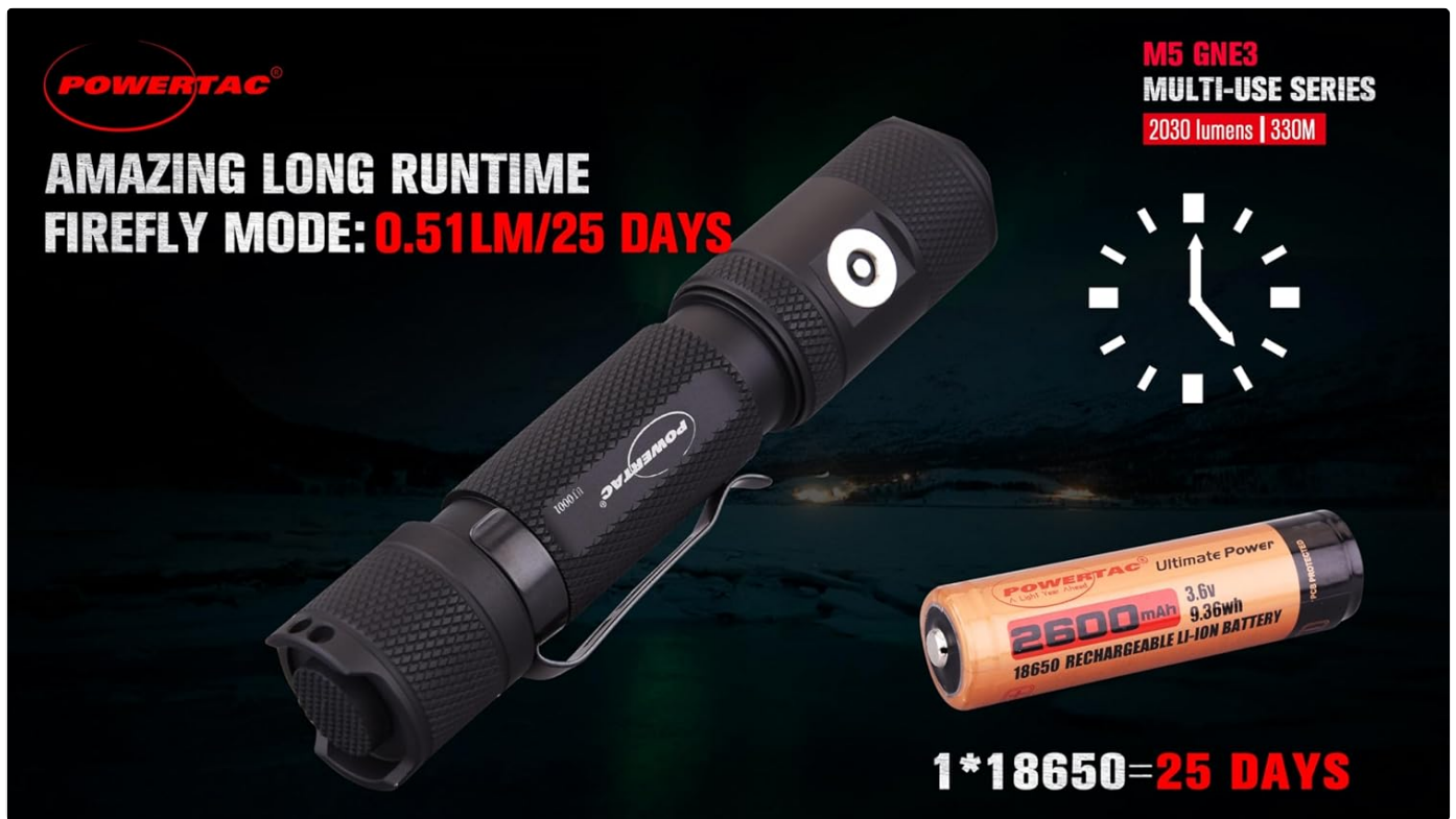
Image: The PowerTac M5-G3 flashlight alongside its 18650 rechargeable Li-ion battery, with an overlay indicating a 25-day runtime in Firefly mode.