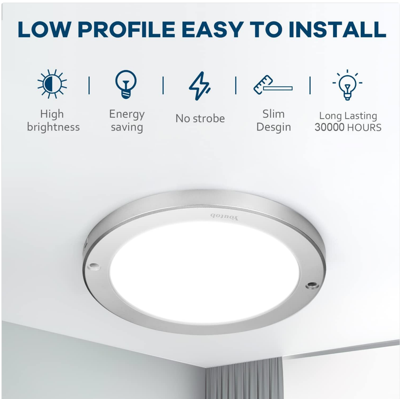
Image 5.1: The slim profile of the Youtob LED Ceiling Light after installation, highlighting its low-profile design.