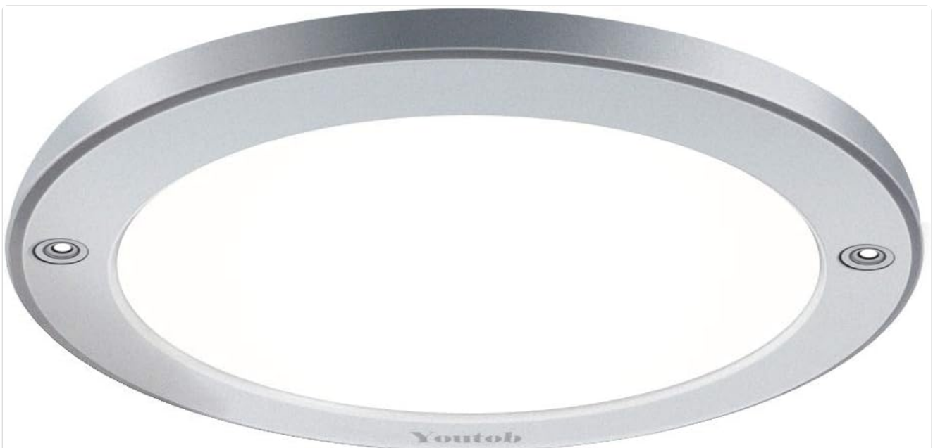
Image 1.1: Front view of the Youtob LED Flush Mount Ceiling Light, showcasing its round, slim design and brushed silver finish.

This Youtob LED Ceiling Light (Model FM-LS-3000K) is a 15W, 1200 lumen fixture with a 4000K cool white color temperature. It features a slim, round design with a brushed silver finish, measuring 8.7 inches in diameter and 0.65 inches in thickness. It is designed for various indoor applications, including kitchens, bedrooms, bathrooms, closets, stairways, hallways, basements, and laundry rooms. The fixture utilizes edge-lit technology for even light distribution and efficient heat dissipation, contributing to a longer LED lifespan of over 30,000 hours.