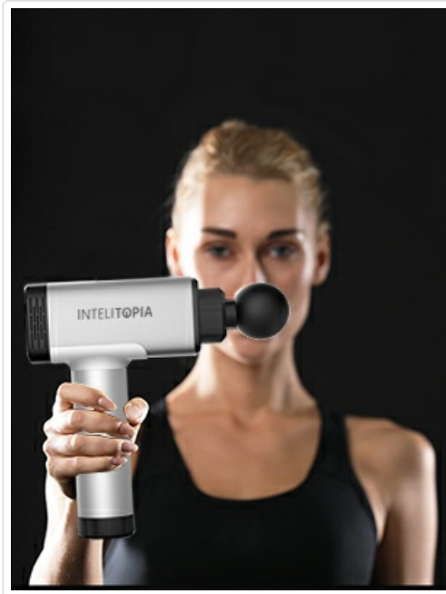
Image: The Intelitopia 5.2 Massage Gun displayed with its interchangeable massage heads.