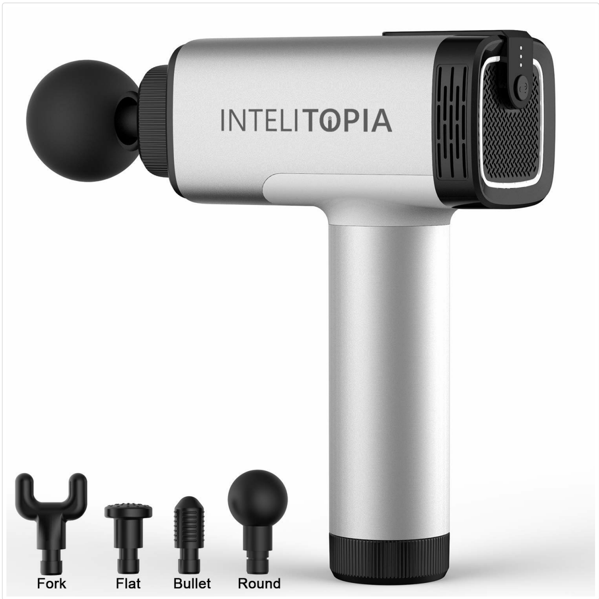
Image: The Intelitopia 5.2 Percussion Massage Gun with its included accessories, neatly organized in its packaging.