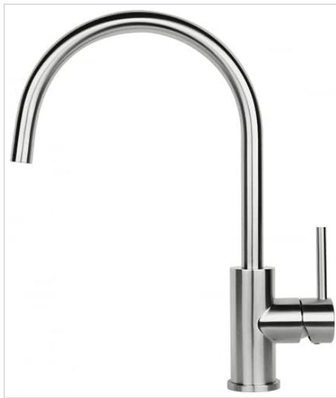
Image: The Reginox Spring Stainless Steel Single Hand Mixer Sink Faucet, showcasing its sleek, brushed stainless steel finish and elegant curved spout.