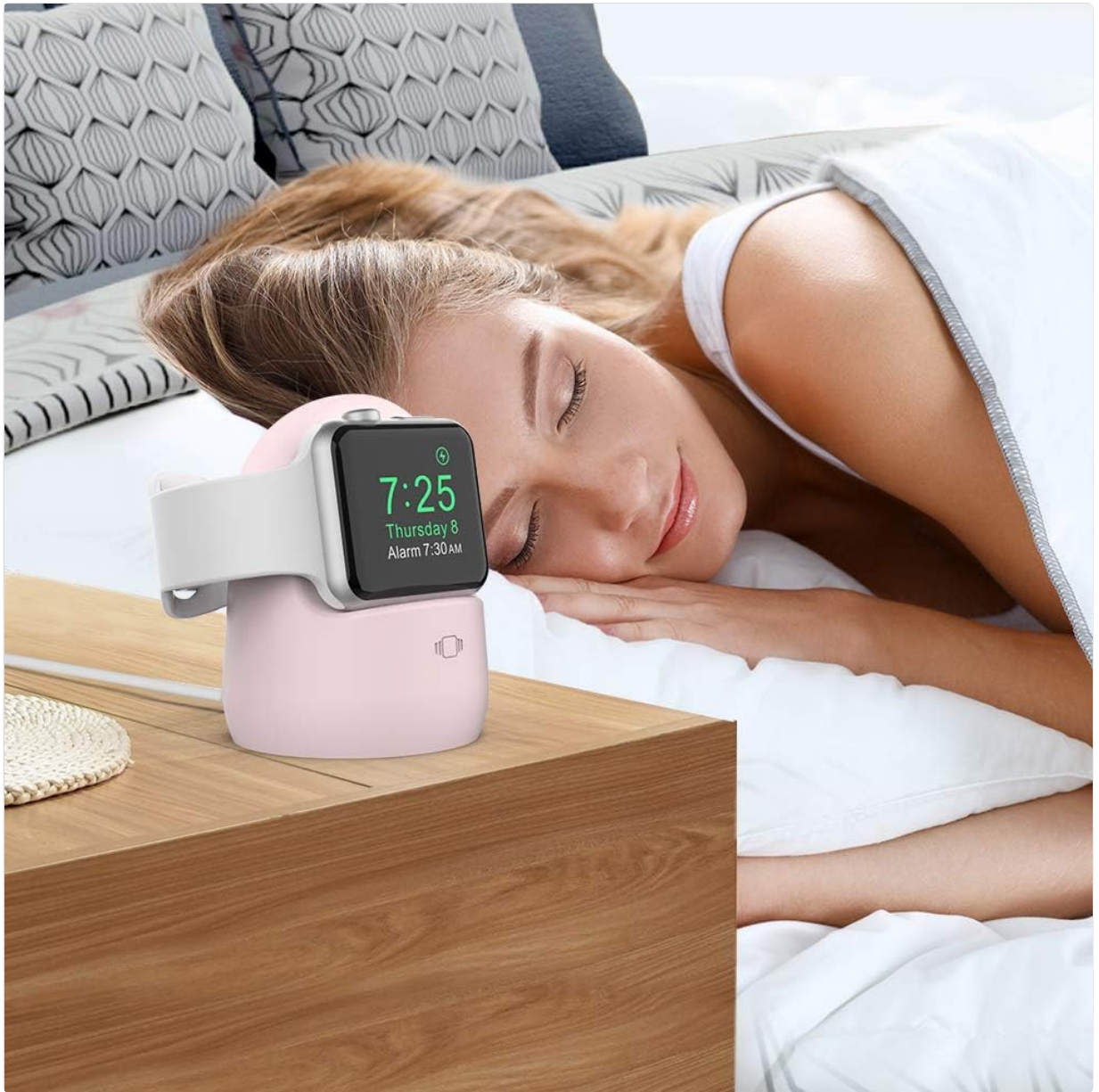
This image depicts the Apple Watch stand in use on a nightstand, showcasing its compatibility with Nightstand Mode for easy viewing of time and alarms.