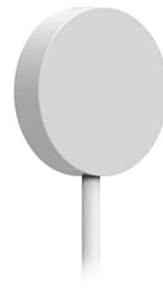
MAGNETIC FAST CHARGER

This chart visually confirms compatibility with all Apple Watch series and various charger types (metal, plastic, magnetic fast charger).