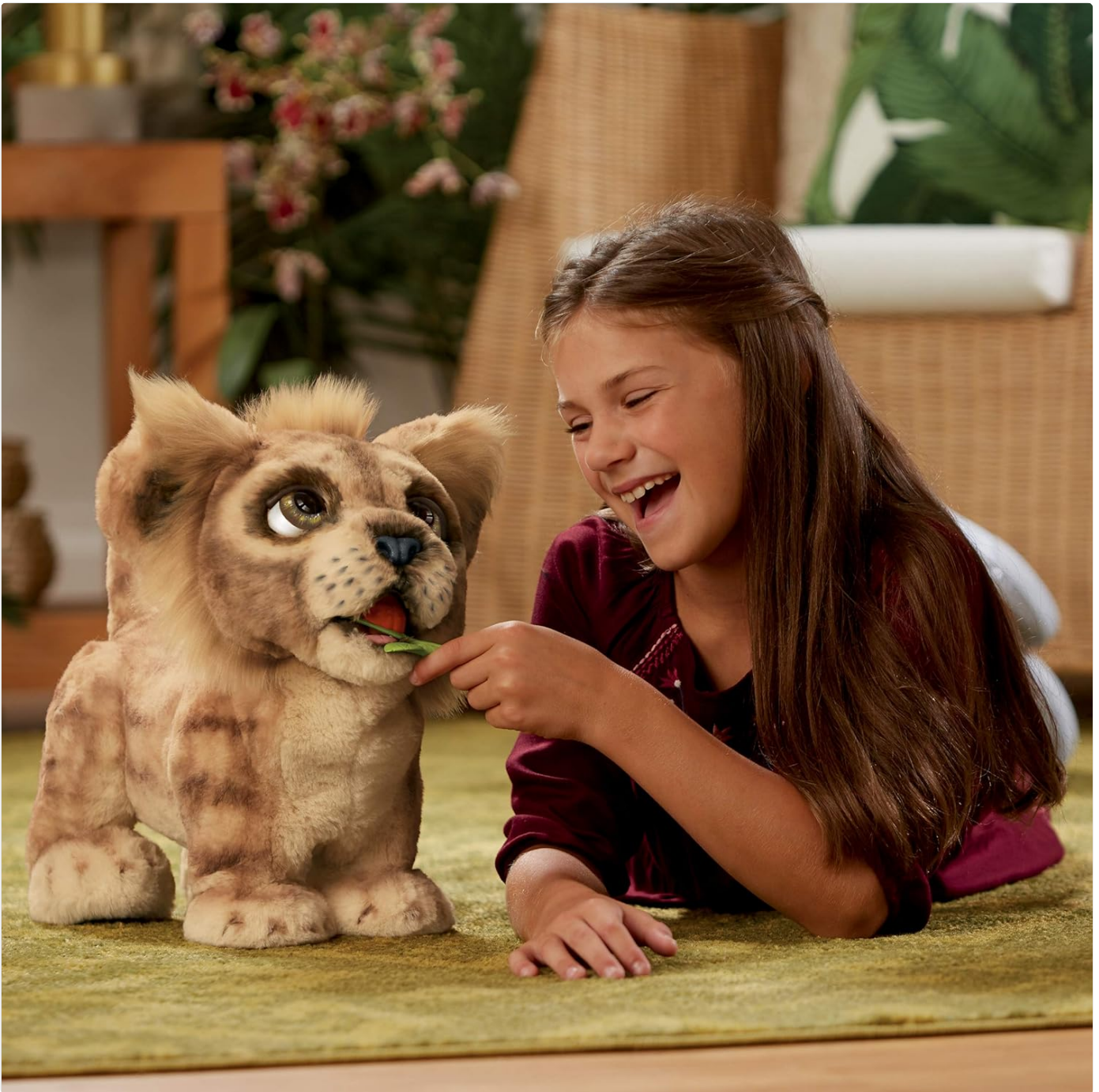
Figure 3: Feeding Simba his favorite grub treat.