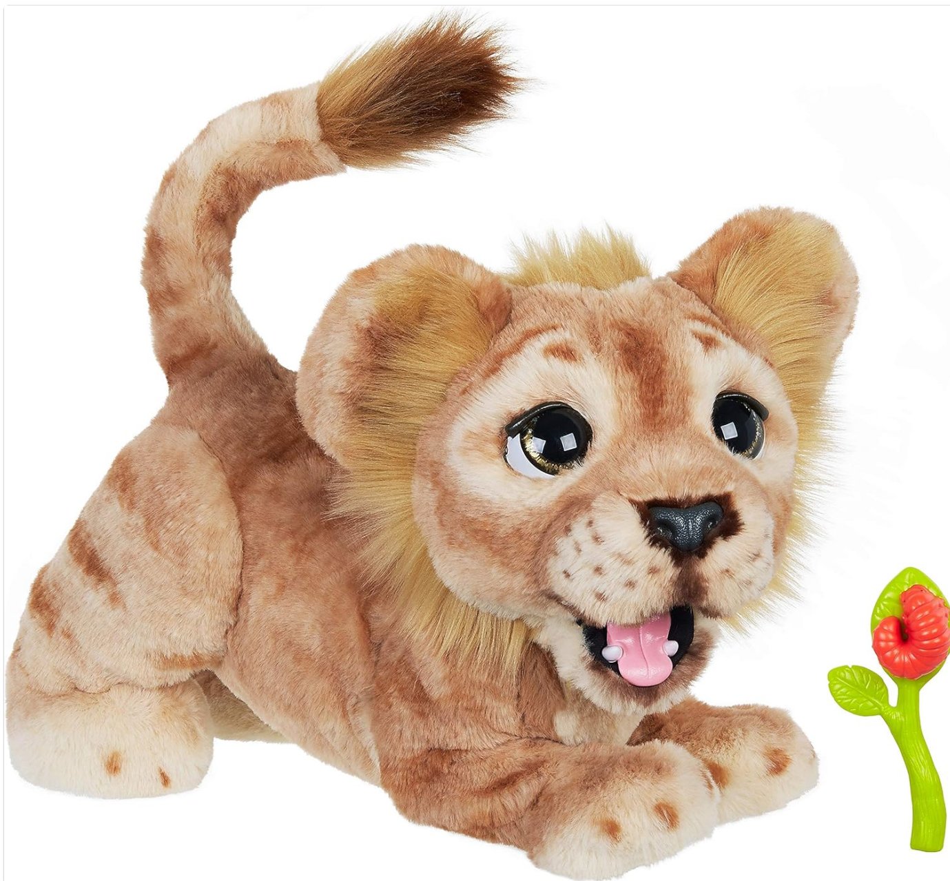
Figure 1: Disney The Lion King Mighty Roar Simba Interactive Plush Toy.