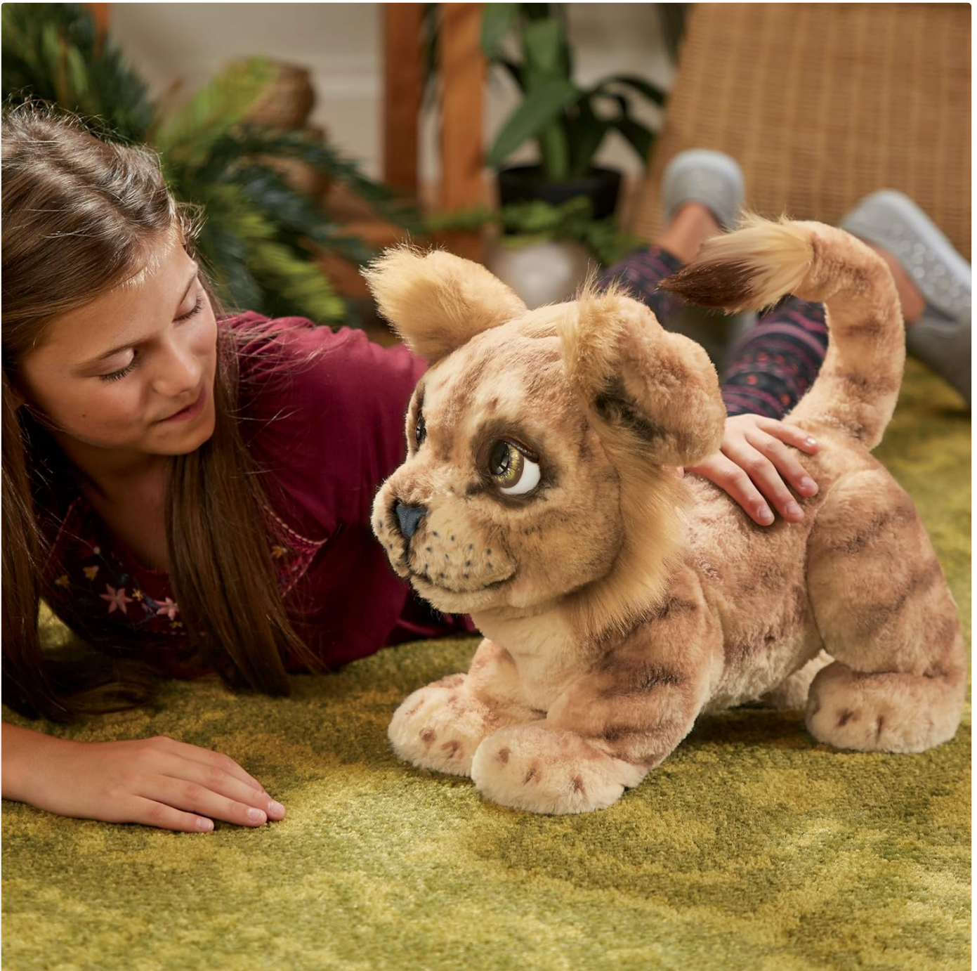
Figure 2: Petting Simba's back for contented reactions.