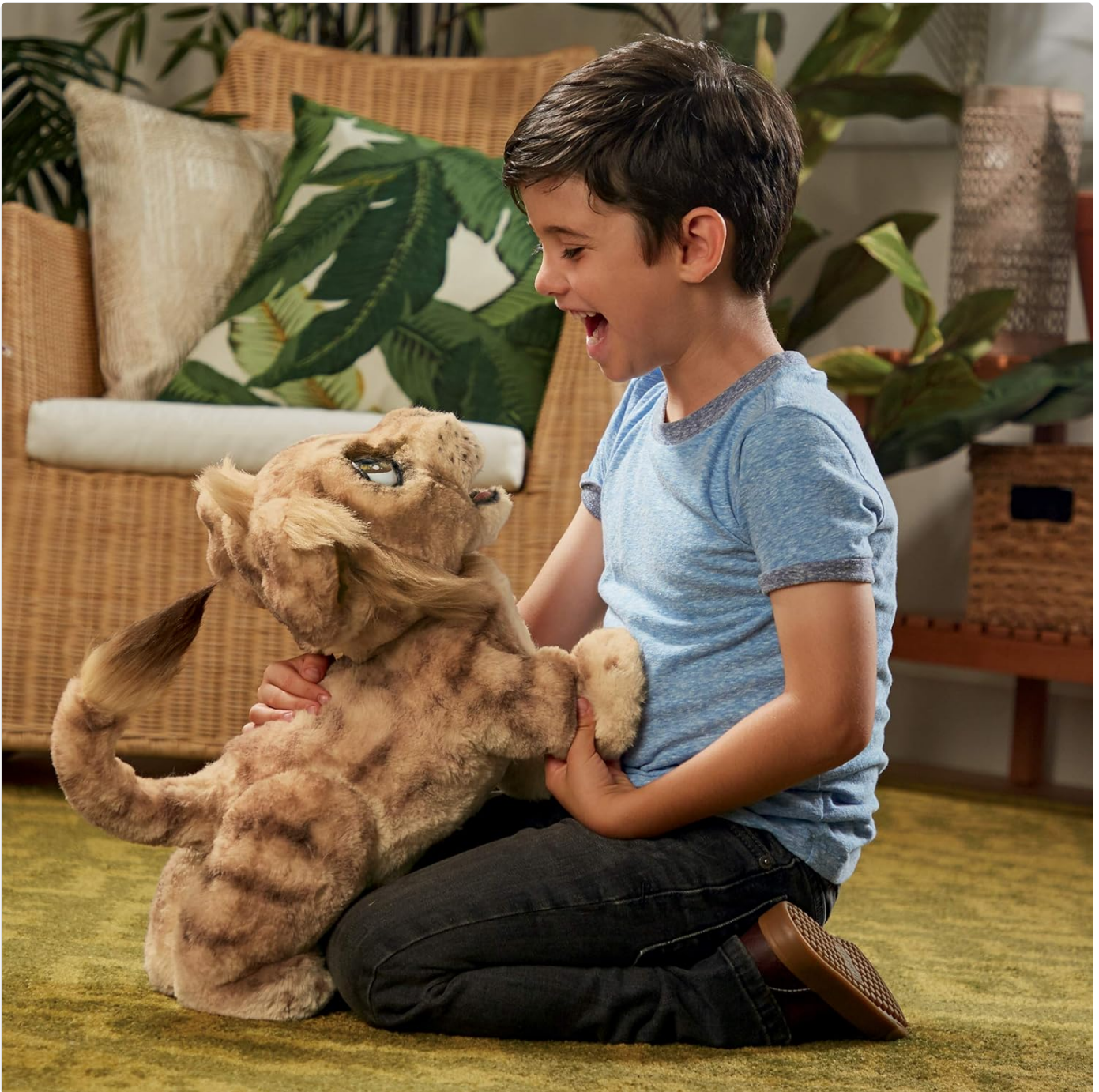
Figure 5: Simba's posable legs allow for standing or sitting.