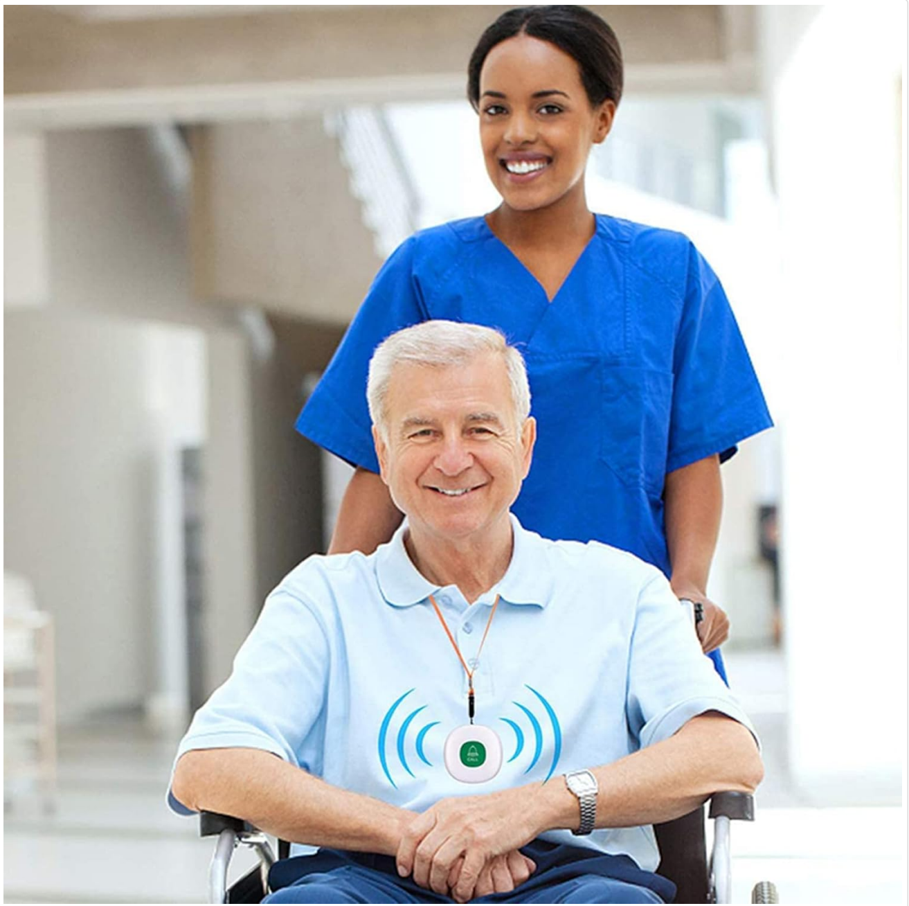
Figure 3.1: Activating the call button.