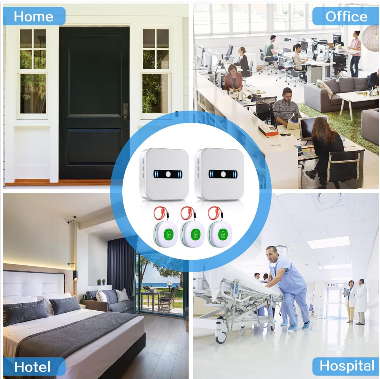
Figure 2.3: Versatile usage scenarios for the Daytech Call Alert System.