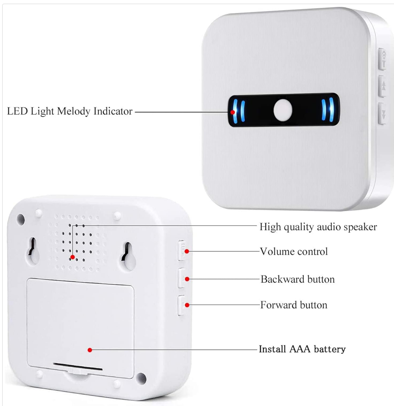
Figure 2.1: Receiver back panel with battery compartment and mounting options.