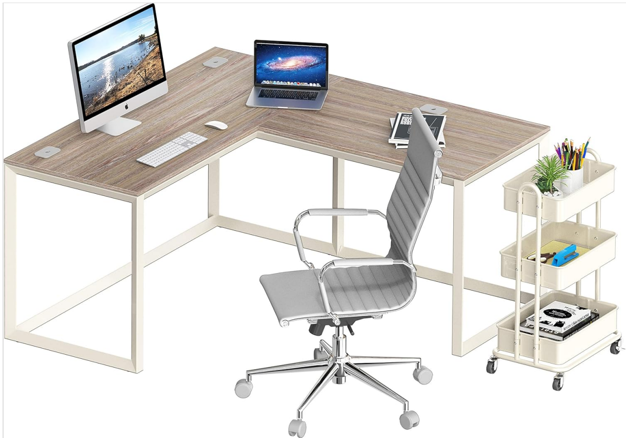
Figure 3.1: Overview of the SHW L-Shaped Home Office Computer Desk, shown with an office chair and a rolling storage cart, illustrating its potential use in a home office environment.