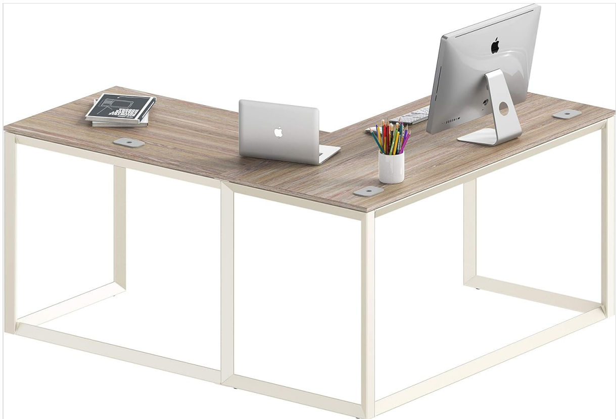
Figure 5.1: The SHW L-Shaped Home Office Computer Desk configured with two computer setups, demonstrating its ample workspace for multi-tasking or dual users.