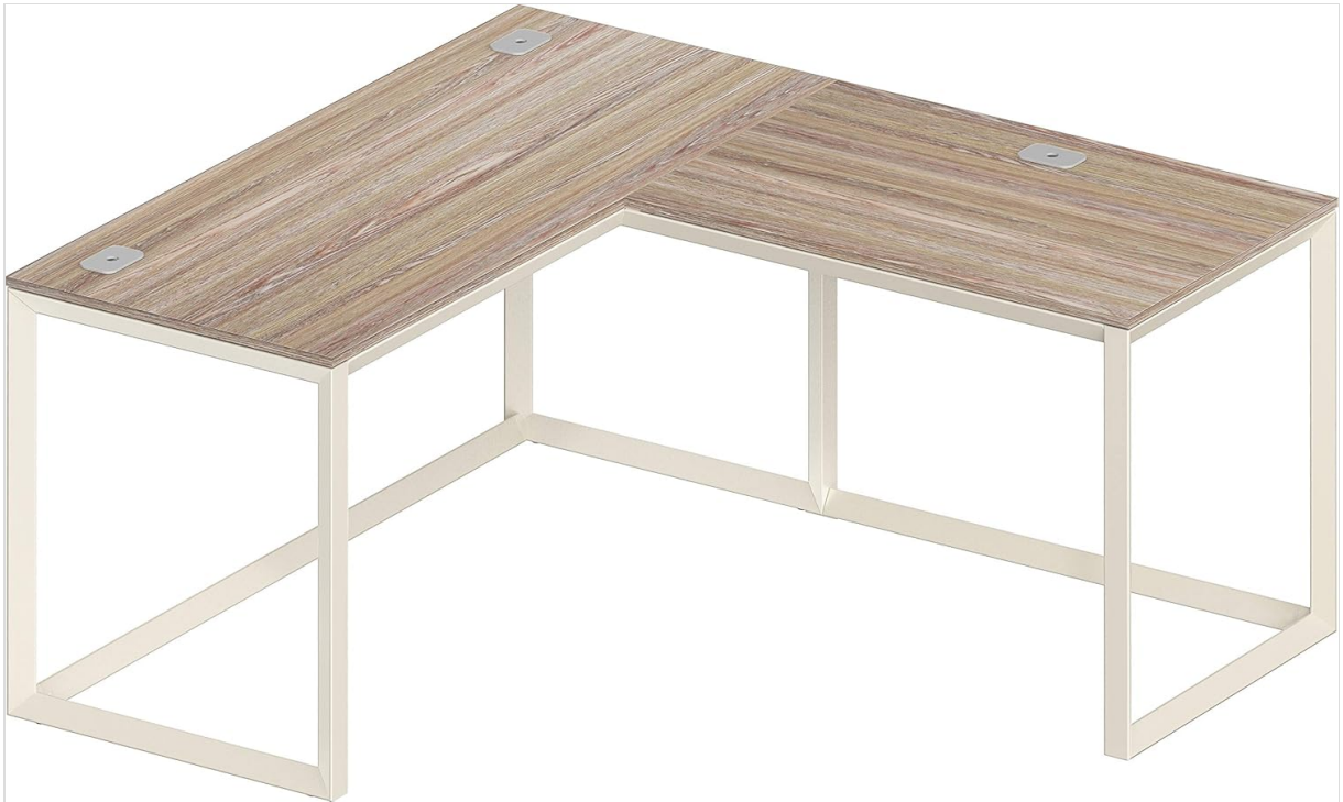
Figure 4.1: The fully assembled SHW L-Shaped Home Office Computer Desk, showcasing its minimalist design and sturdy steel frame.