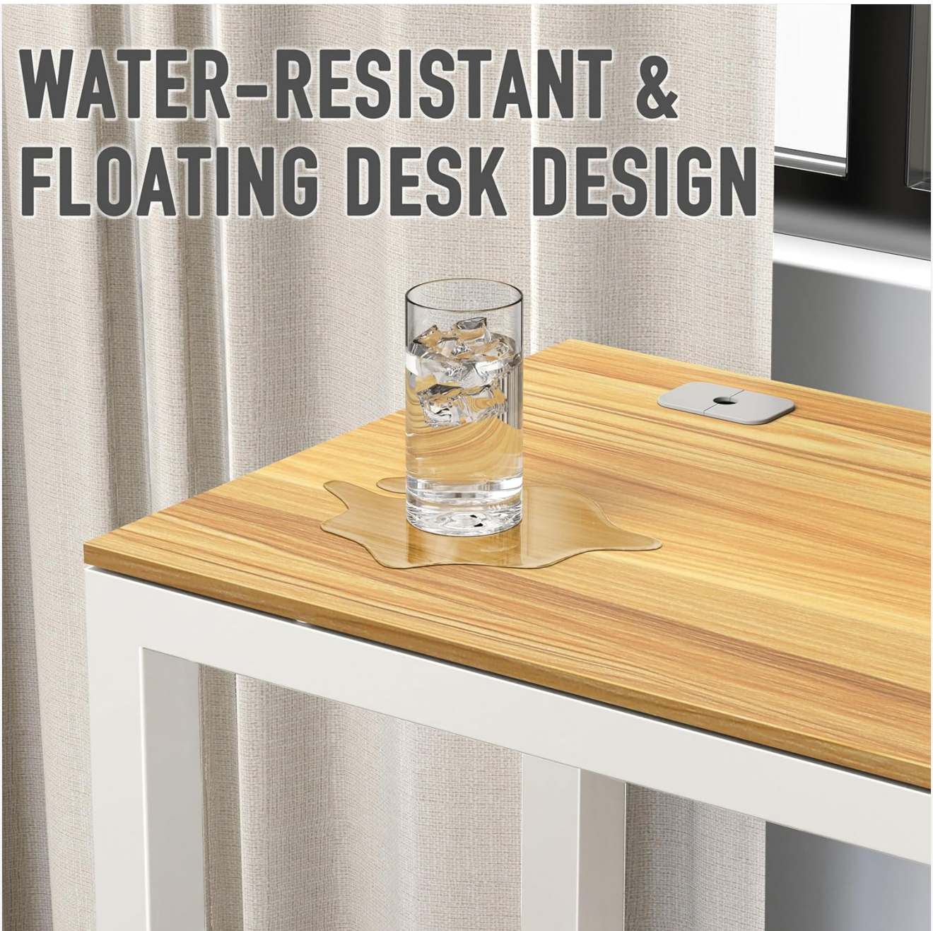
Image: A close-up view of the desk's oak-finish surface with a glass of water and a small spill, illustrating the water-resistant and floating desk design.