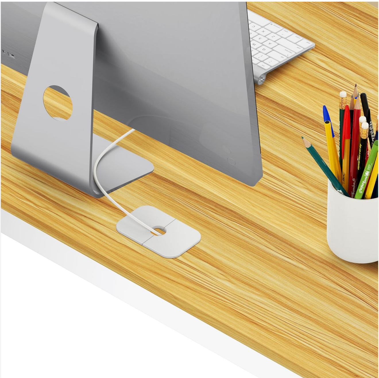
Image: A close-up of the desk surface showing a white computer mouse and a cable neatly routed through one of the integrated grommets, highlighting the cable management feature.