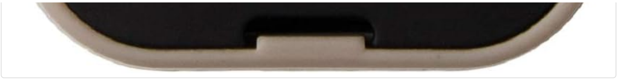
Figure 1: Front view of the XIHADA Universal Remote Control.