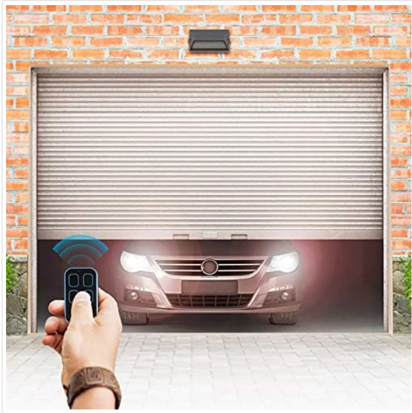
Figure 5: Operating the remote to open a garage door.