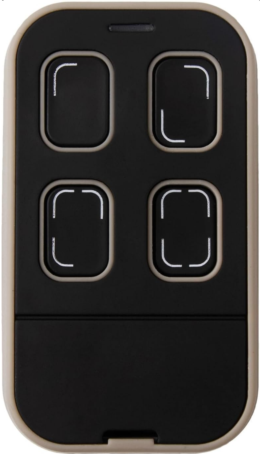
Figure 7: Physical dimensions of the remote control.