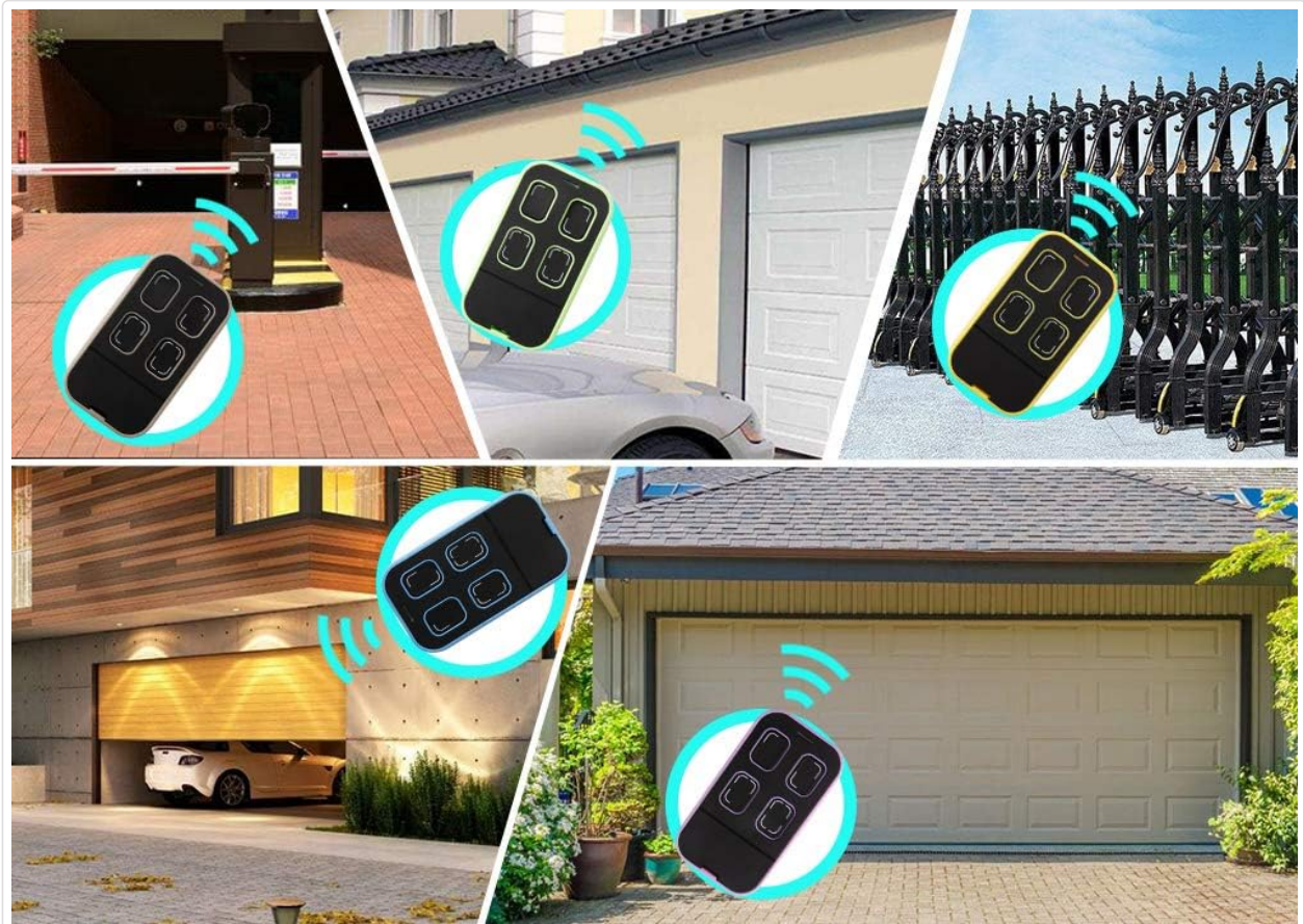
Figure 6: Versatile applications of the XIHADA Universal Remote.