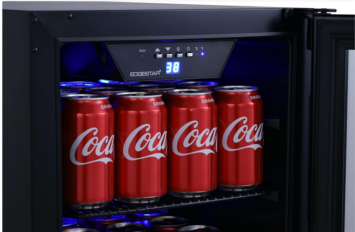
Digital control panel of the EdgeStar BBR901BL beverage center displaying temperature and control buttons.

The control panel is located at the top interior of the unit and features a digital display and push-button controls.