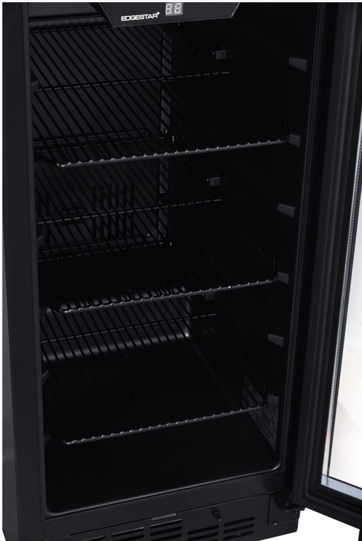
Interior of the EdgeStar BBR901BL beverage center with the door open, revealing empty wire shelves and blue LED lighting.