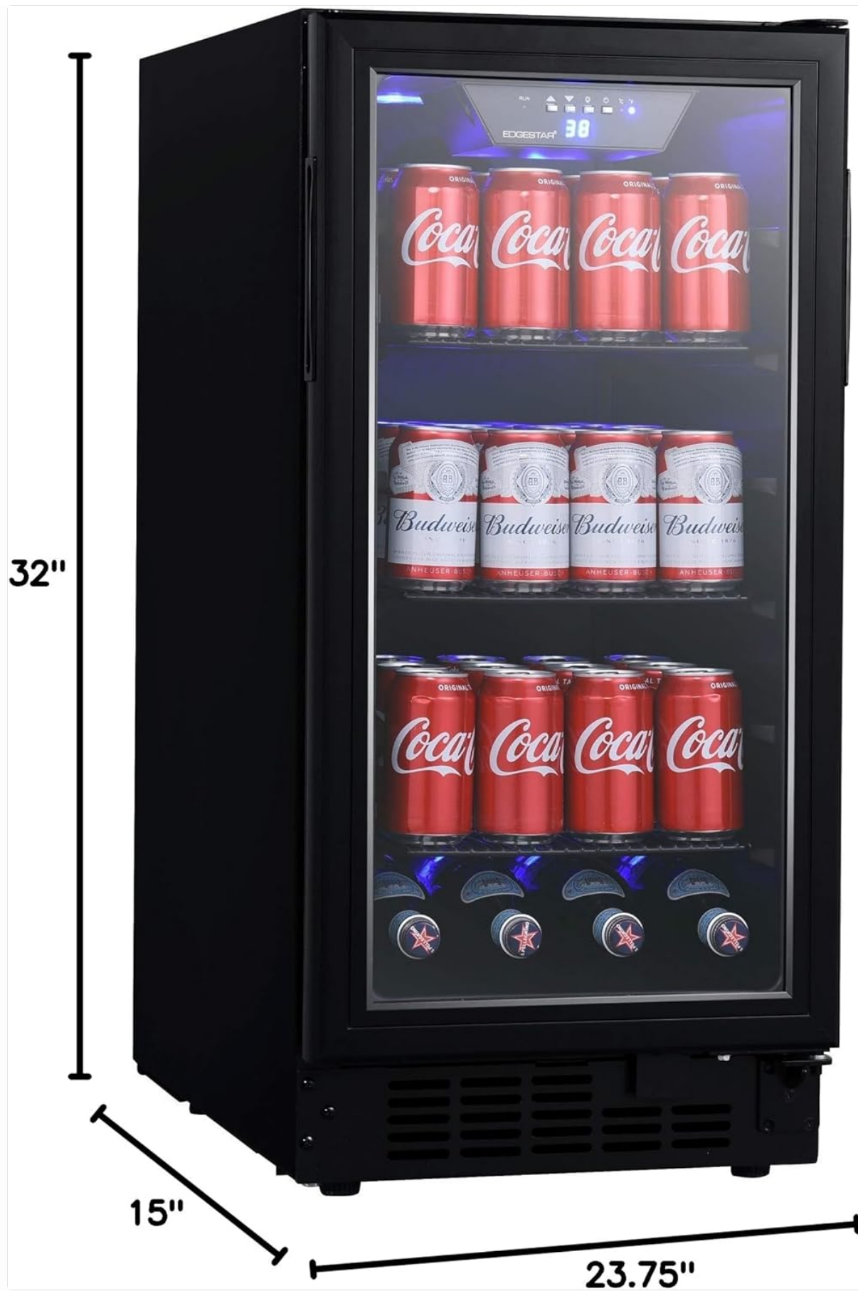
Diagram showing the dimensions of the EdgeStar BBR901BL beverage center: 32 inches height, 15 inches width, 23.75 inches depth.