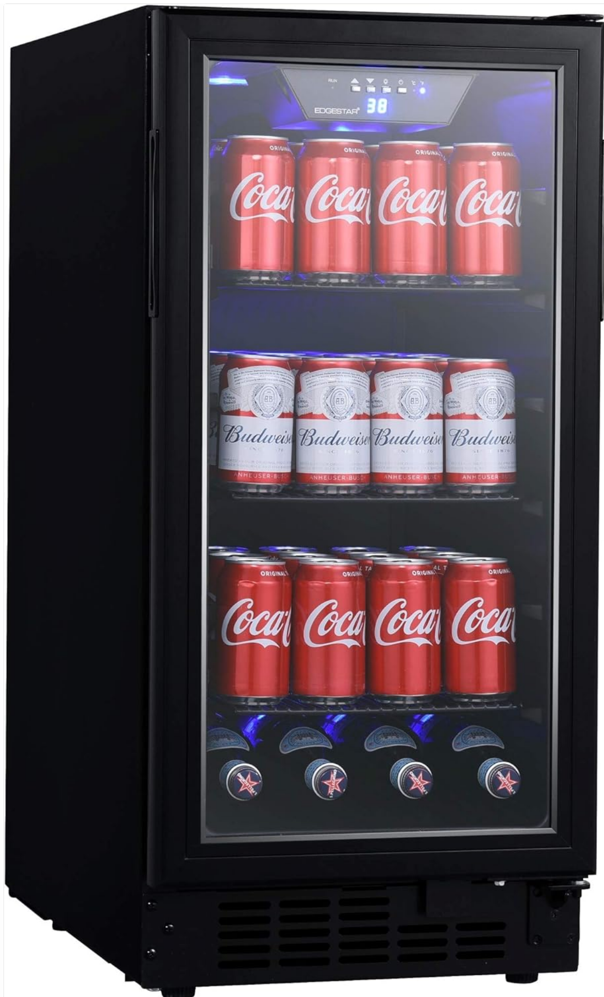
EdgeStar BBR901BL beverage center filled with various canned drinks, showcasing its capacity and interior lighting.