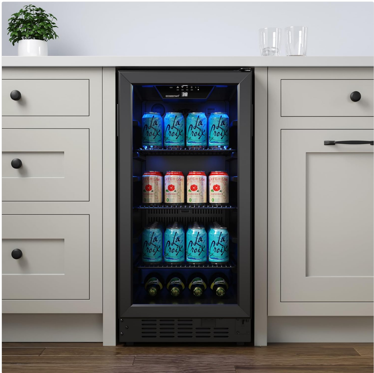
EdgeStar BBR901BL beverage center seamlessly integrated under a kitchen counter.