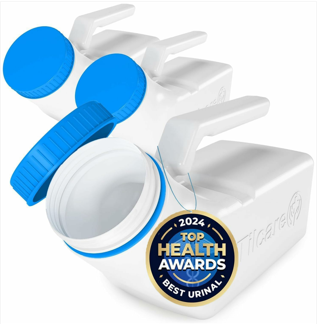
Image: Tilcare Male Urinal with blue screw lid. This image shows the overall design of the urinal, highlighting its compact and ergonomic shape.