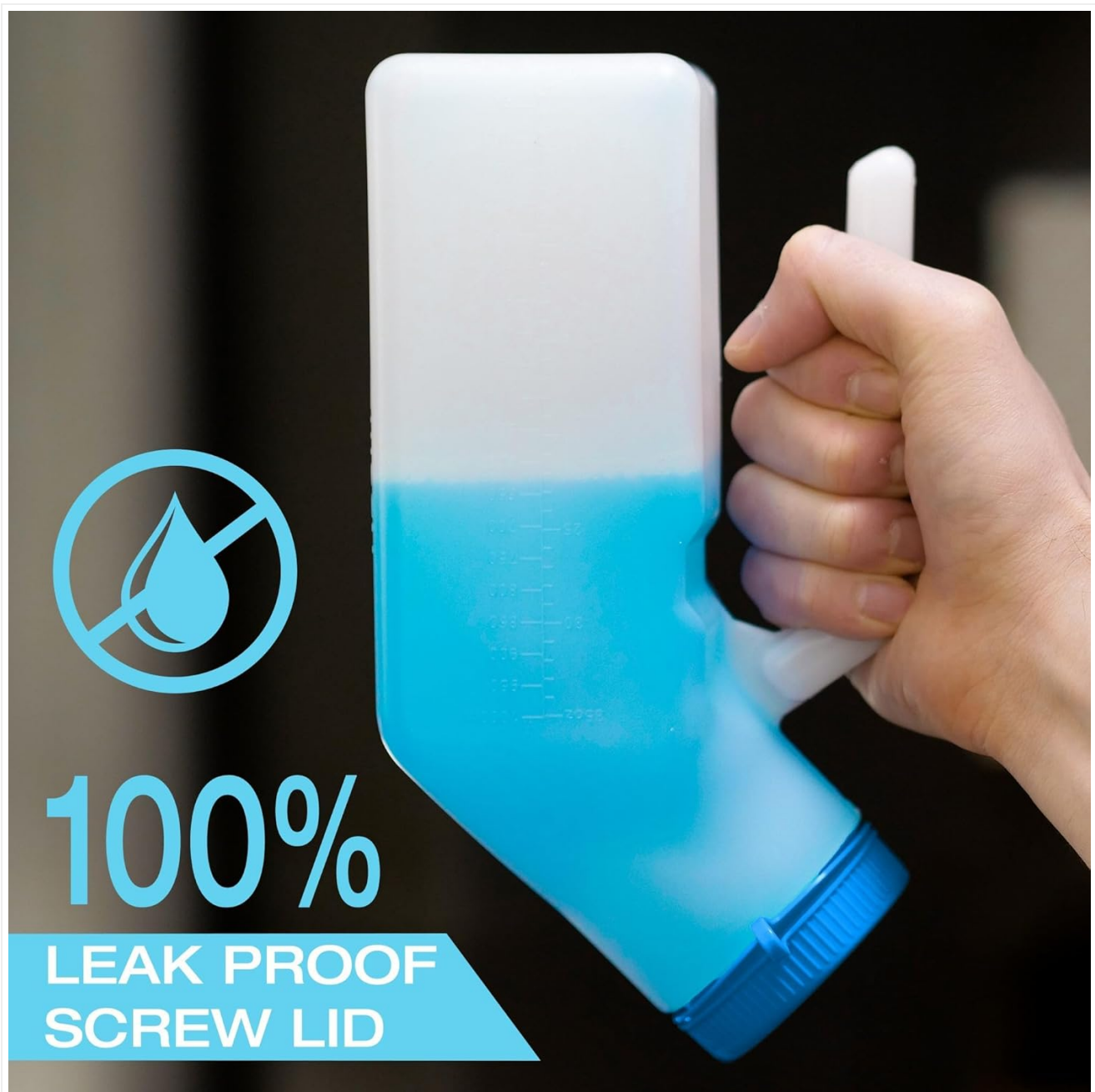
Image: Hand holding a Tilcare urinal with a blue liquid, showing a leak-proof icon. This illustrates the secure, leak-proof design of the urinal.

4. Placement: The sealed handle allows for easy carrying and can be hooked onto most bed rails for convenient access.