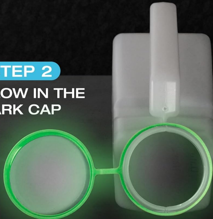
Image: Instructions for charging the glow-in-the-dark lid. Step 1 shows placing the lid in sunlight, and Step 2 shows the lid glowing in the dark.