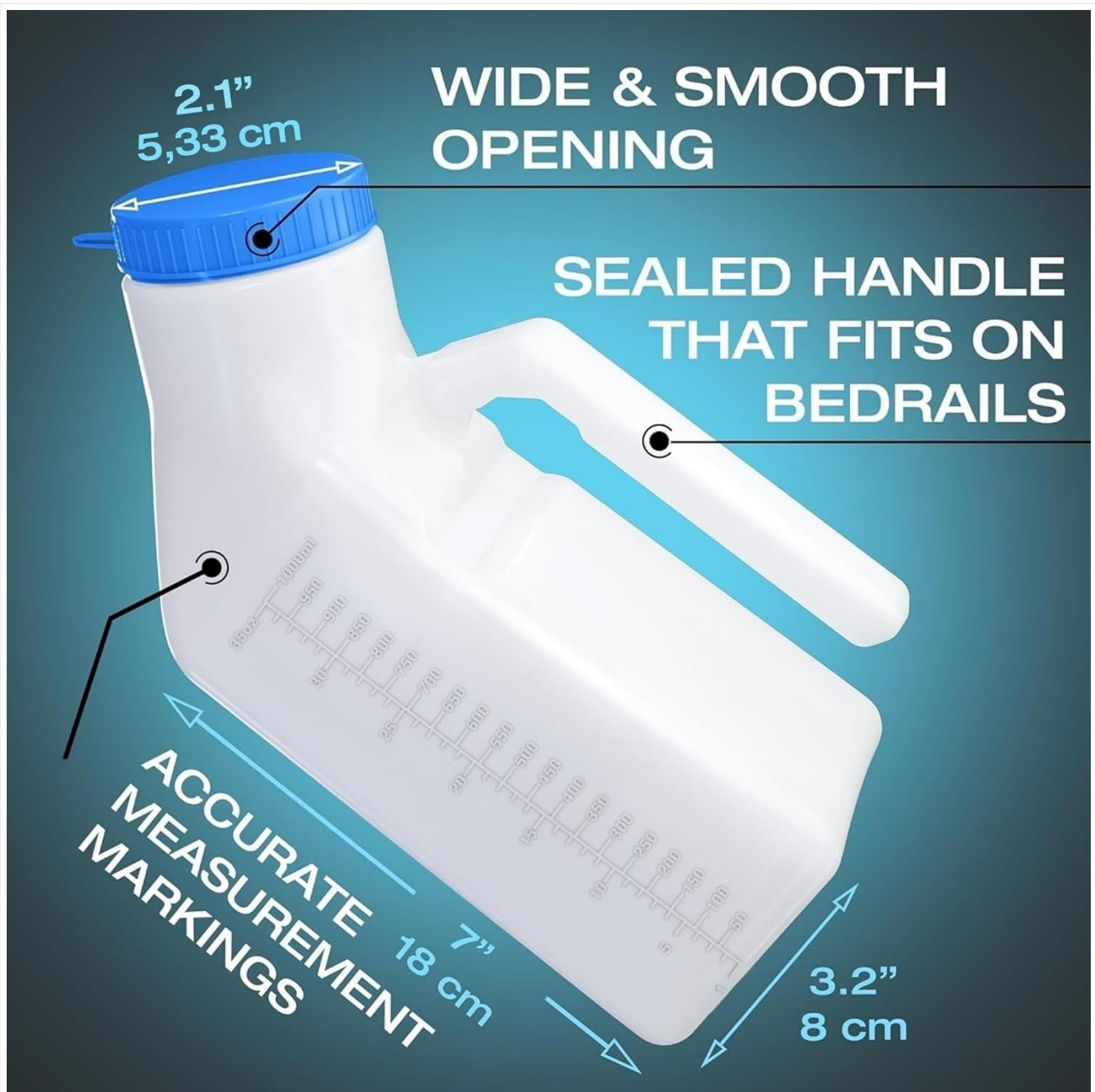
Image: Tilcare urinal with dimensions and features labeled. This image highlights the wide opening, sealed handle, and accurate measurement markings, along with specific dimensions.