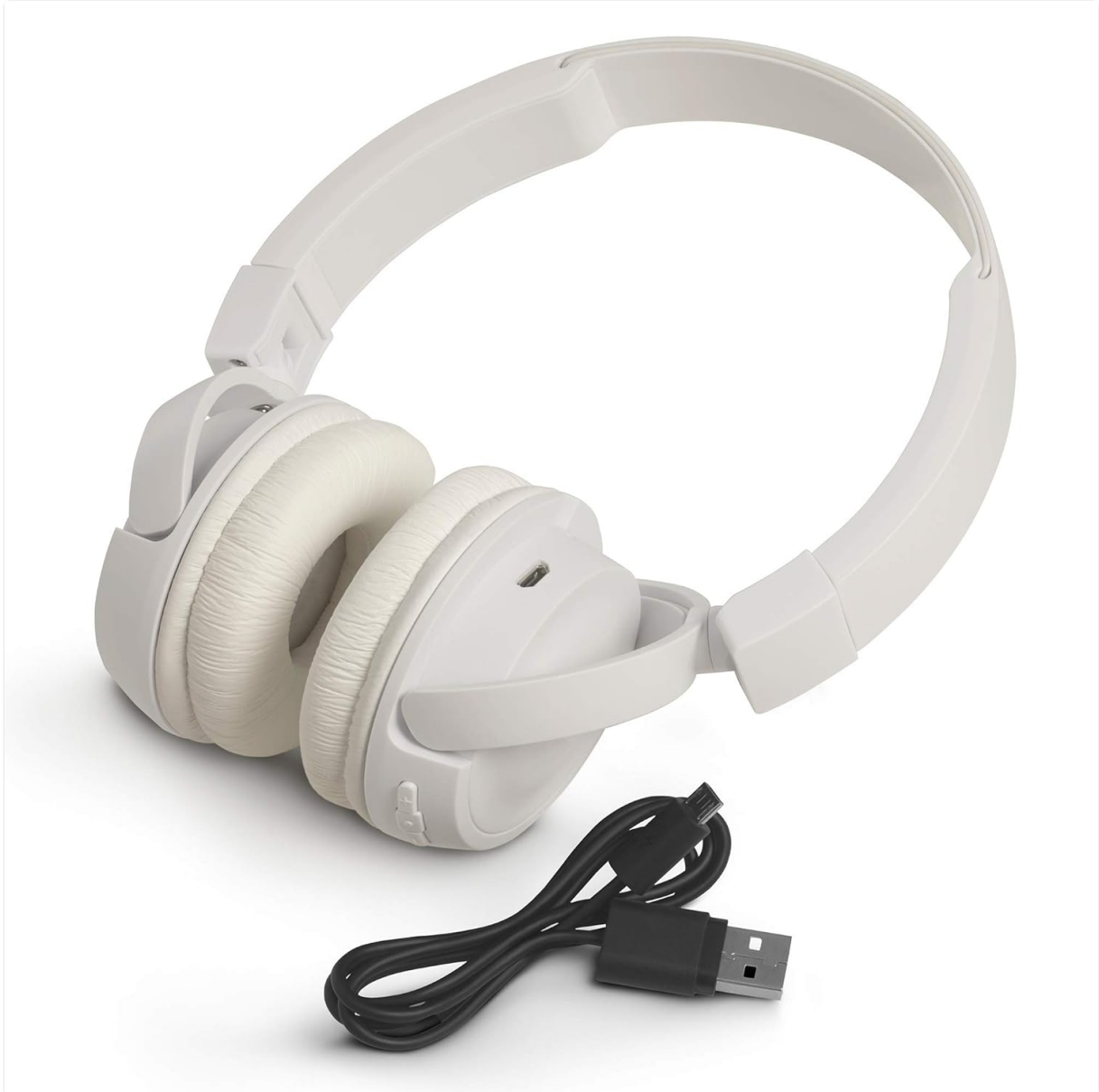
Figure 5: The JBL Tune 460BT headphones in white, displayed alongside their Micro USB charging cable. This image shows the charging port location and the cable provided for recharging the device.

Enjoy up to 11 hours of continuous playtime on a single charge under optimal audio settings. When the battery is low, connect the included Micro USB charging cable to the charging port on the earcup and a power source.