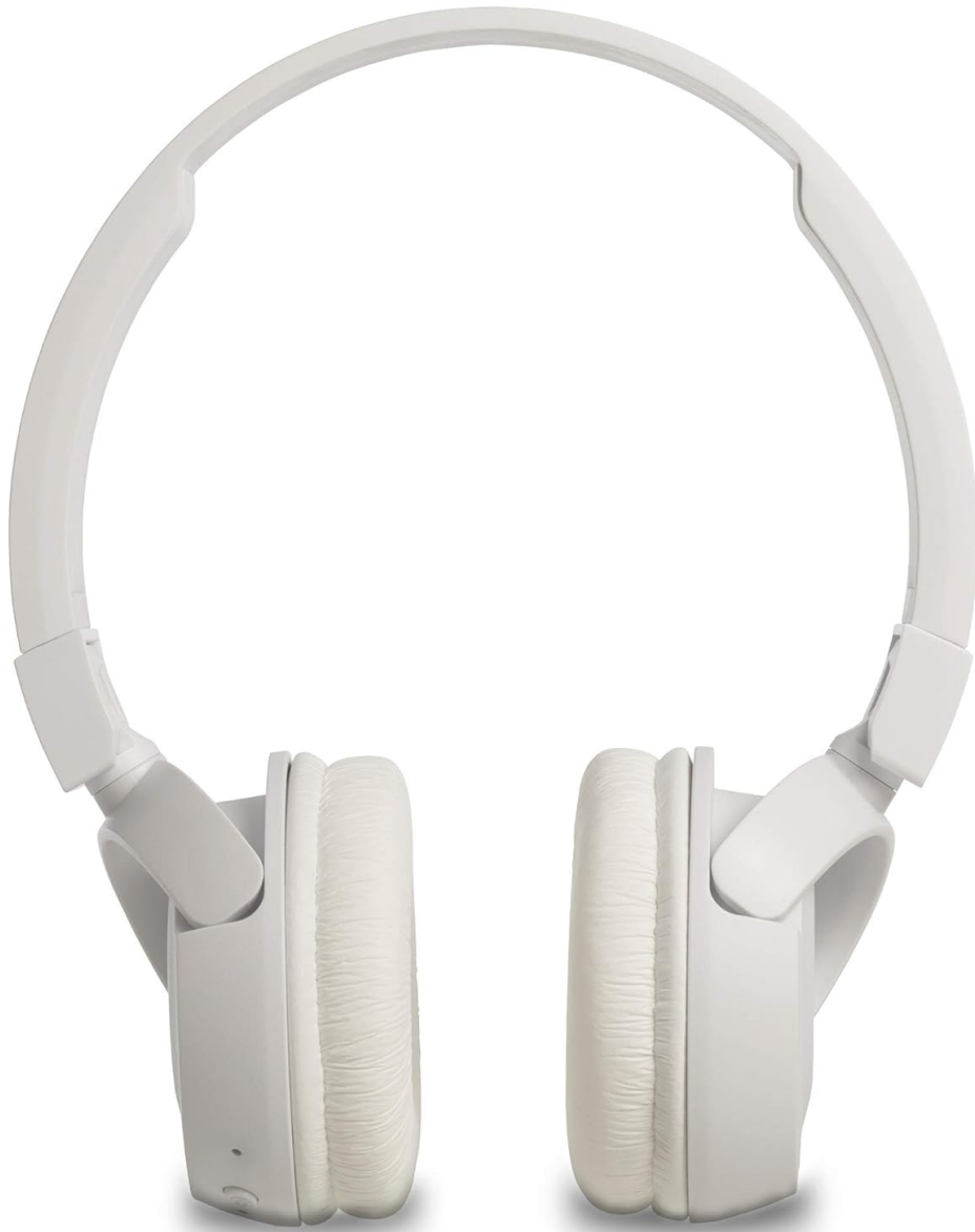
Figure 1: Front view of the JBL Tune 460BT Wireless On-Ear Headphones in white. These headphones feature a sleek design with soft earcups and an adjustable headband, emphasizing comfort and portability.