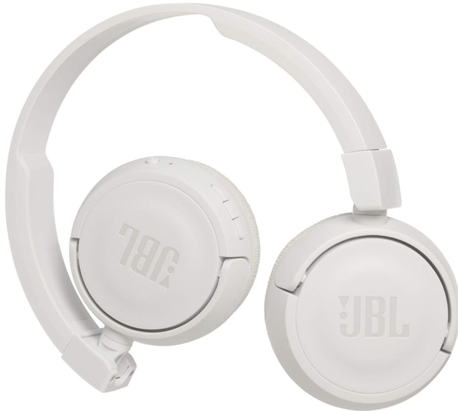
Figure 2: The JBL Tune 460BT headphones in white, with icons illustrating Pure Bass Sound, 11 hours of battery life, and flat-foldable lightweight comfort. This image highlights the core benefits of the headphones.

Your browser does not support the video tag.