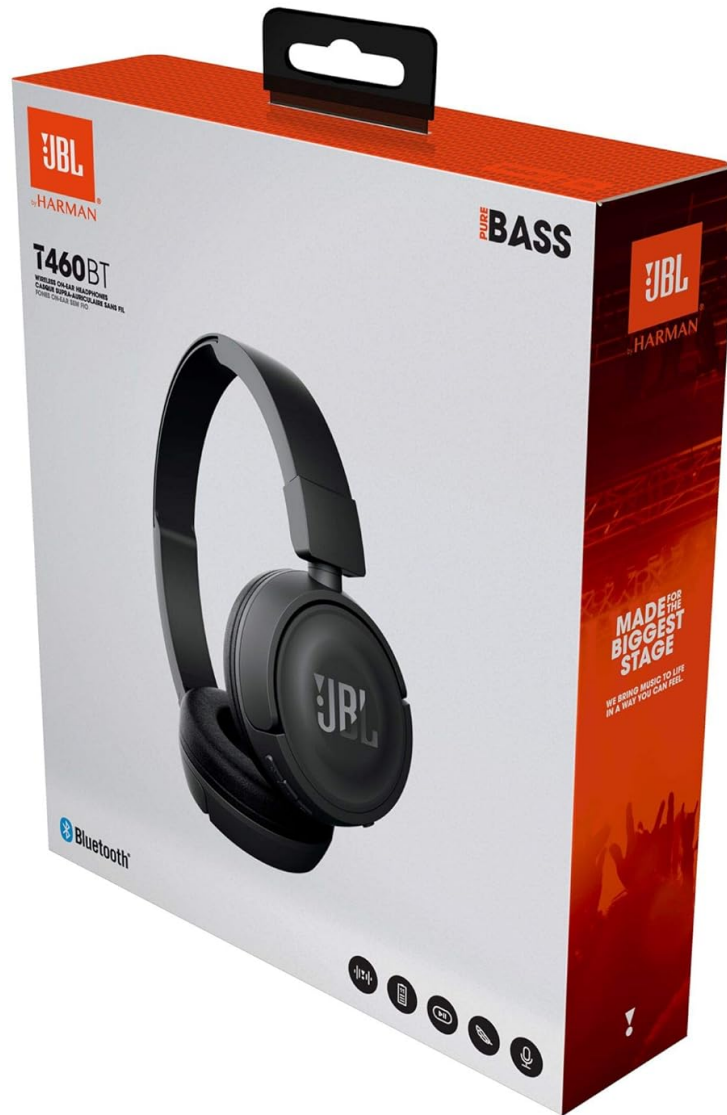
Figure 3: The JBL T460BT headphones shown in their retail packaging, which typically includes the headphones, charging cable, and documentation.

Your browser does not support the video tag.