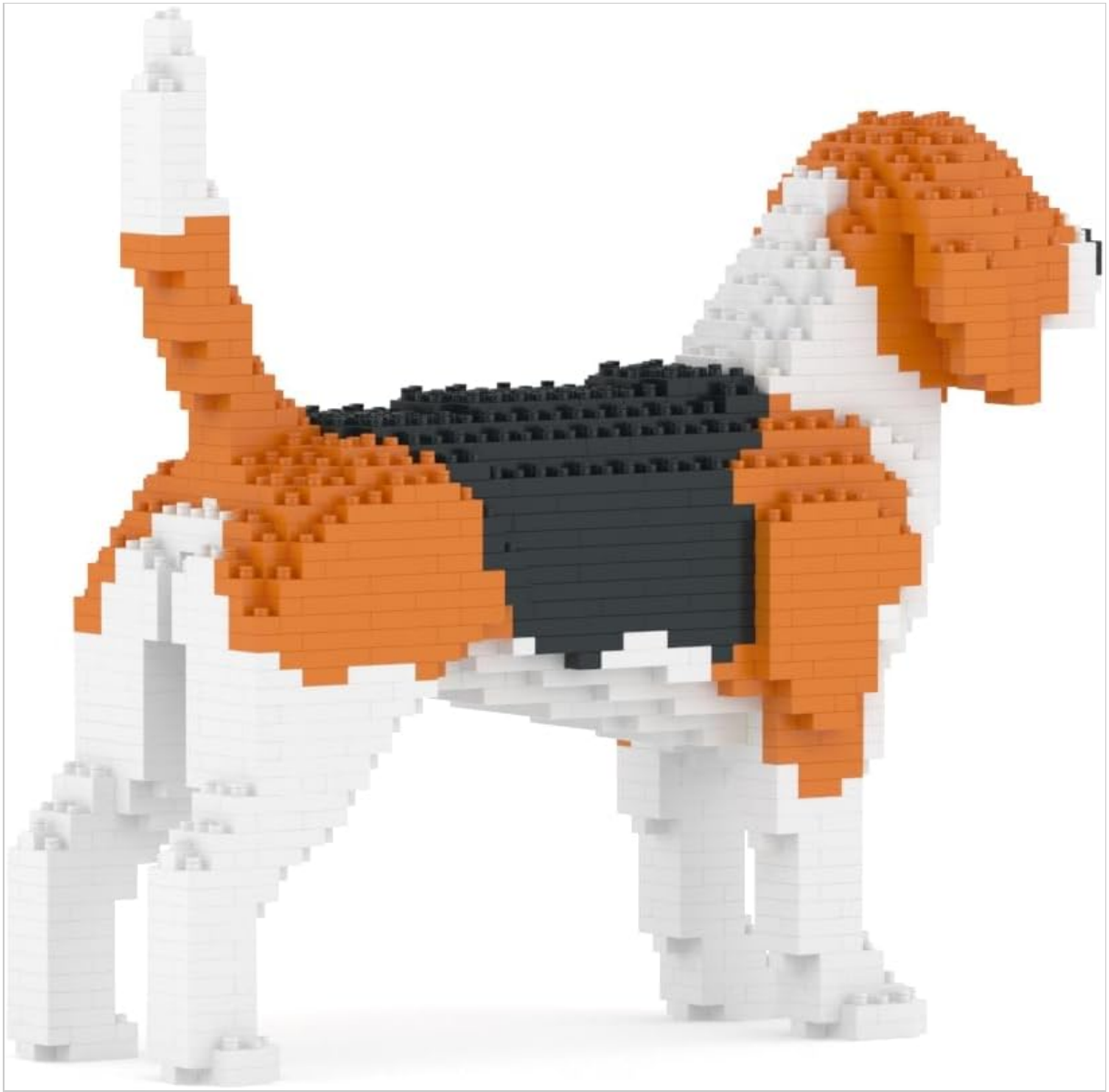
Image: Side view of the assembled JEKCA Beagle 01S model, highlighting its block construction and tri-color pattern.