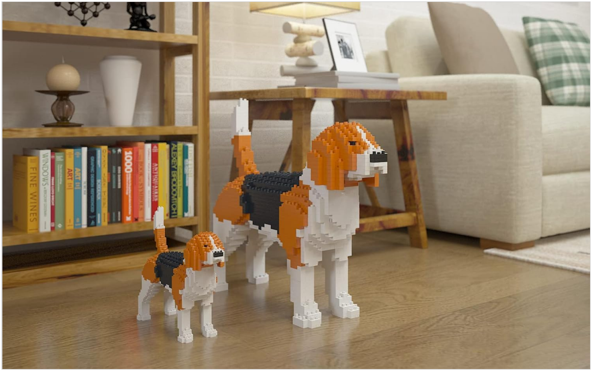
Image: Two JEKCA Beagle models, one large and one small, displayed in a living room setting, showcasing the finished product.