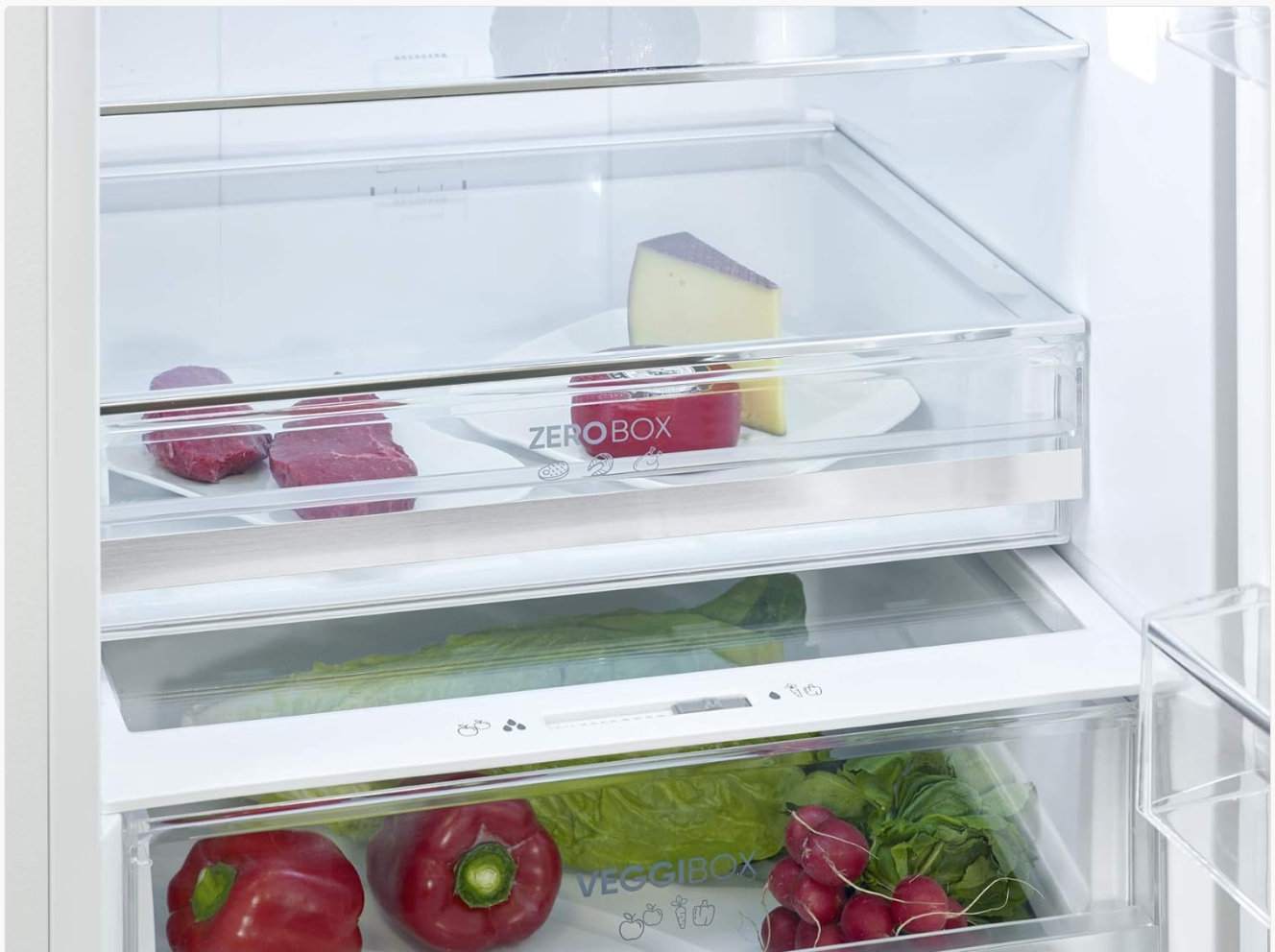
Image: Detailed view of the ZeroBox and VeggiBox drawers, designed for optimal storage of specific food types.