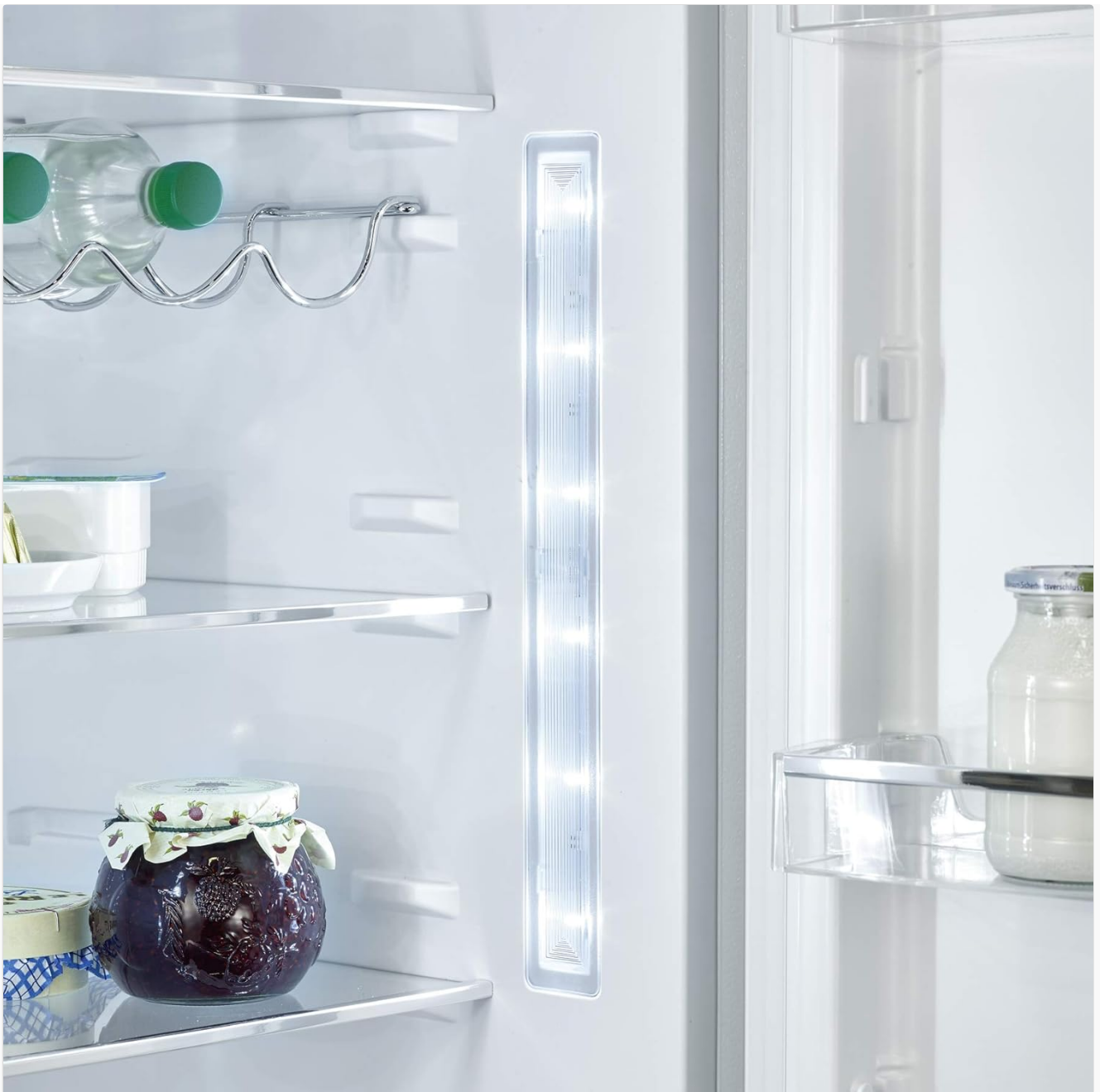
Image: Interior LED lighting and a chrome bottle rack for horizontal storage of bottles.