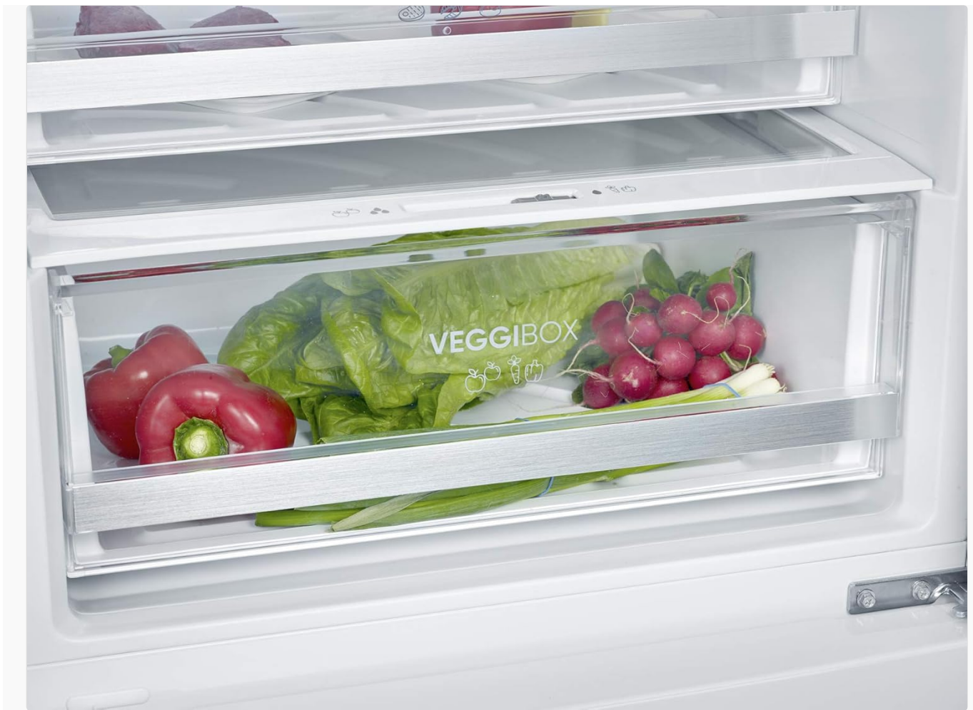
Image: The VeggiBox drawer, shown with various fresh vegetables, highlighting its capacity and design.