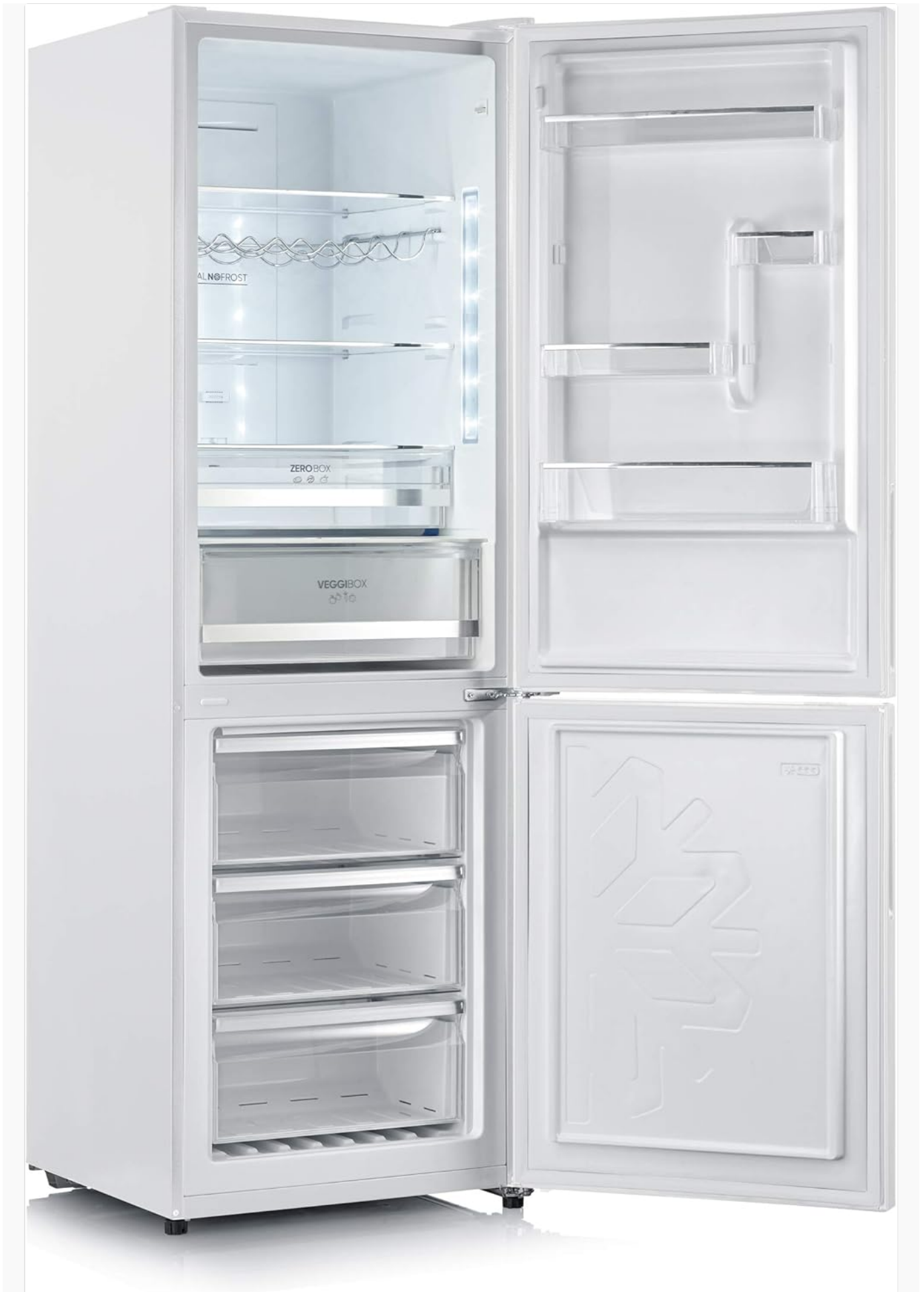
Image: Interior view of the Severin KGK 8941 with both refrigerator and freezer doors open, showcasing shelves, drawers, and door bins.